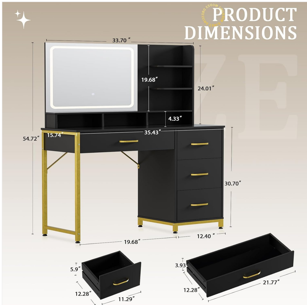
Image: Detailed dimensions of the vanity desk components.