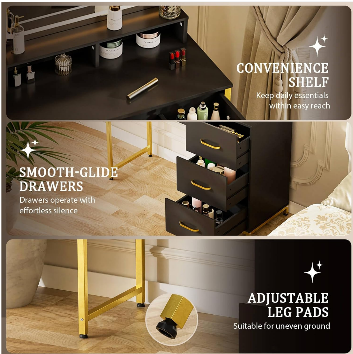
Image: Details on convenient shelves, smooth-glide drawers, and adjustable leg pads.