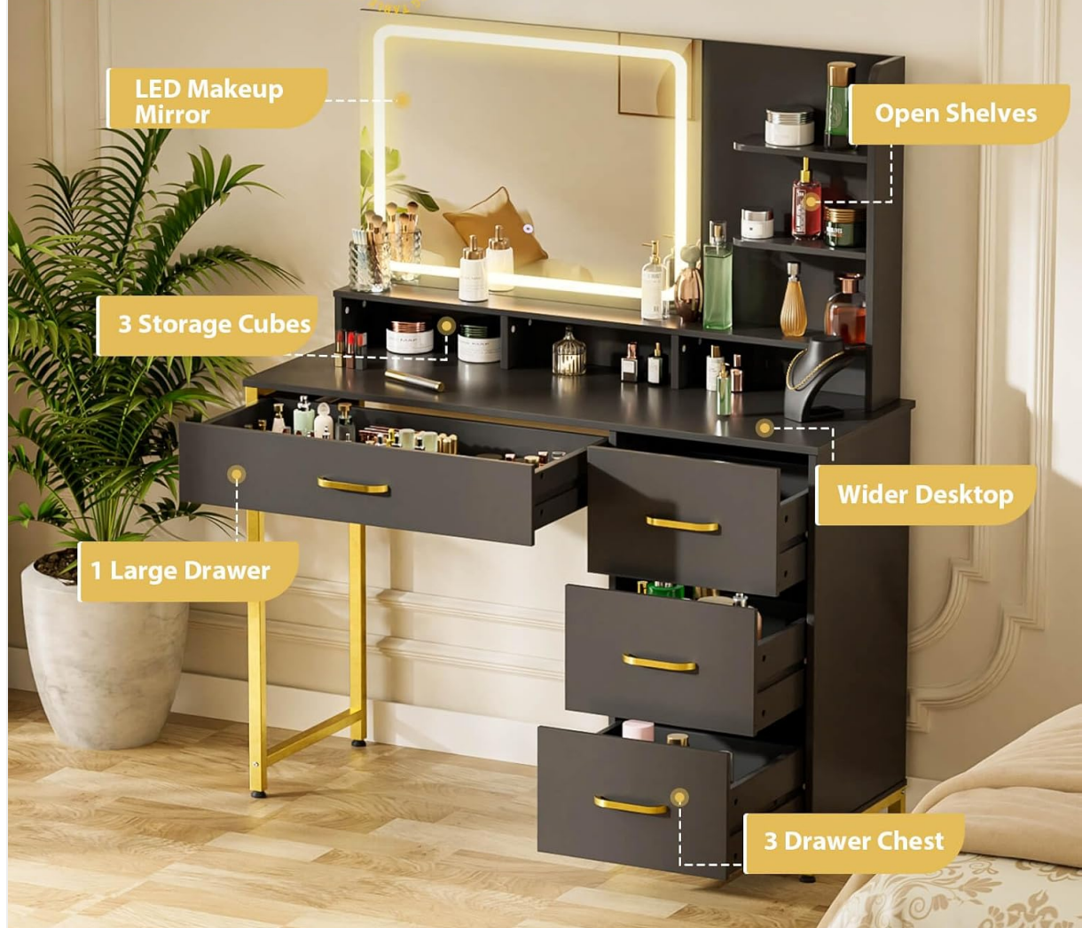
Image: Overview of the vanity's storage compartments, including drawers and open shelves.