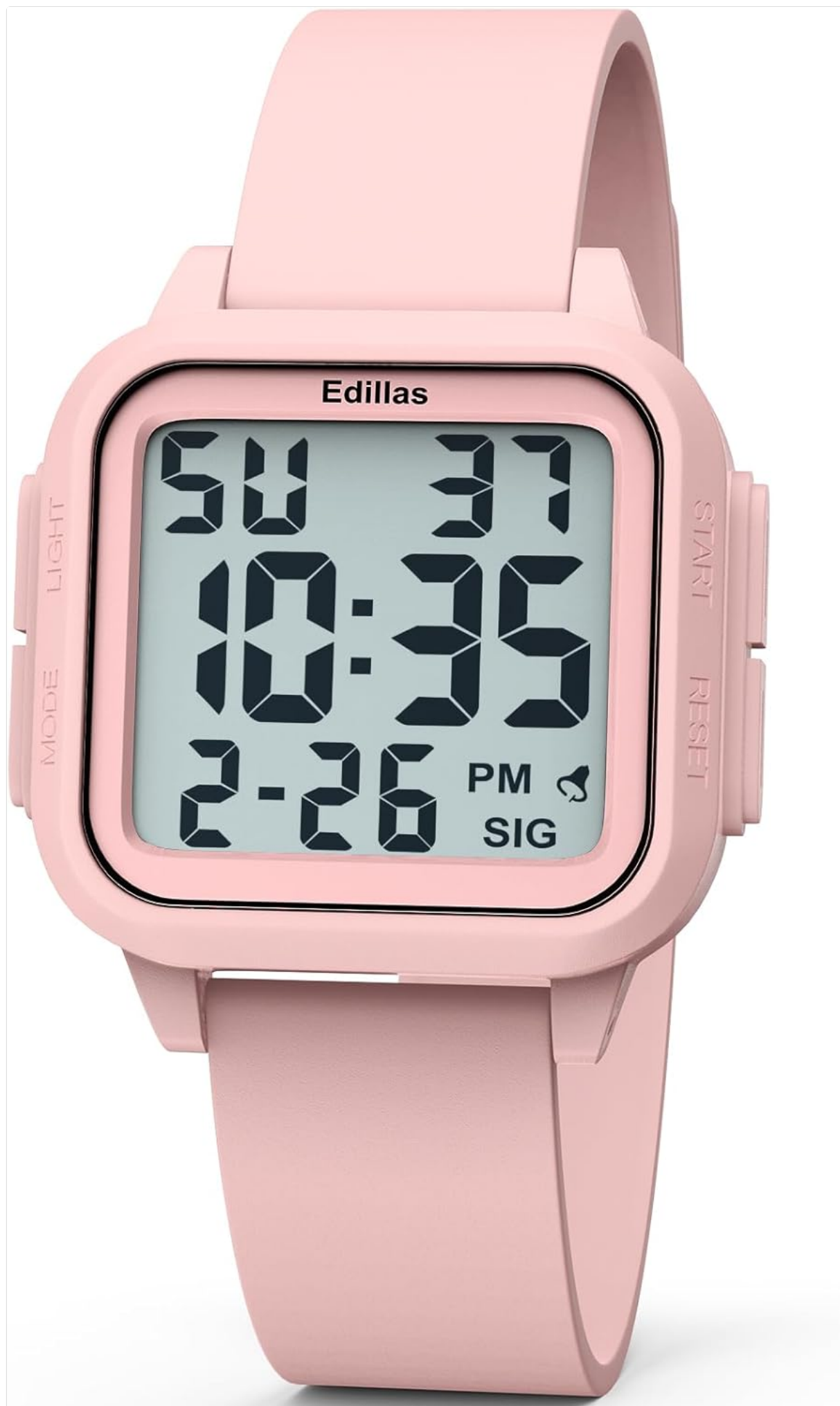
Image 1.1: Edillas Square Digital Sport Watch Model 461D (Light Pink)