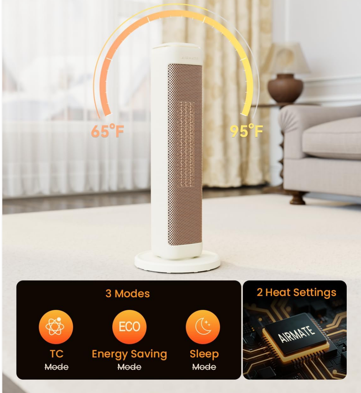
Image: The heater's control panel displaying temperature range (65°F-95°F) and available modes (TC, Energy Saving, Sleep).