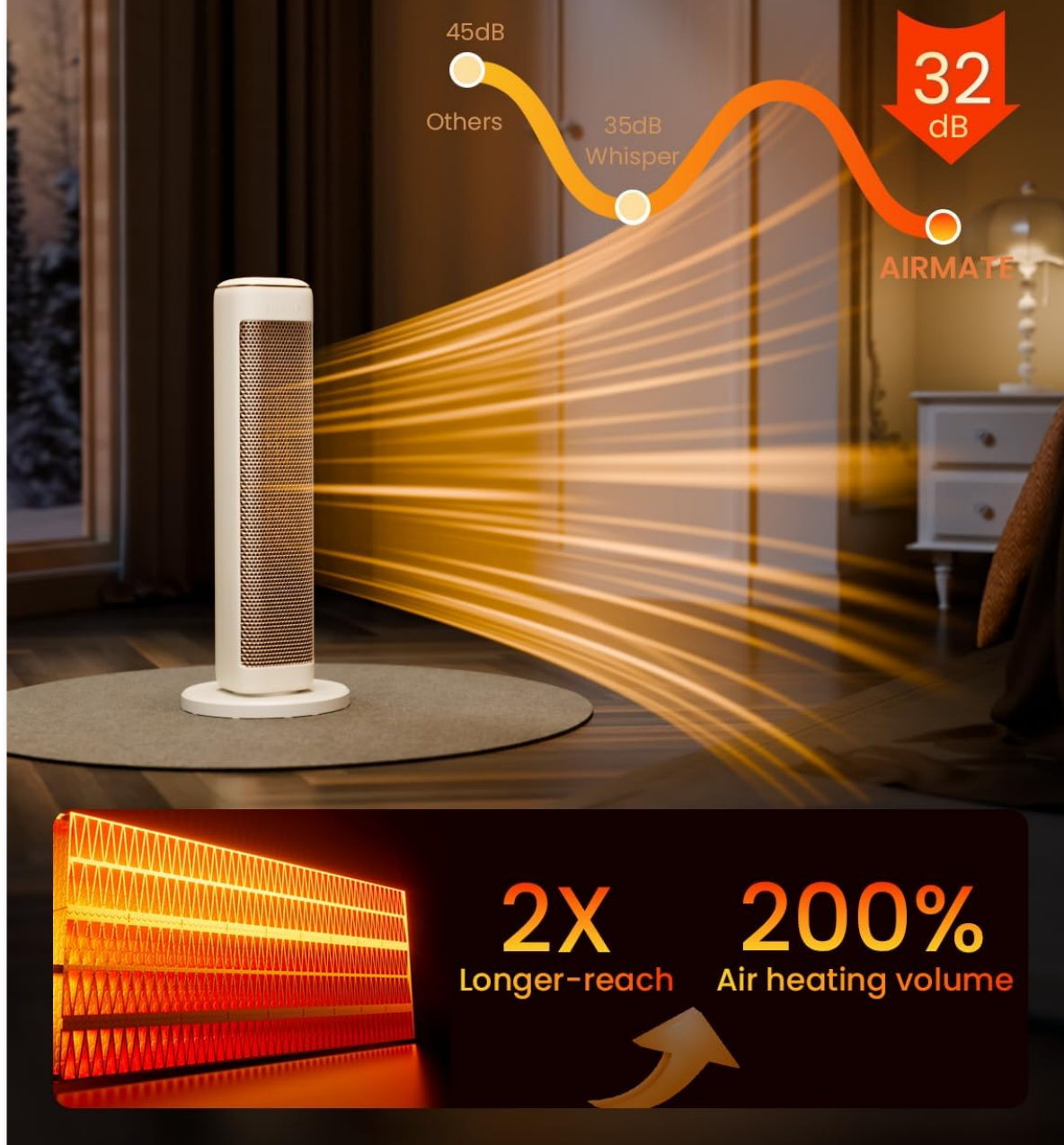
Image: Illustration of the heater's quiet operation at 32dB and its ability to provide heat with 2x longer reach.