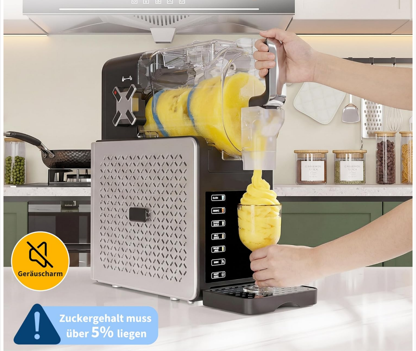
Figure 4: The control panel with options for Slush, Frappe, Spiked Slush, Milkshake, Frozen Juice, Rinse, and Night Mode, along with intensity levels 1-10.