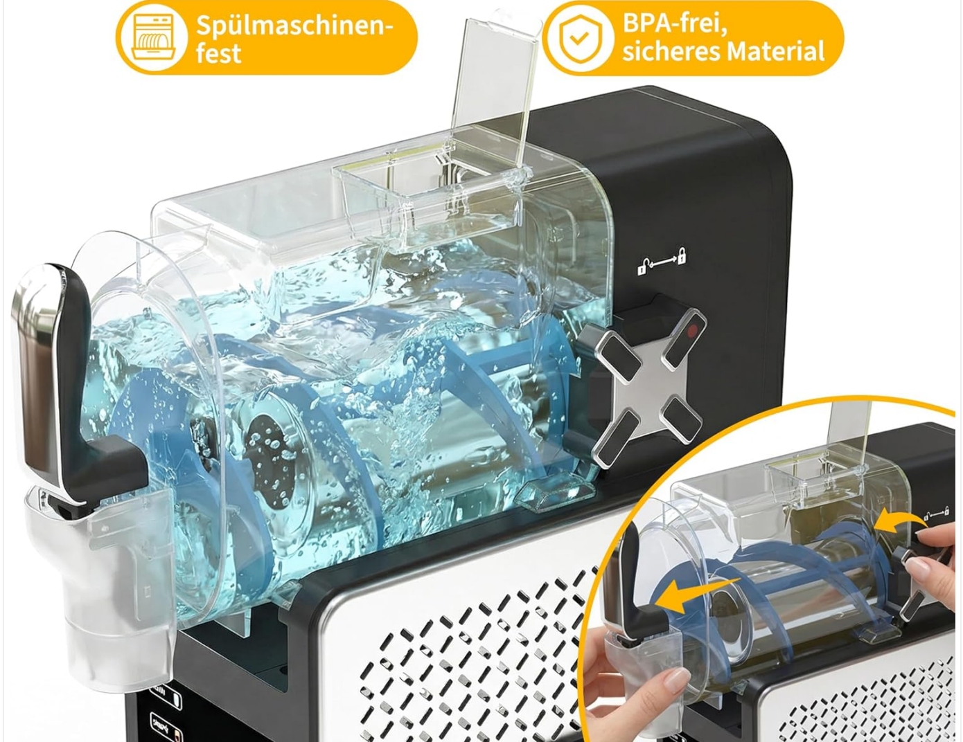
Figure 7: Cleaning features of the Garvee FS-201, including self-cleaning, removable and washable components, dishwasher-safe parts, and BPA-free materials.