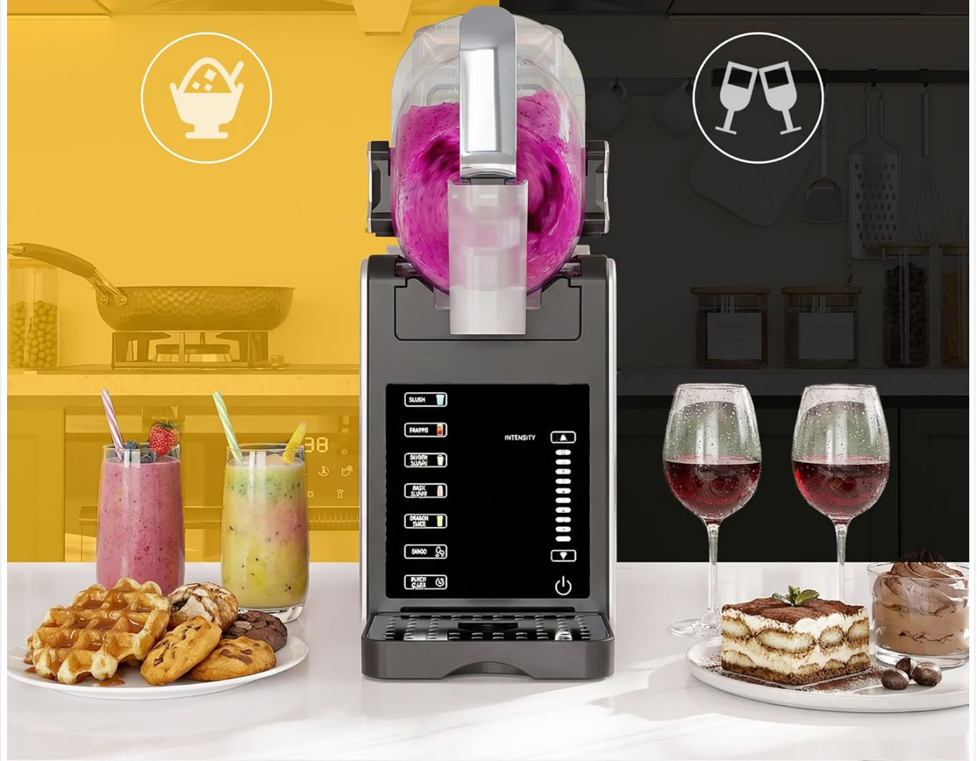
Figure 6: The Garvee FS-201 is suitable for use from morning (smoothies) to night (desserts/cocktails), with a night mode for freshness.

Morgens Smoothies, abends leichte alkoholische Genüsse. Über Nacht frisch halten – morgens sofort genießen.