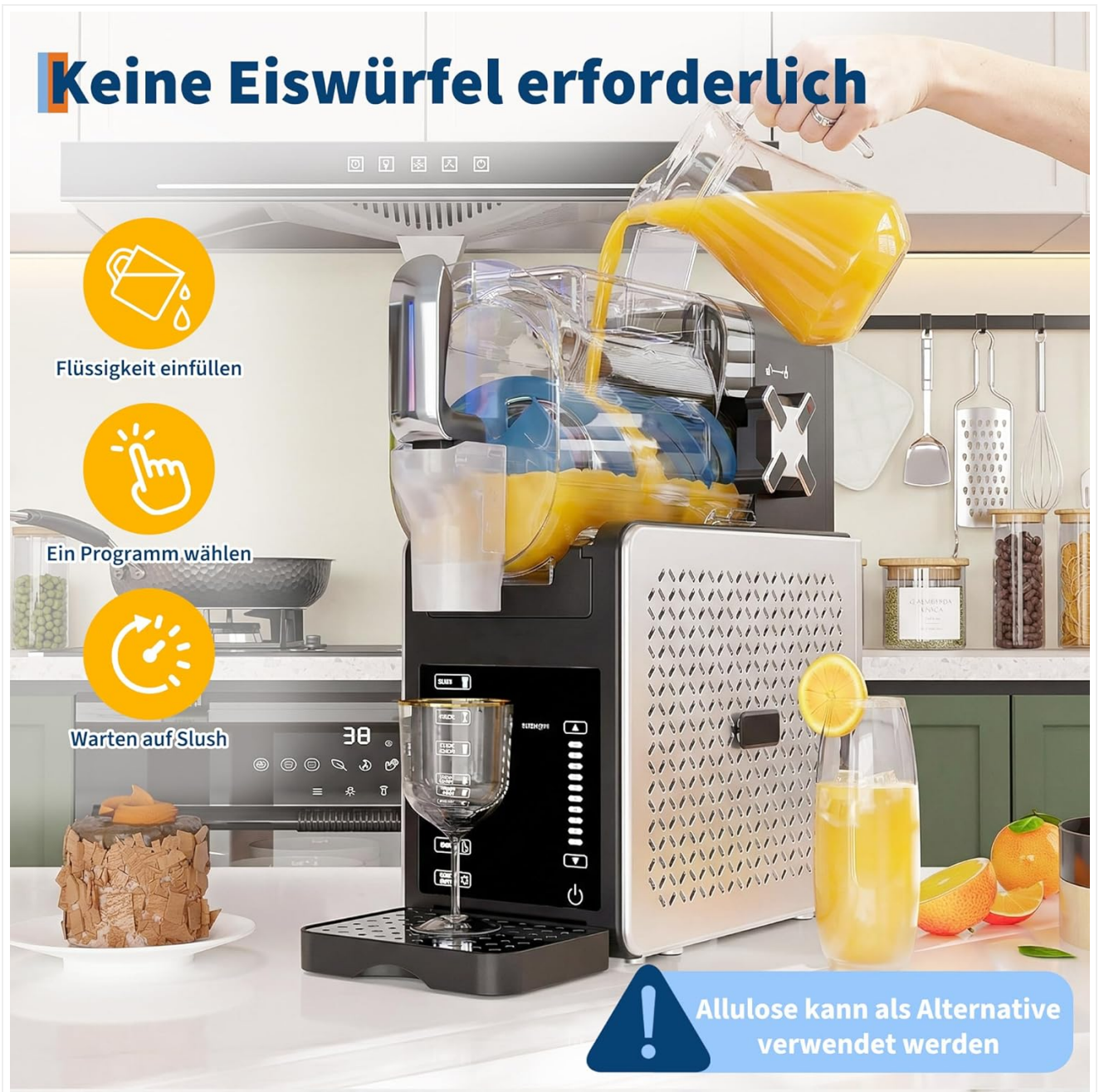
Figure 3: Adding liquid mixture to the machine. Note: Allulose can be used as an alternative sweetener.