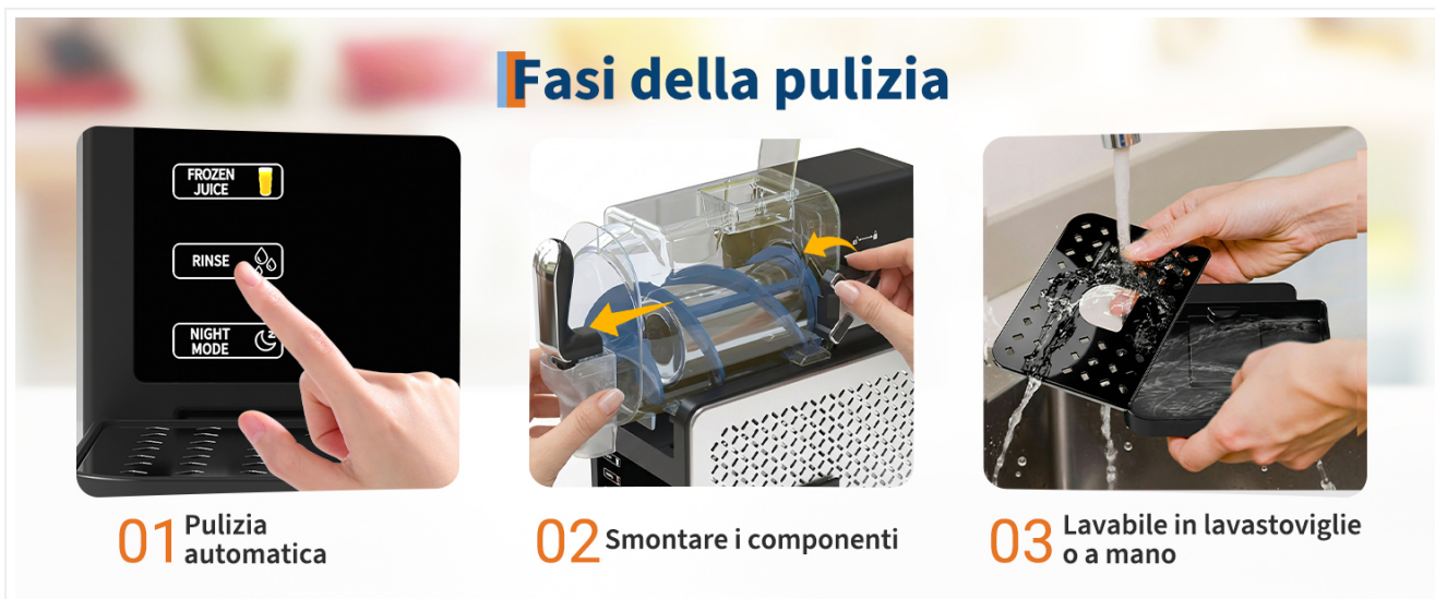
Figure 8: The cleaning process, starting with automatic cleaning via the "Rinse" function.