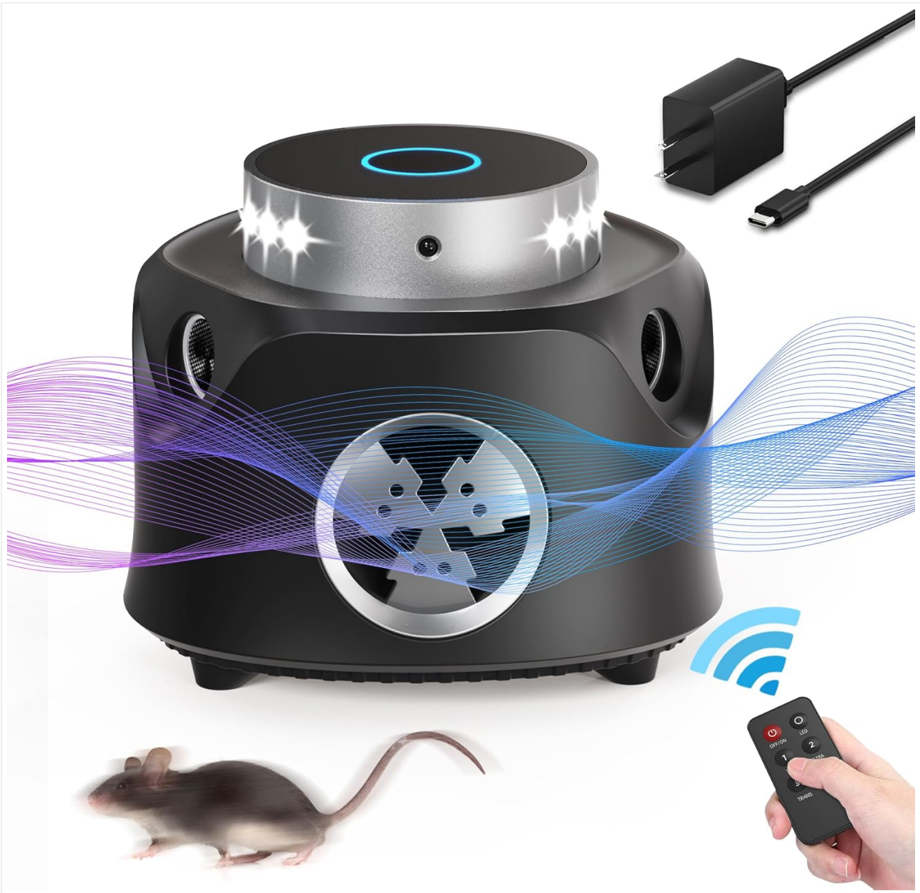
Image: The X-PEST Ultrasonic Pest Repeller UR03, featuring its compact design, remote control, and power adapter.