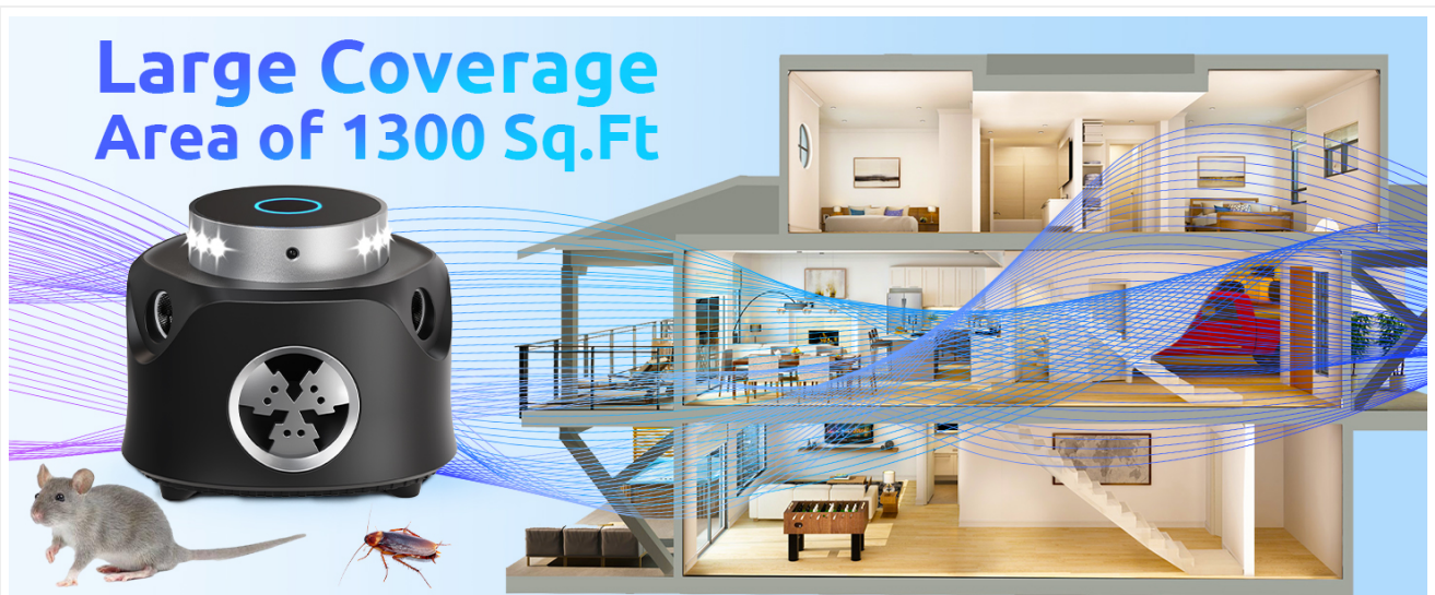
Image: The device provides a large coverage area, suitable for multi-level homes.