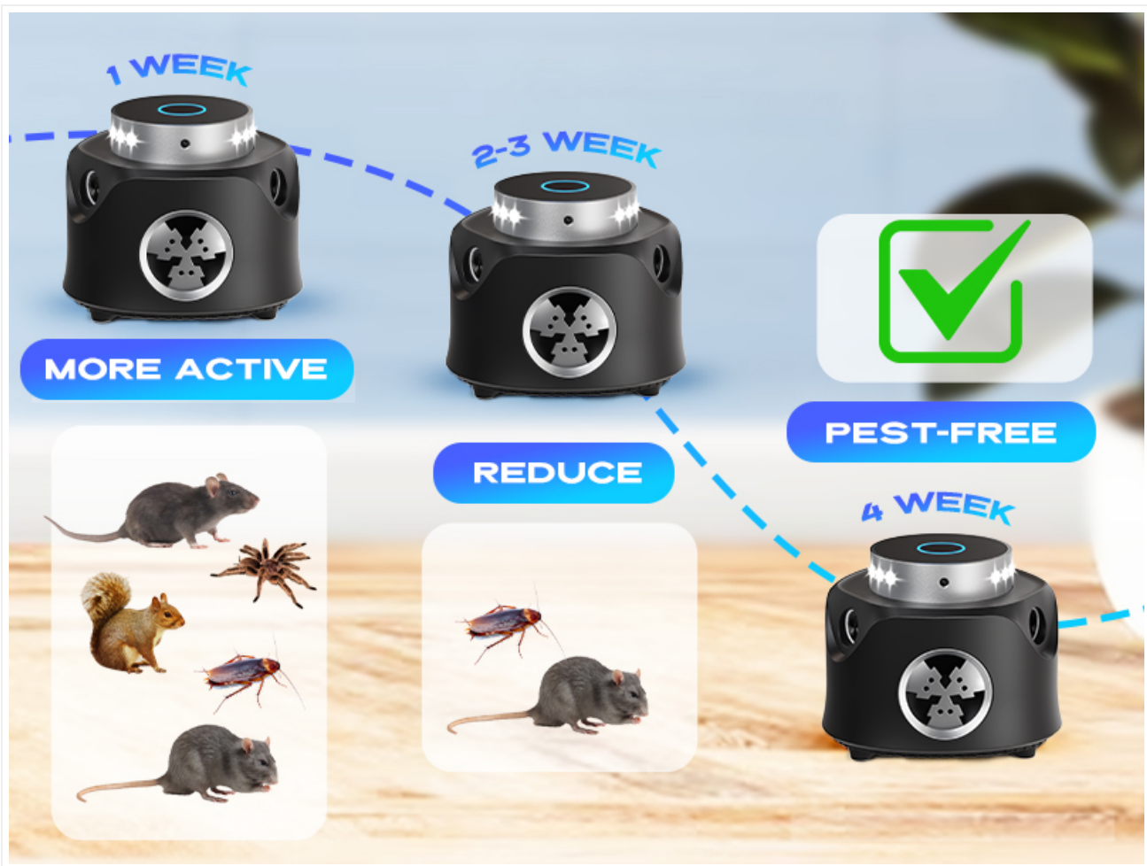
Image: Visual representation of pest reduction over a 4-week period.