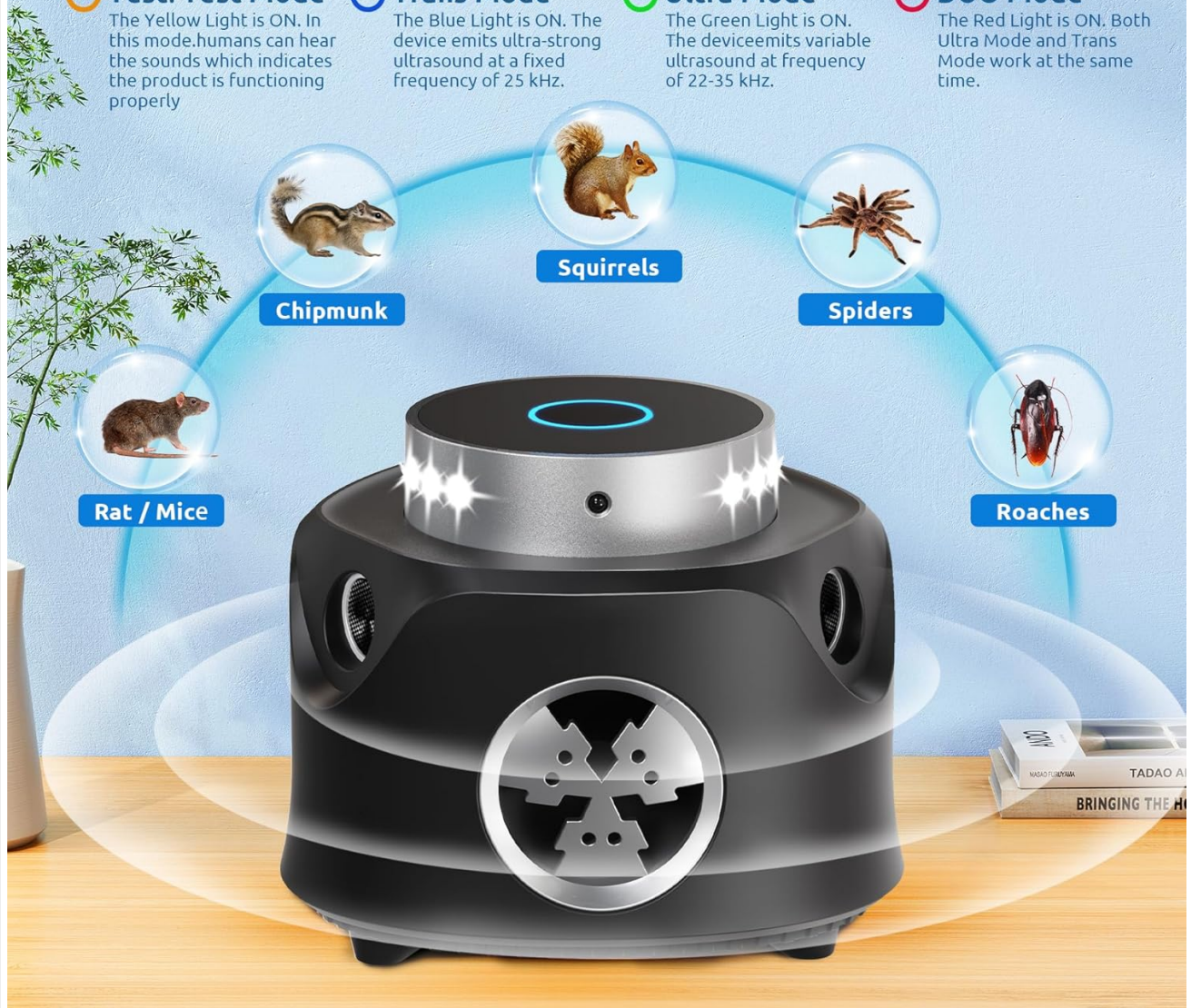
Image: Overview of the different operating modes and their targeted pests.

The Red Light is ON. Both Ultra Mode and Trans Mode work at the same time.