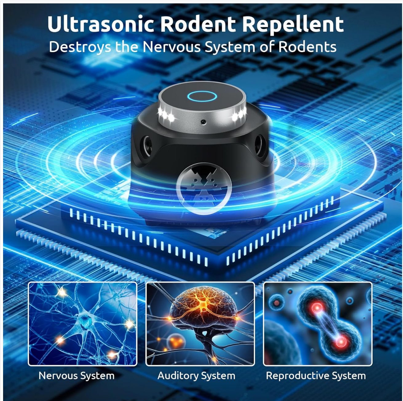
Image: The device's ultrasonic waves target the nervous, auditory, and reproductive systems of rodents.