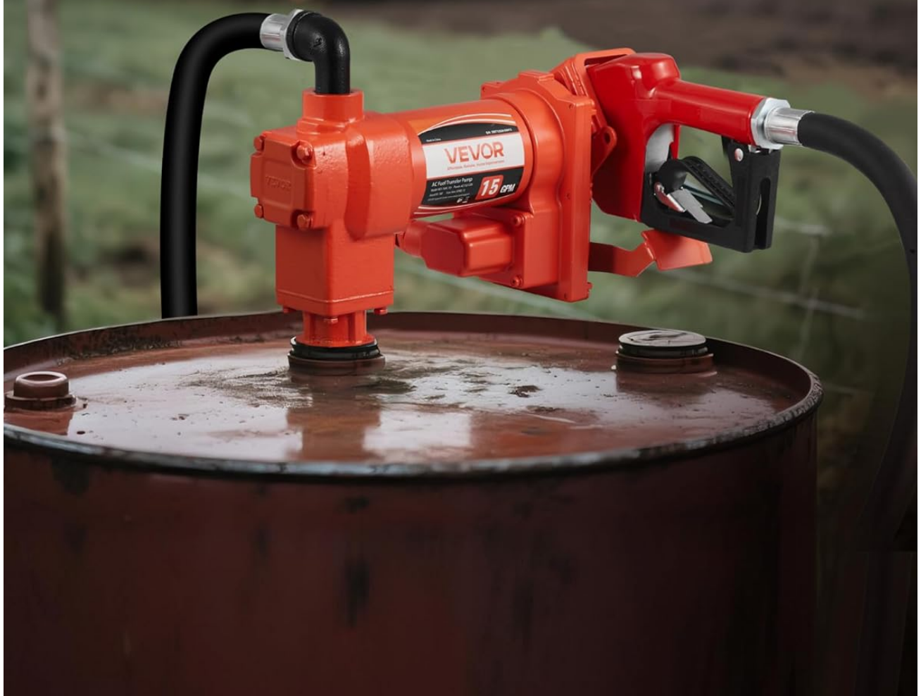
Image: The fuel transfer pump ready for operation, demonstrating its robust cast iron construction suitable for outdoor use.