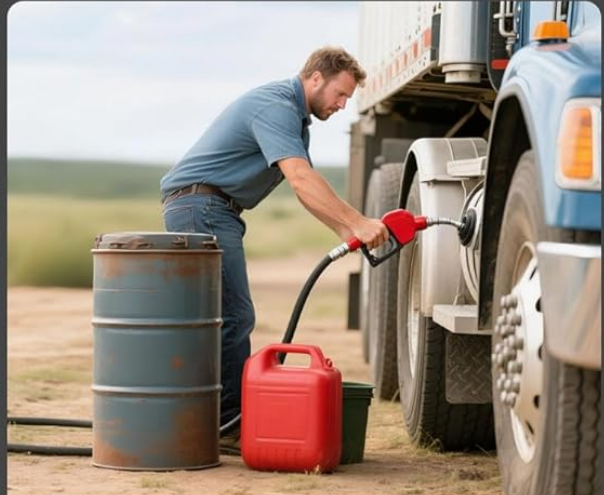
Refueling Heavy Trucks