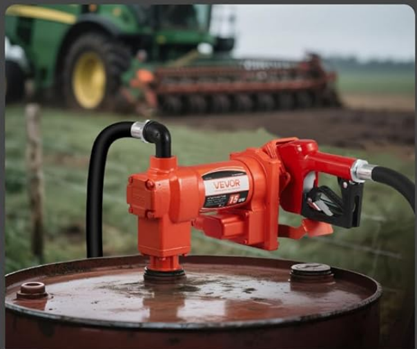
Drawing Fuel from Drums

Image: Various applications of the VEVOR Fuel Transfer Pump, including refueling large vehicles and machinery.