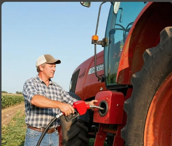
Refueling Agricultural Machinery