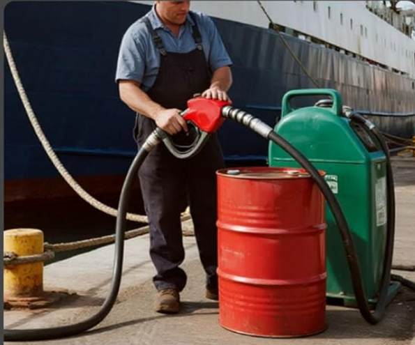
Refueling Large Ships

✓ Gasoline ✓ Diesel ✓ Kerosene ✓ Biodiesel ✓ Ethanol