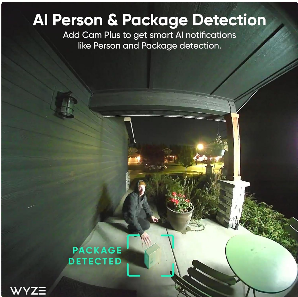
Image 4.2: Illustrates the AI Person & Package Detection feature, showing a person placing a package on a porch with a 'PACKAGE DETECTED' notification.

Add Cam Plus to get smart AI notifications like Person and Package detection.