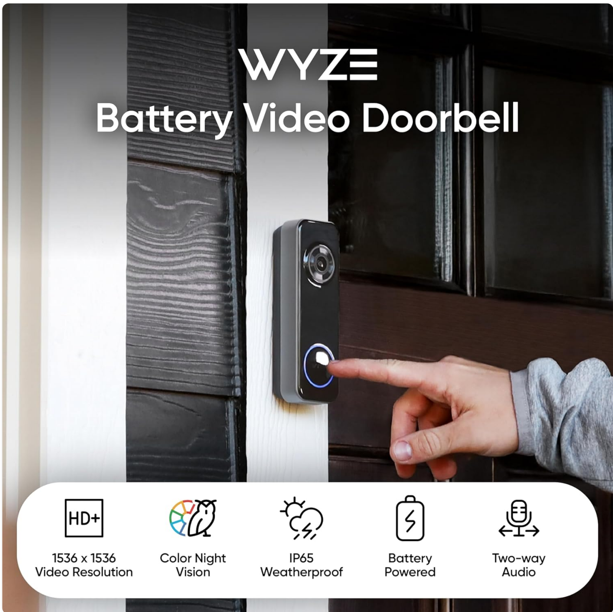
Image 1.1: Wyze Battery Video Doorbell showcasing 1536x1536 Video Resolution, Color Night Vision, IP65 Weatherproof rating, Battery Powered, and Two-way Audio.