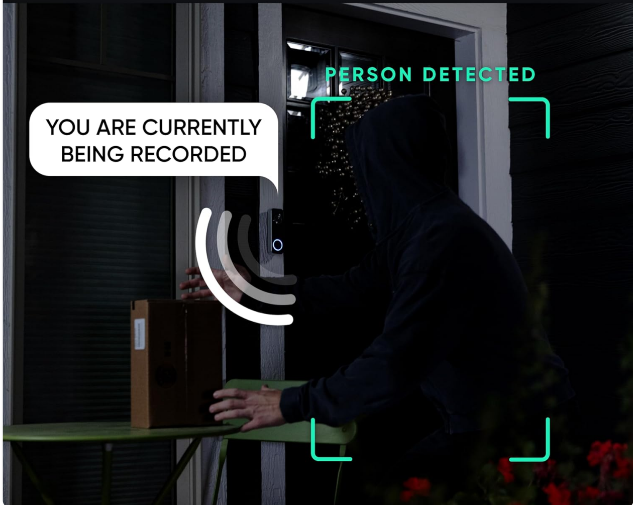
Image 4.3: Shows the Motion-Activated Voice Deterrence feature in action, with a speech bubble indicating the doorbell is informing a visitor they are being recorded.

When enabled, a voice prompt plays to alert visitors that they are being recorded.