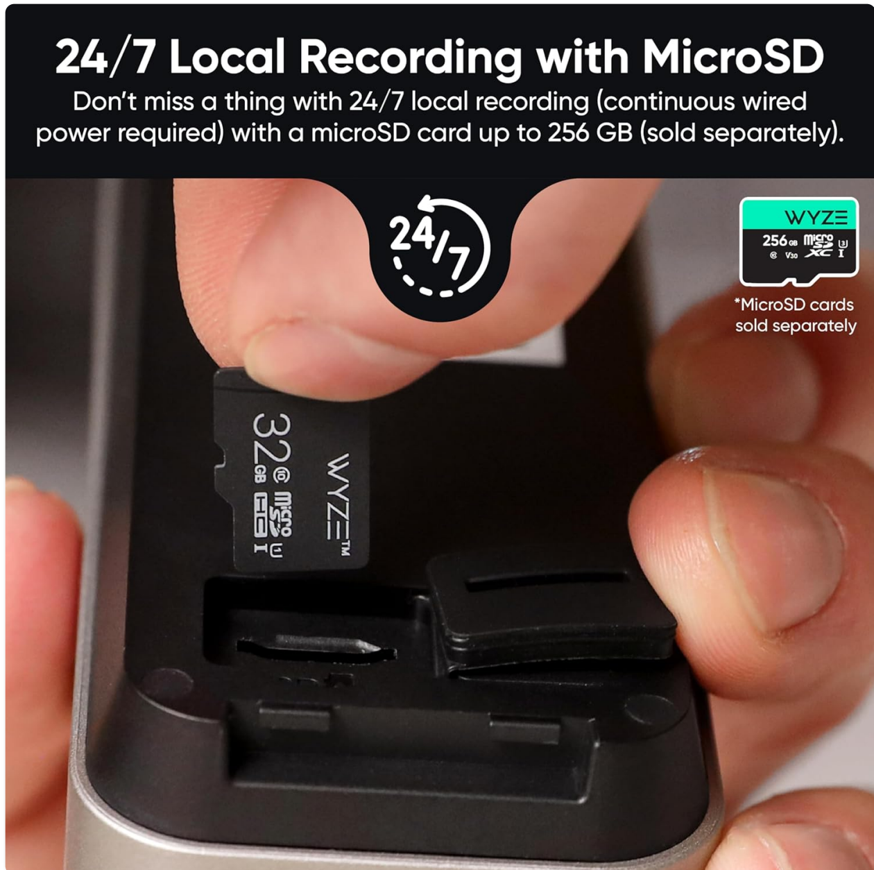
Image 5.1: Demonstrates the insertion of a Micro SD card for 24/7 local recording, highlighting that microSD cards are sold separately.