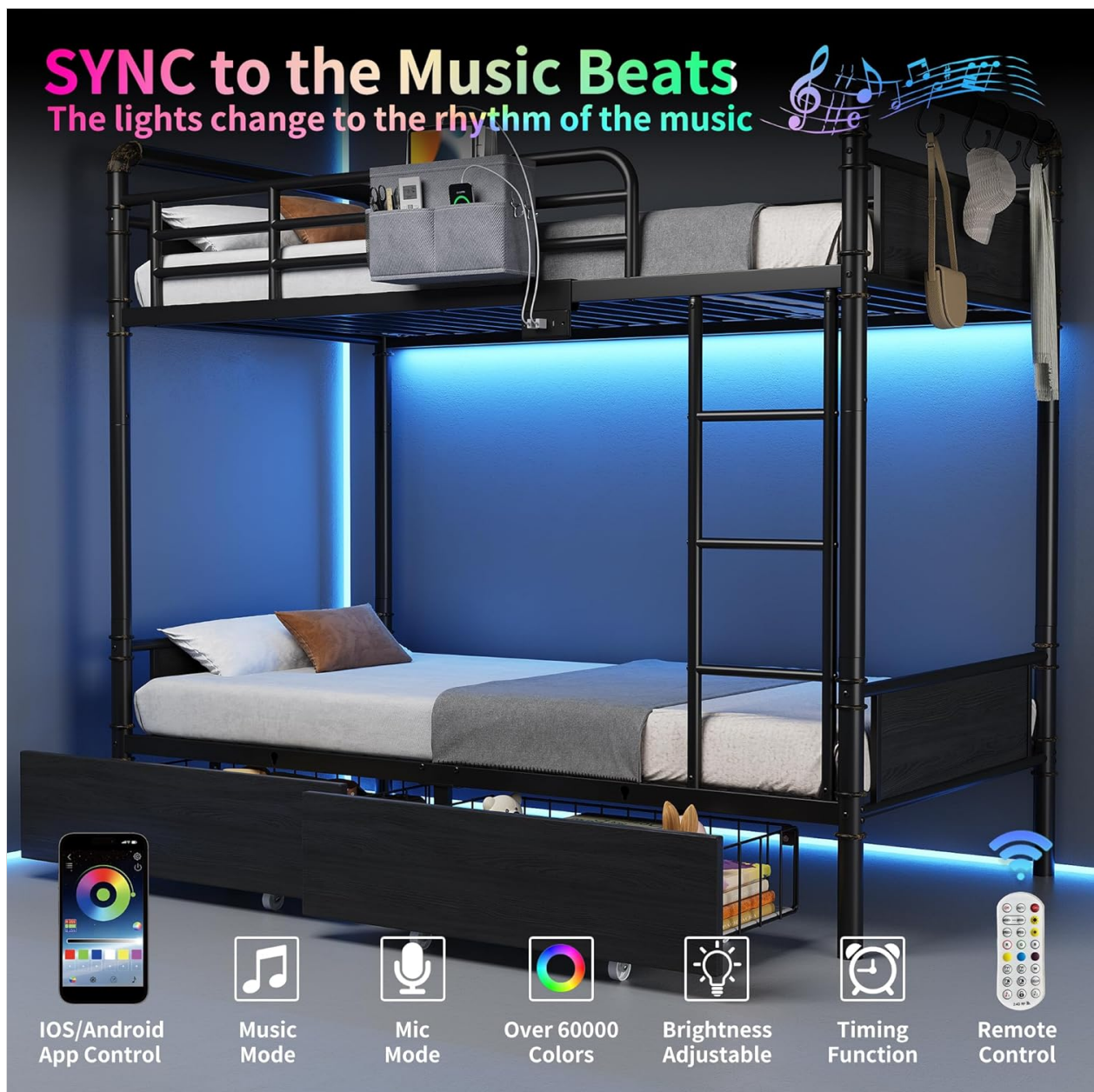
Image 5.1: The bunk bed illuminated by RGB LED lights, demonstrating the music sync feature and control options via app and remote.