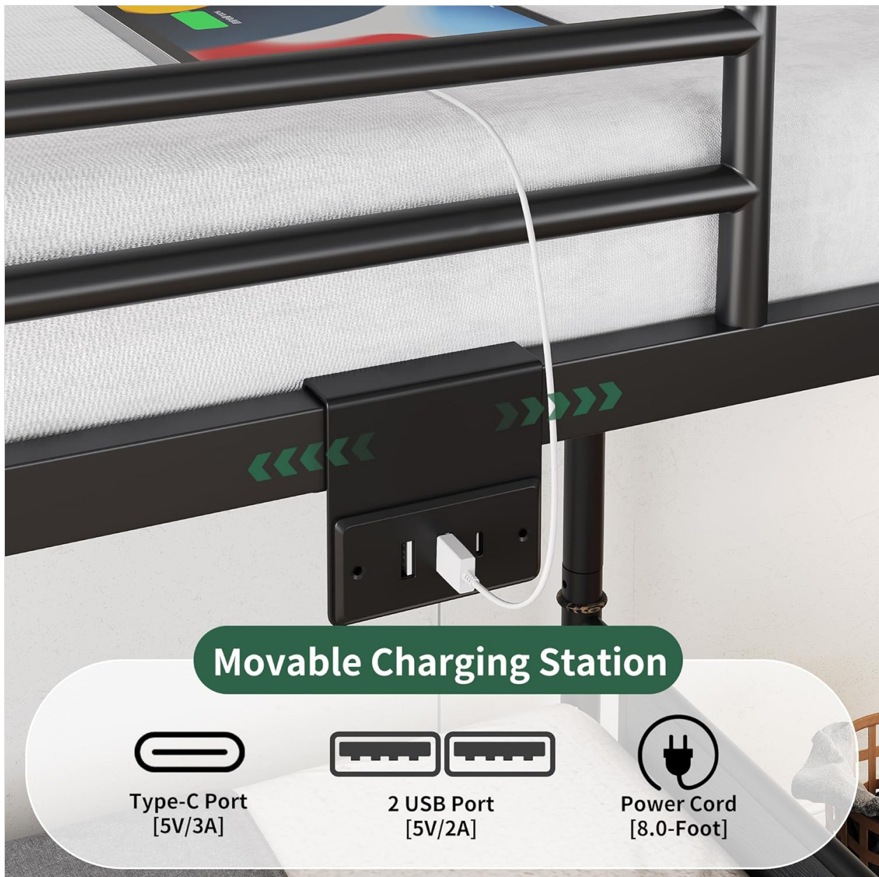
Image 5.2: Close-up view of the movable charging station, detailing its Type-C port, two USB ports, and power cord.