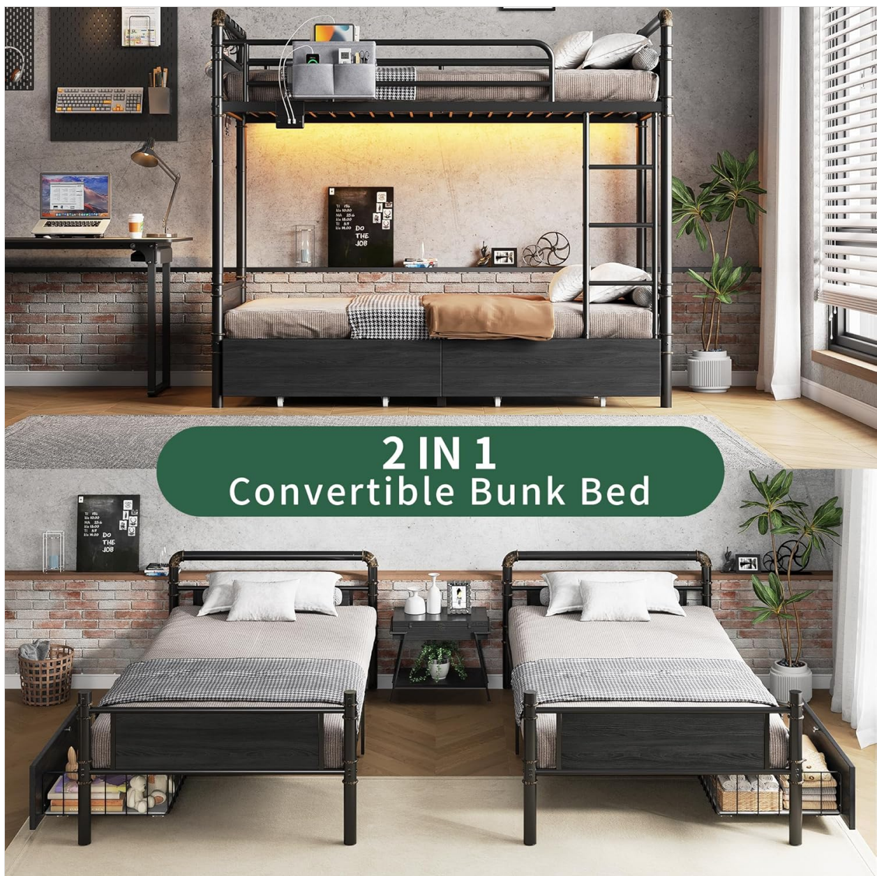
Image 5.4: Illustration demonstrating the 2-in-1 convertible feature, showing the bunk bed configuration and its transformation into two individual twin beds.