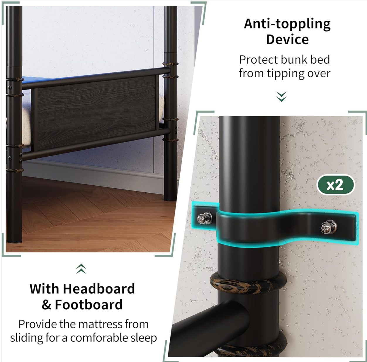
Image 2.1: Detail of the anti-toppling device for securing the bunk bed to a wall and the headboard/footboard design that prevents mattress sliding.