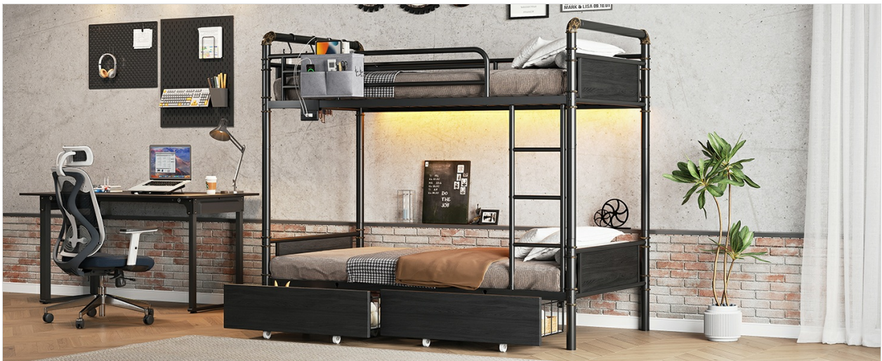
Image 1.1: The Jocoevol Metal LED Bunk Bed in a bedroom environment, showcasing its design and features.

This manual provides instructions for the assembly, operation, and maintenance of your Jocoevol Metal LED Bunk Bed Twin Over Twin. This bunk bed features a durable metal frame, integrated LED lighting, a movable USB charging station, and two storage drawers. It is designed for use with twin-sized mattresses.