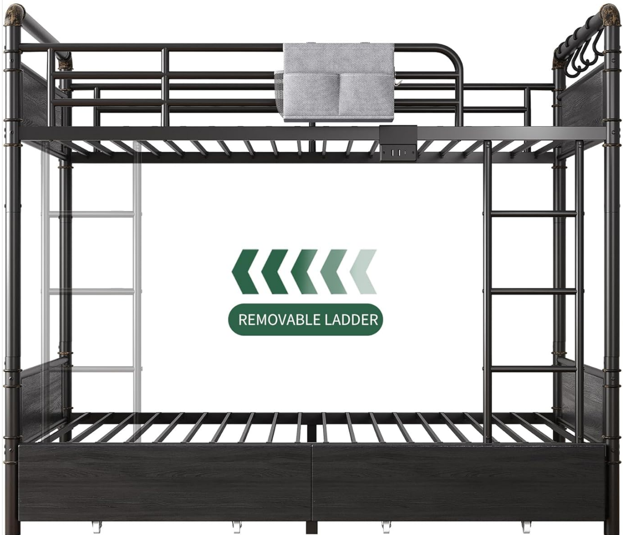
Image 5.5: Diagram illustrating the removable ladder and its ability to be repositioned on either side of the bunk bed.

Ladder can be attached to either side Adjust the ladder installation angle according to the room design