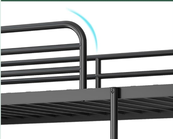
Image 5.6: Close-up views of the bedside storage organizer, movable hooks, high safety guardrails, and round guard corners.