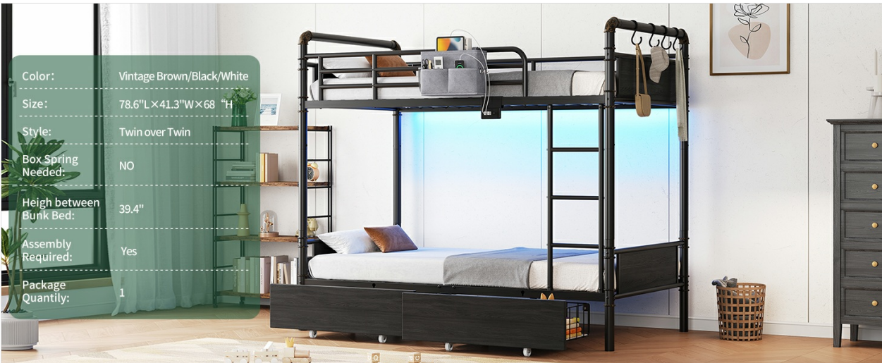
Image 8.1: A visual summary of the bunk bed's key specifications, including color, size, style, dimensions, and assembly requirements.