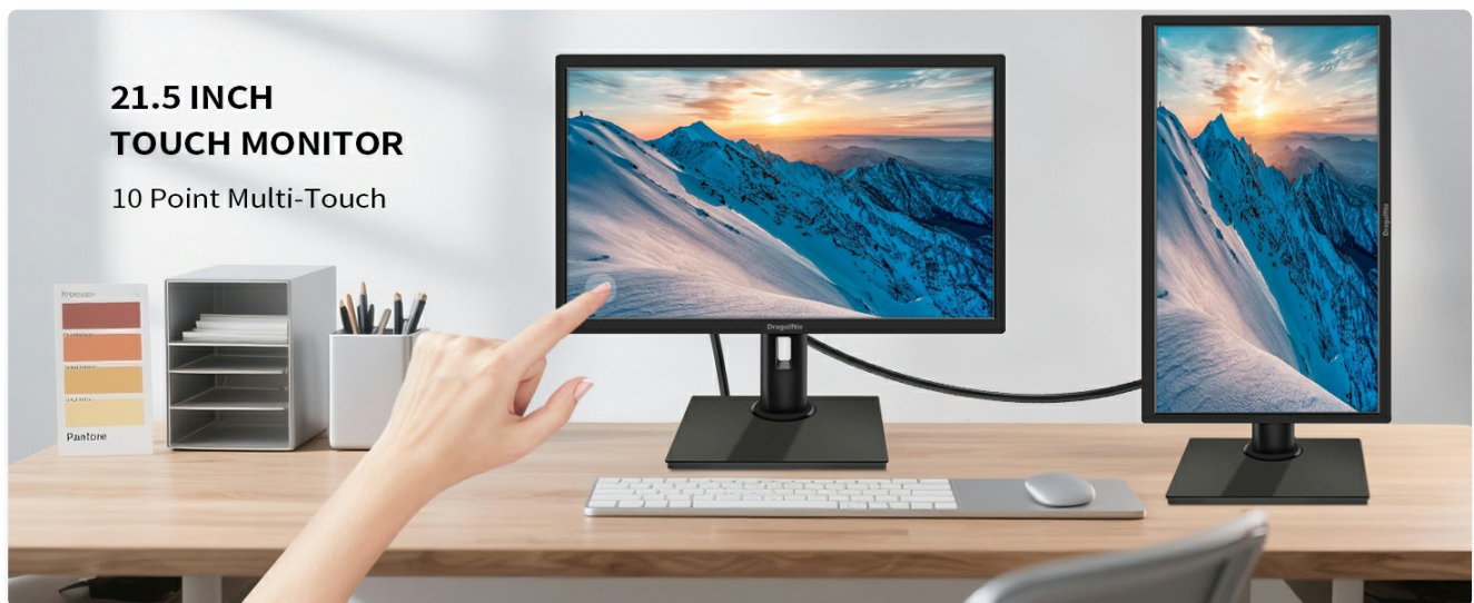
Image 1.1: Overview of the Dragolftie 21.5 Inch FHD Touch Screen Monitor highlighting its main features.

This manual provides detailed instructions for the setup, operation, and maintenance of your Dragolftie FHD-215T 21.5-inch Touchscreen Monitor. Please read this manual thoroughly before using the product to ensure proper functionality and to prevent damage.