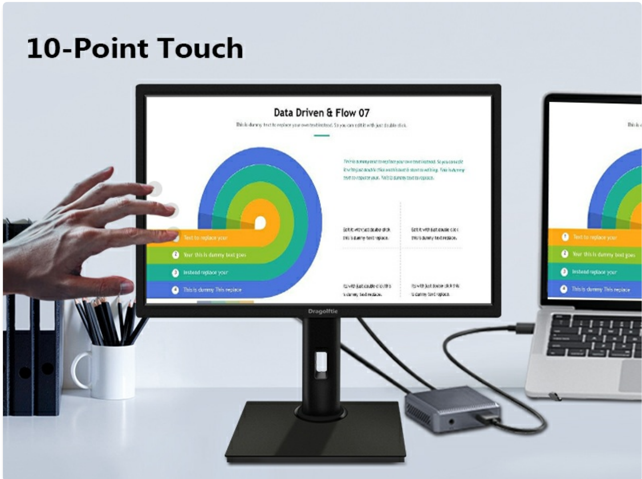
Image 4.1: Demonstration of 10-point capacitive touch on the monitor.