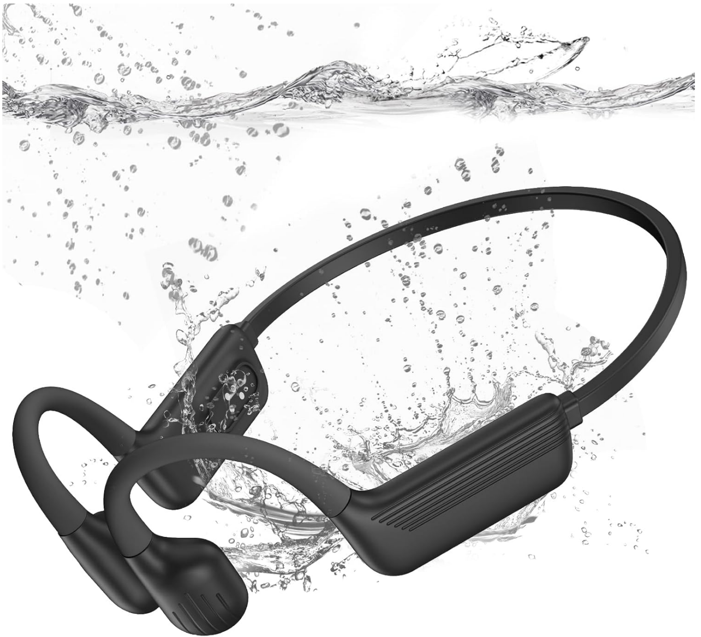
Image: MARLALL S800 Bone Conduction Headphones. These headphones feature a flexible band that wraps around the back of the head, with transducers resting near the ears.