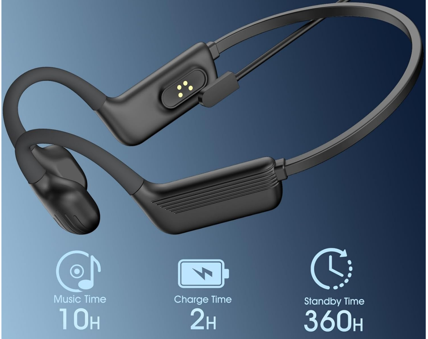
Image: The MARLALL S800 headphones connected to a magnetic charging cable, illustrating the charging process.