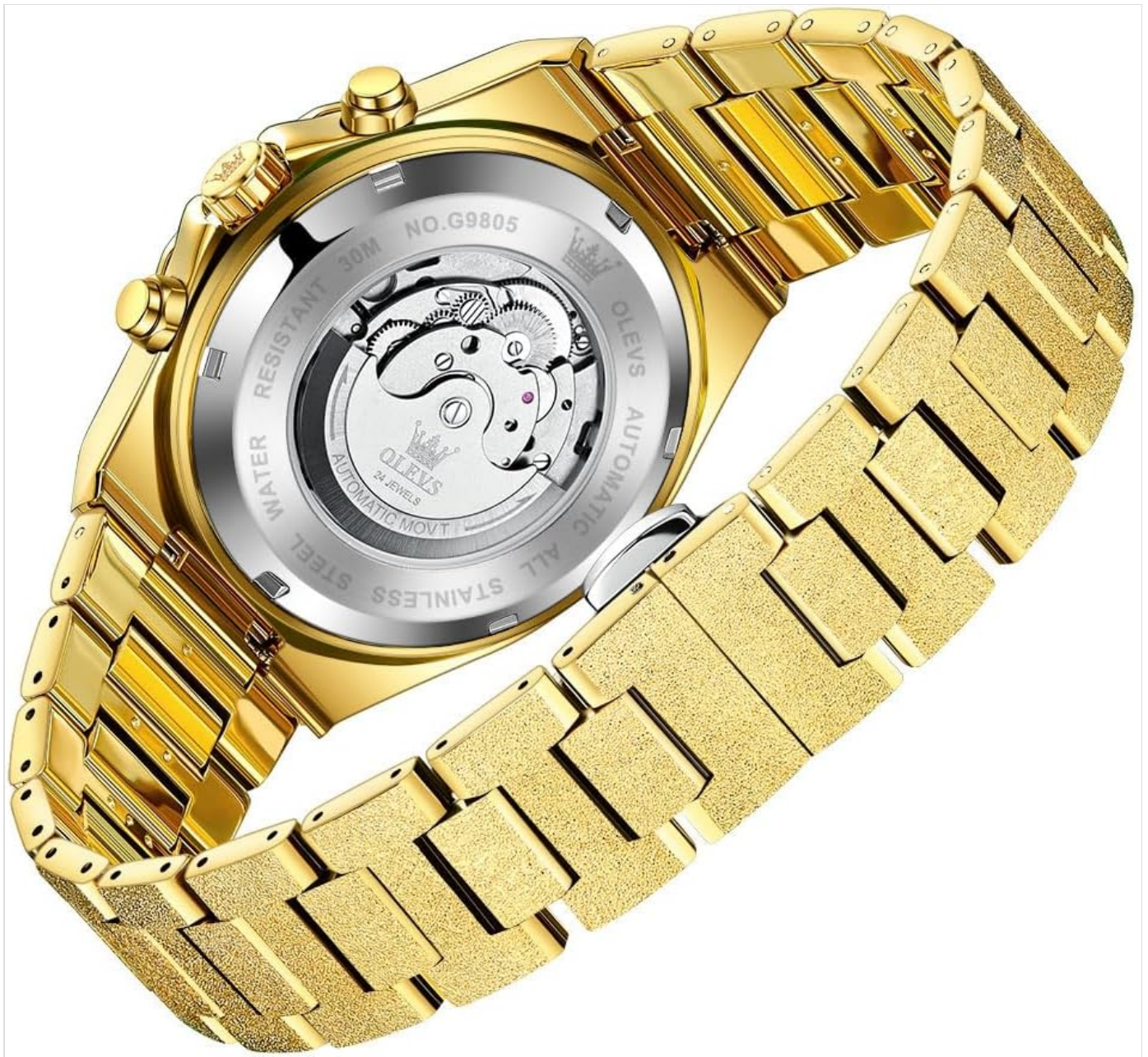
Figure 2: Rear view of the watch, displaying the transparent case back that reveals the intricate mechanical movement.