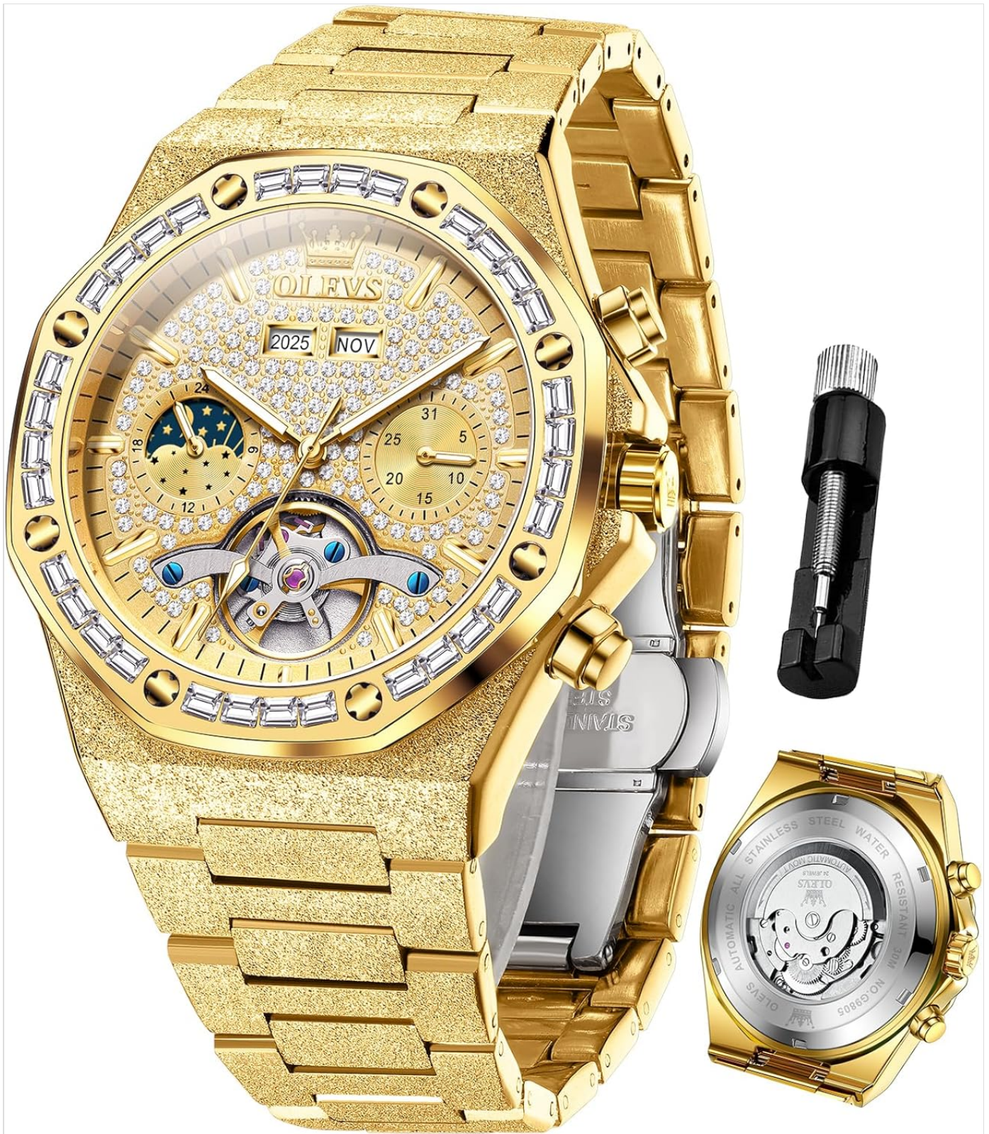
Figure 1: Front view of the OLEVS Automatic Men's Watch, showcasing its gold finish, octagonal starry dial, diamond hour markers, and visible tourbillon.