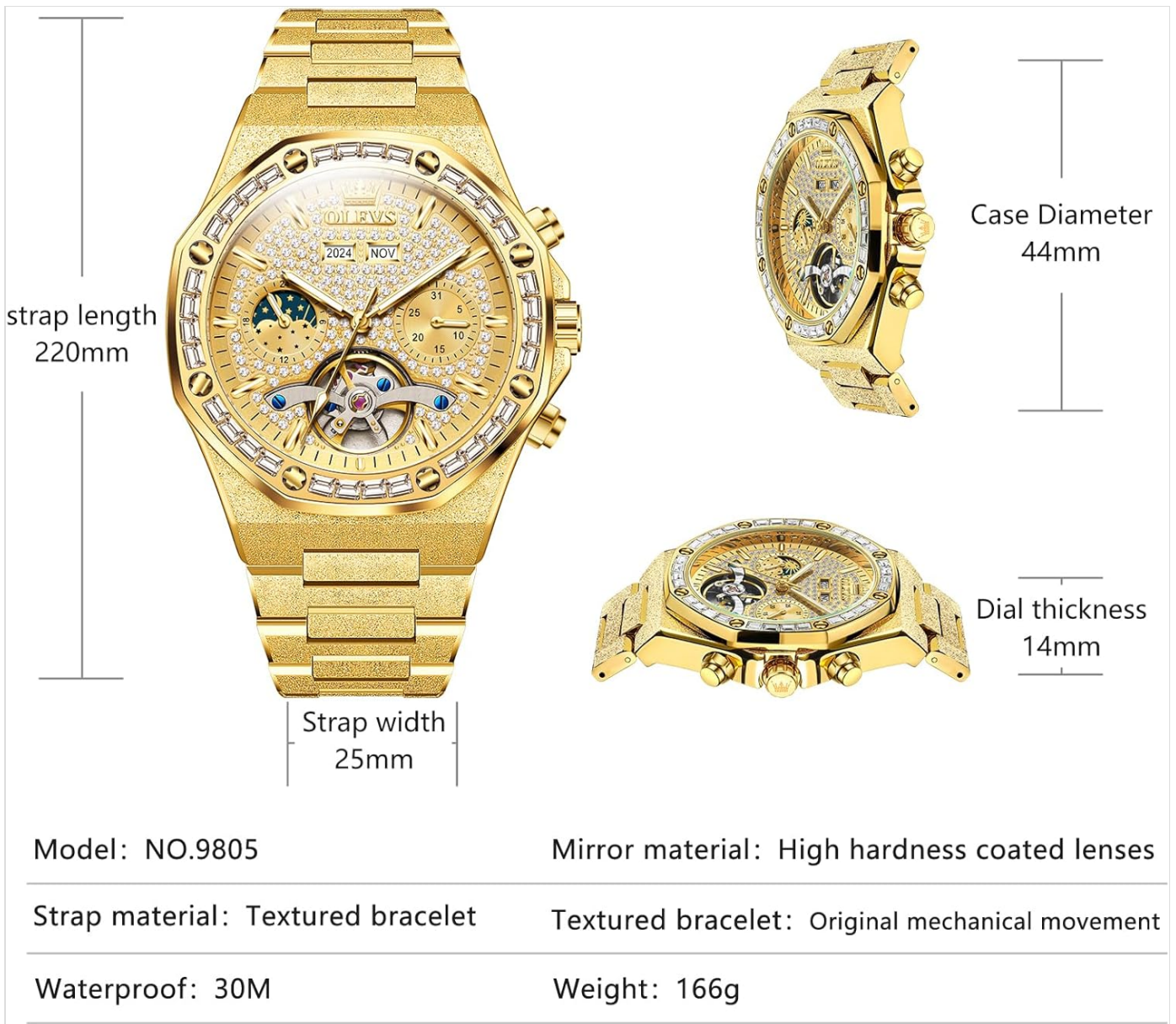
Figure 5: Detailed dimensions and material specifications of the OLEVS Automatic Men's Watch.