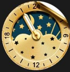
Moon phase dial