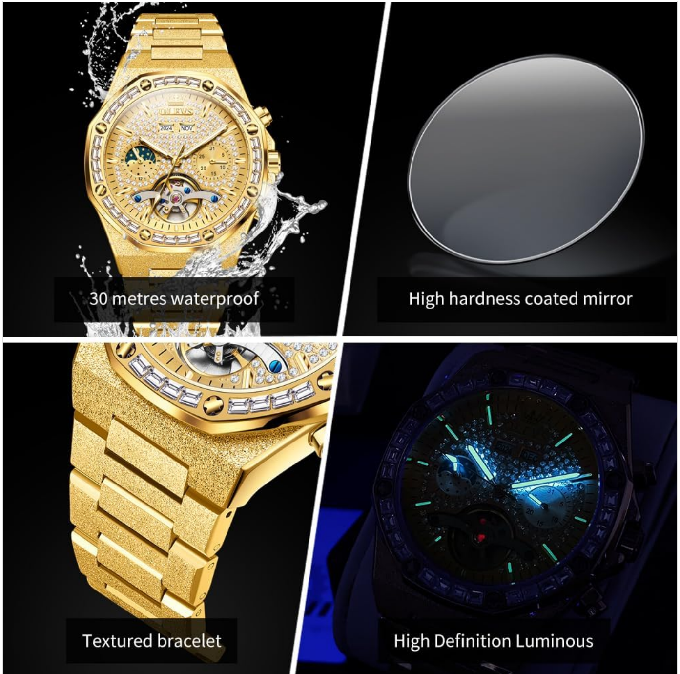
Figure 4: Key features of the watch, including water resistance, crystal type, bracelet texture, and luminous display.