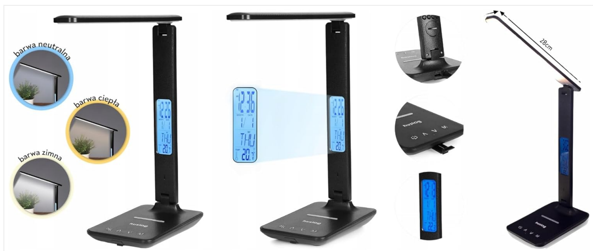
Figure 3: The lamp demonstrating its three light color modes (warm, neutral, cold) and the clear LCD display showing time, date, and temperature.