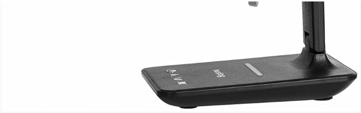
Figure 4: Illustration of the lamp's adjustable arm, capable of a 180-degree rotation to direct light as needed.