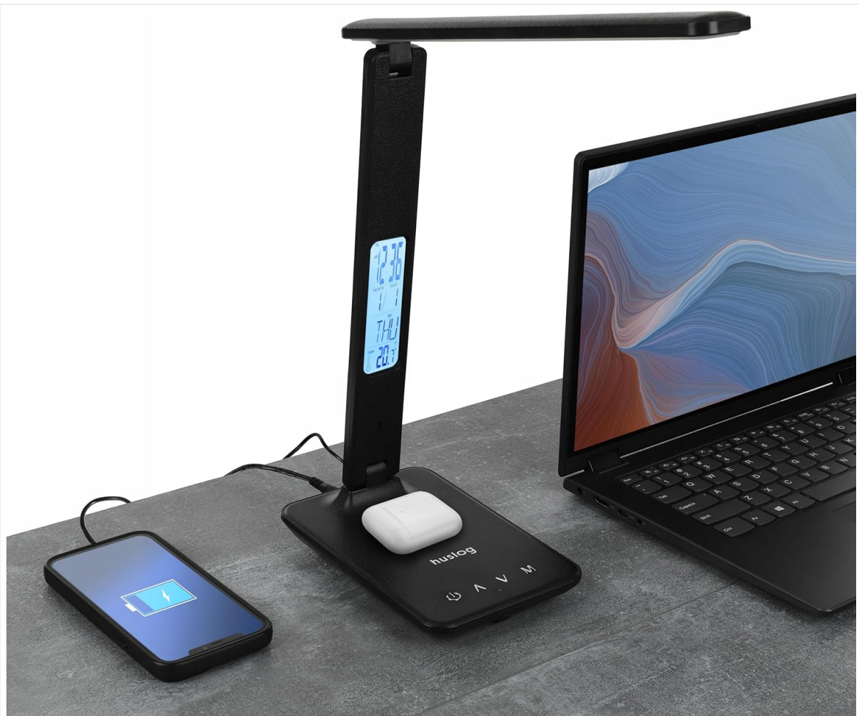
Figure 6: The desk lamp in a typical setup, simultaneously charging a smartphone wirelessly on its base and another device via its USB port, next to a laptop.