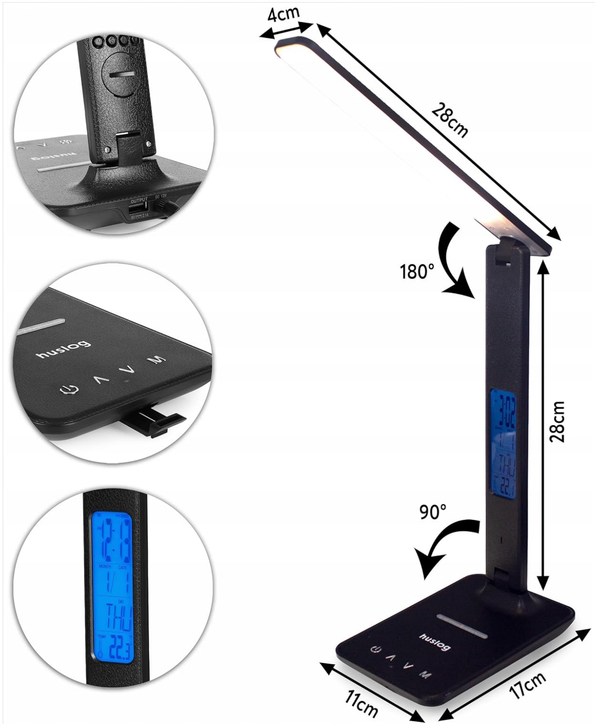
Figure 1: Overview of the huslog Desk Lamp with key dimensions and features. The image highlights the adjustable arm, lamp head, base, and LCD display, along with measurements of 28cm height, 28cm lamp head length, 11cm base width, and 17cm base depth.