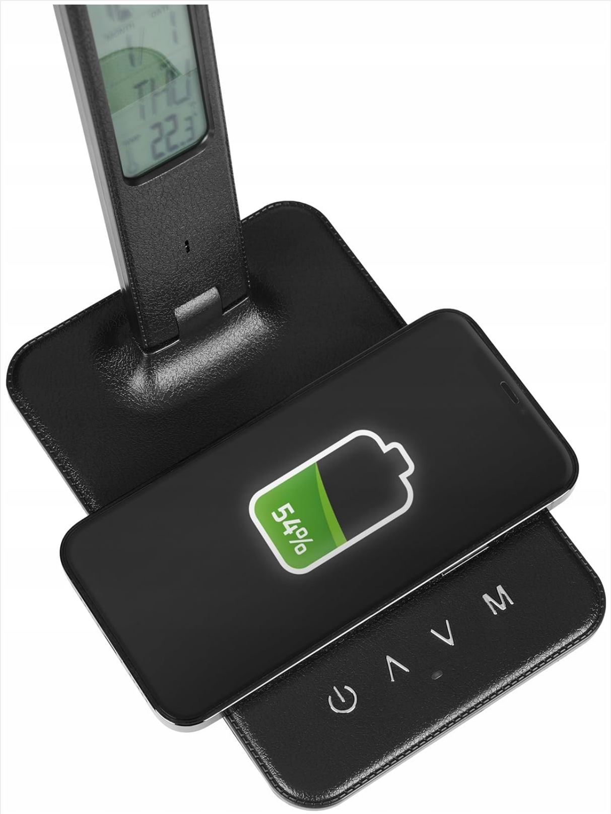
Figure 5: A smartphone placed on the lamp's base, indicating active wireless charging with a battery icon.