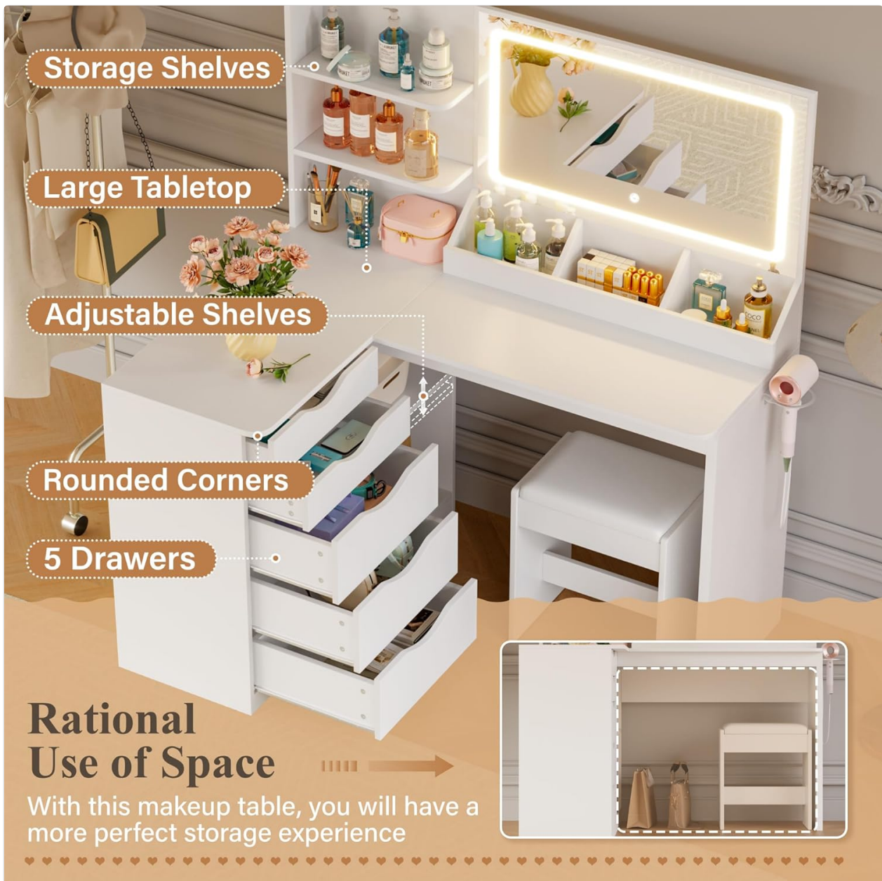
Figure 3.2: Overview of the vanity's storage features, including storage shelves, a large tabletop, adjustable shelves, rounded corners, and five drawers for organized storage.