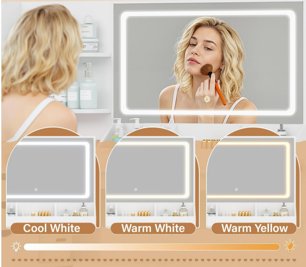
Figure 4.1: Illustration of the three adjustable lighting modes: Cool White, Warm White, and Warm Yellow, demonstrating the versatility of the LED mirror.