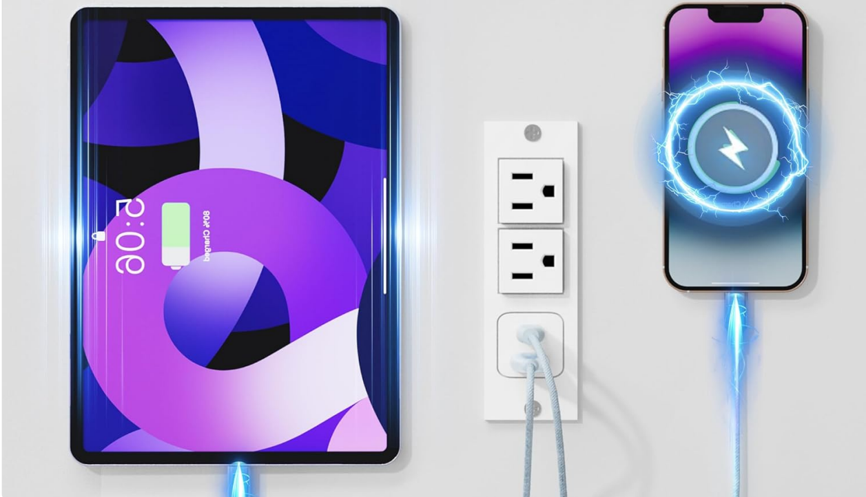
Figure 4.2: Close-up view of the integrated fast-charging module, showing the Type-C (20W) and USB (18W) ports, along with standard power outlets.