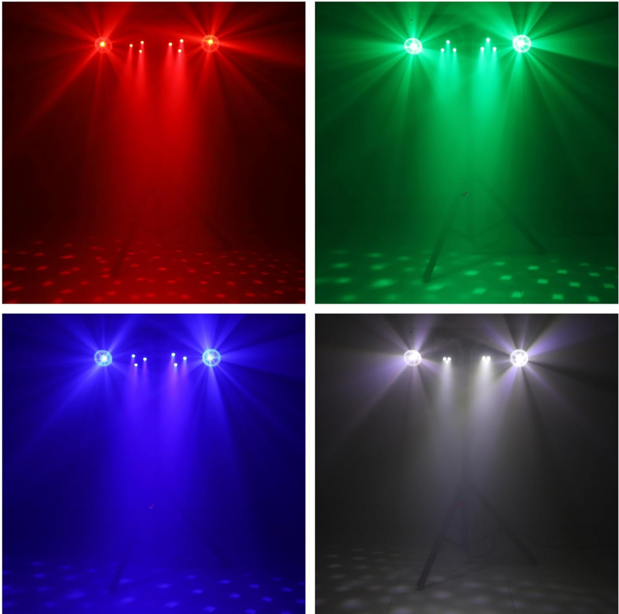
Image 6.3: Examples of the Telbum PL-31BW's lighting output, demonstrating red, green, blue, and white light effects.