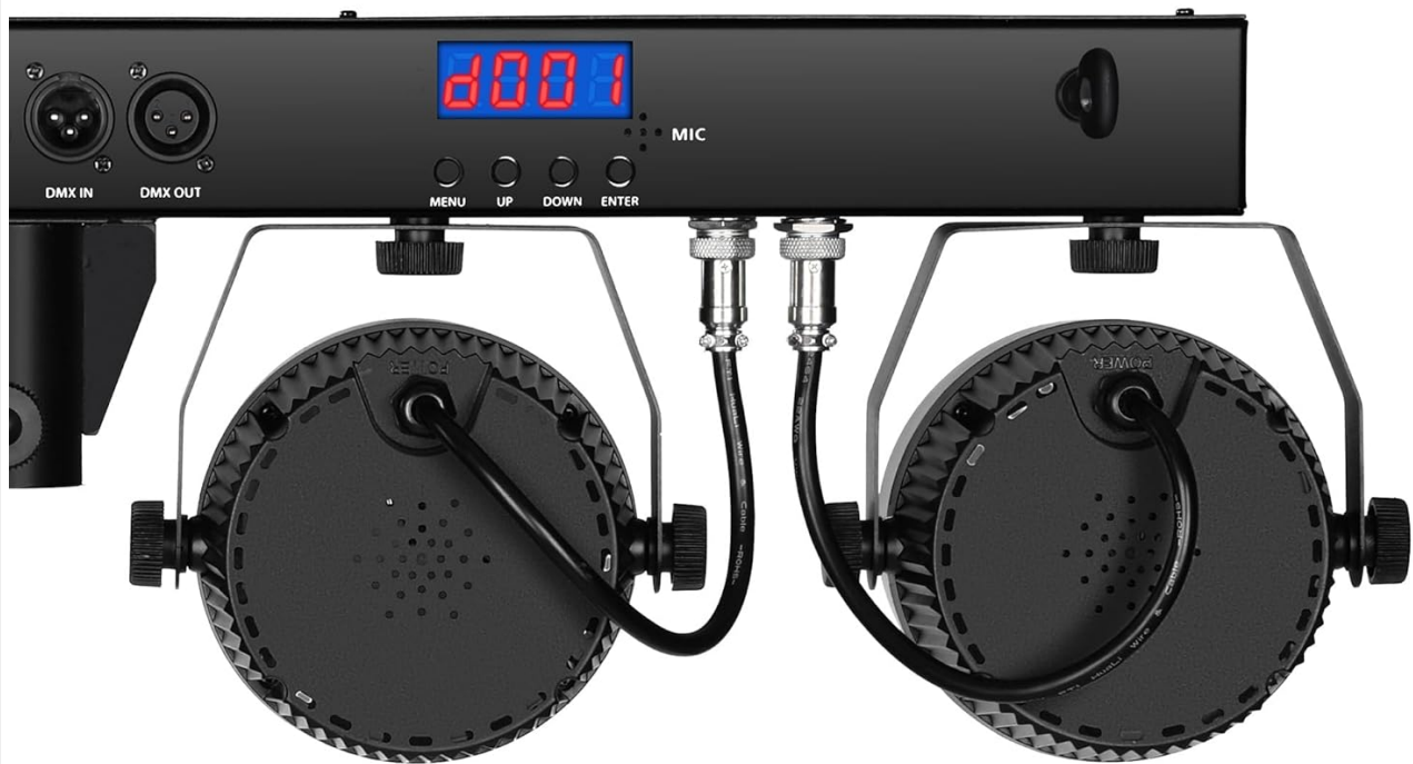
Image 6.1: User-friendly control panel featuring DMX IN/OUT ports, a digital display, MENU, UP, DOWN, and ENTER buttons, and a built-in microphone.

With DMX & standalone mode 03/06/15 Channel selectable