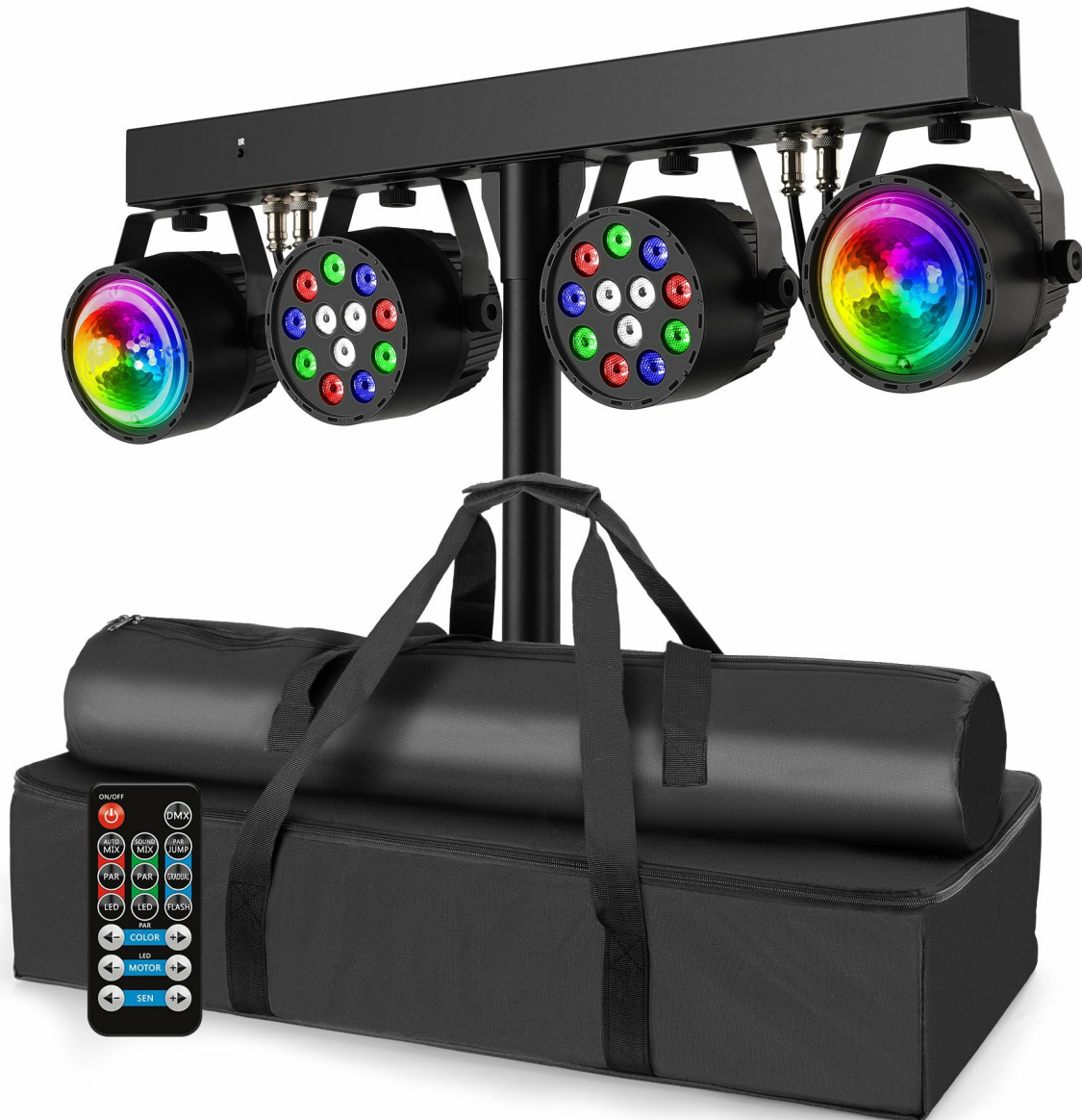
Image 1.1: Telbum PL-31BW 4-in-1 LED DJ Lighting System in operation, showcasing its mobile DJ party light capabilities with IR Remote, Sound Activated, DMX512, Master-Slave, and Control Panel features.