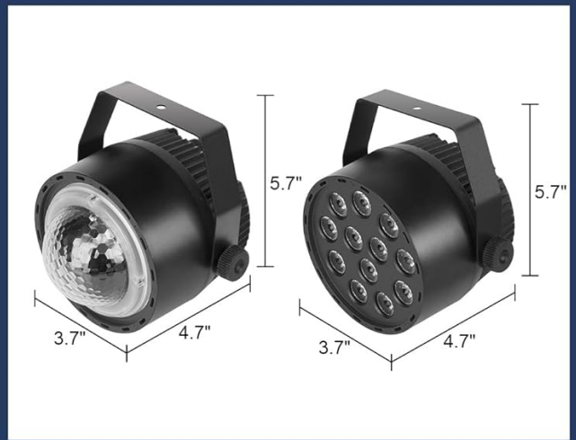
Image 4.1: Product parameters including net weight (1.8kg/4lb), load bearing (4.5kg/10lb), max height (220cm/87"), extension pole height (70cm/27.6"), and storage height (81cm/31.5"). Also shows dimensions of the light bar (29.1" x 11.2" x 5.9") and individual lights (4.7" x 5.7" x 3.7").