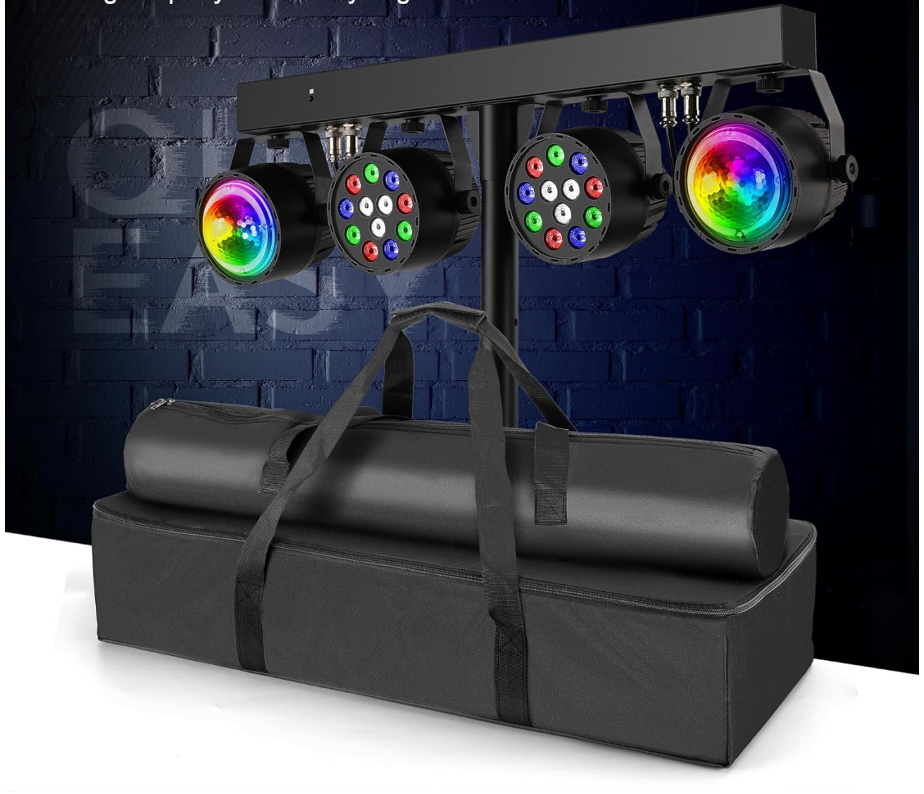
Image 5.1: The Telbum PL-31BW lighting system fully assembled on its stand, demonstrating quick setup and easy transport with included carry bags.