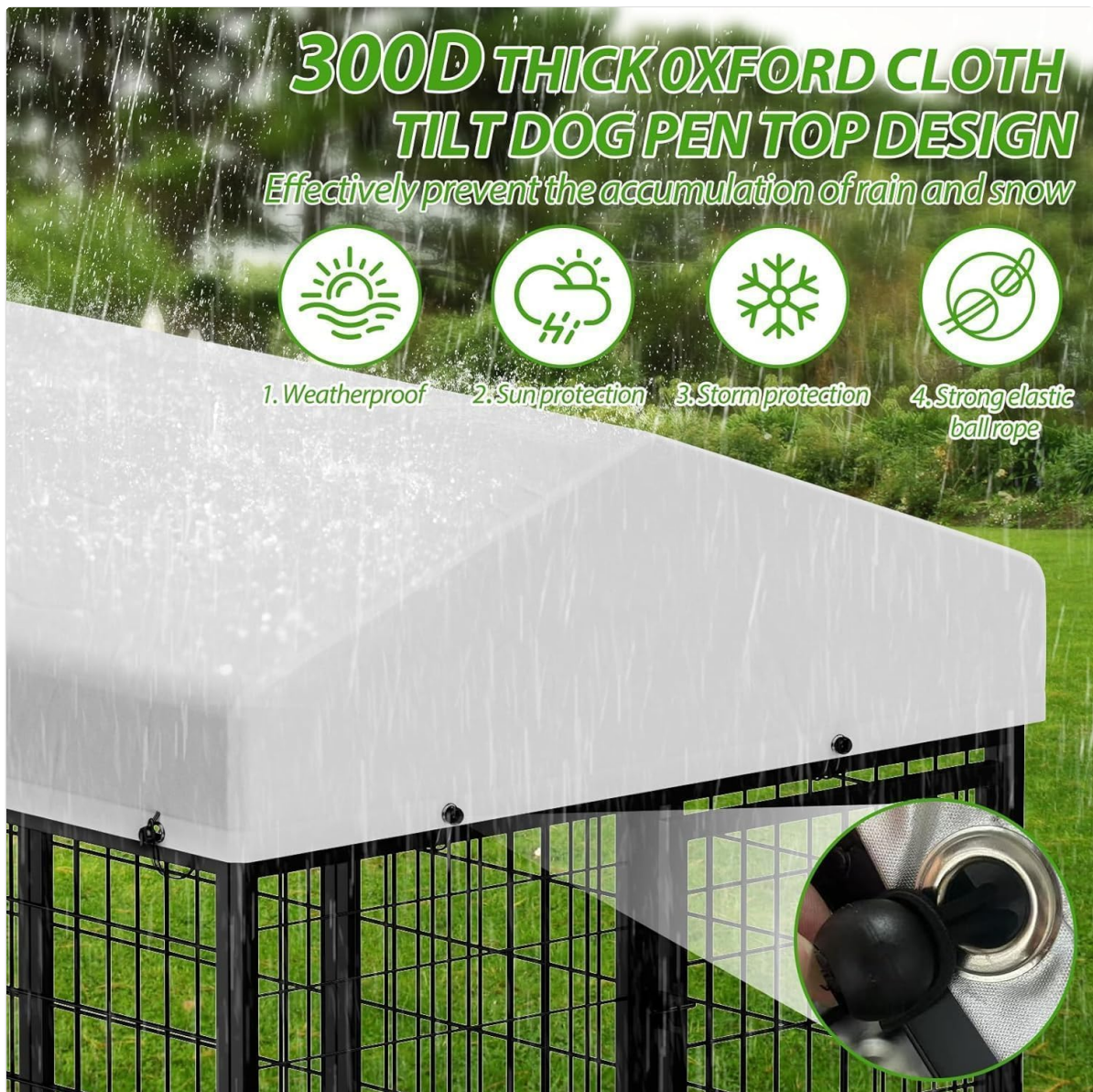
Figure 3: The 300D thick Oxford cloth roof cover provides weather protection.