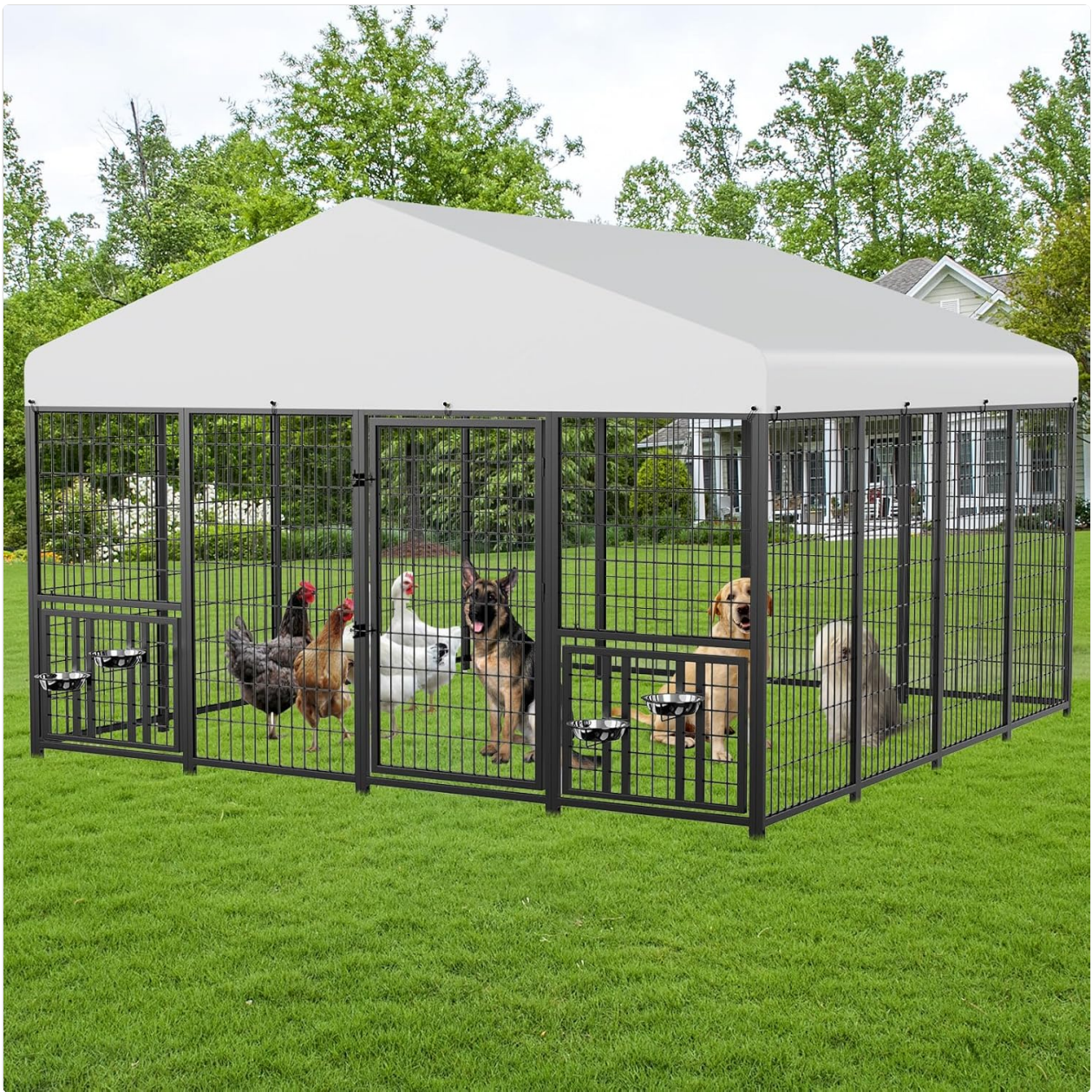
Figure 1: Fully assembled ROOMTEC Large Outdoor Dog Kennel.