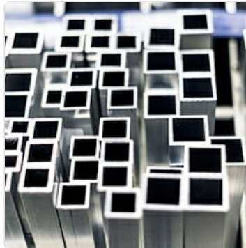
Figure 2: Detail of the high-carbon steel frame and thick metal mesh construction.