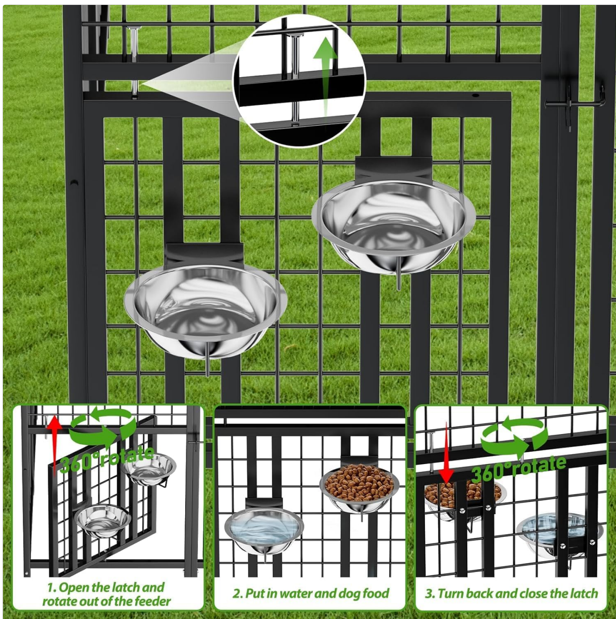
Figure 4: Instructions for using the adjustable rotating feeding bowls.