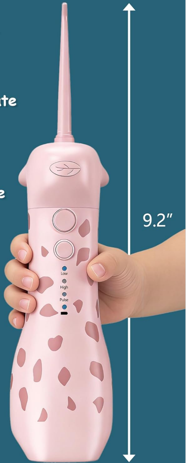
Image: The HUACOCARE Kids Water Flosser with its various tips, illustrating the different options for cleaning.