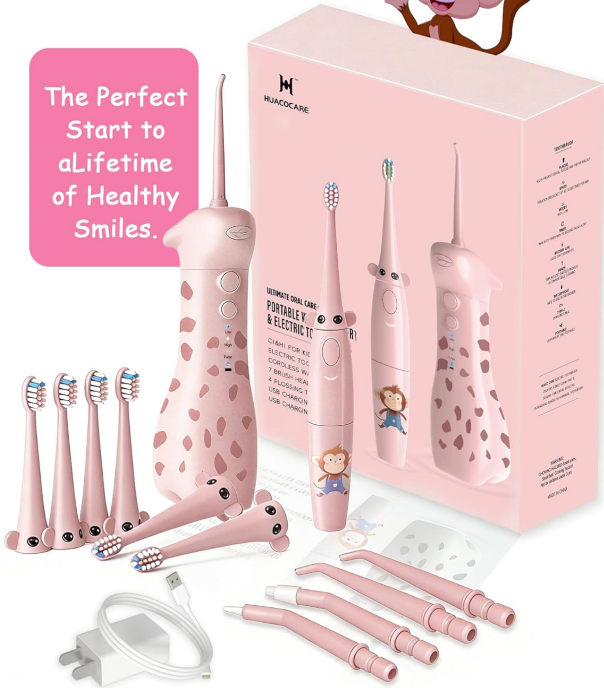
Image: A comprehensive view of all items included in the HUACOCARE Kids Oral Care Combo, including the main devices, multiple brush heads, flosser tips, and charging accessories.

The Perfect Start to a Lifetime of Healthy Smiles.