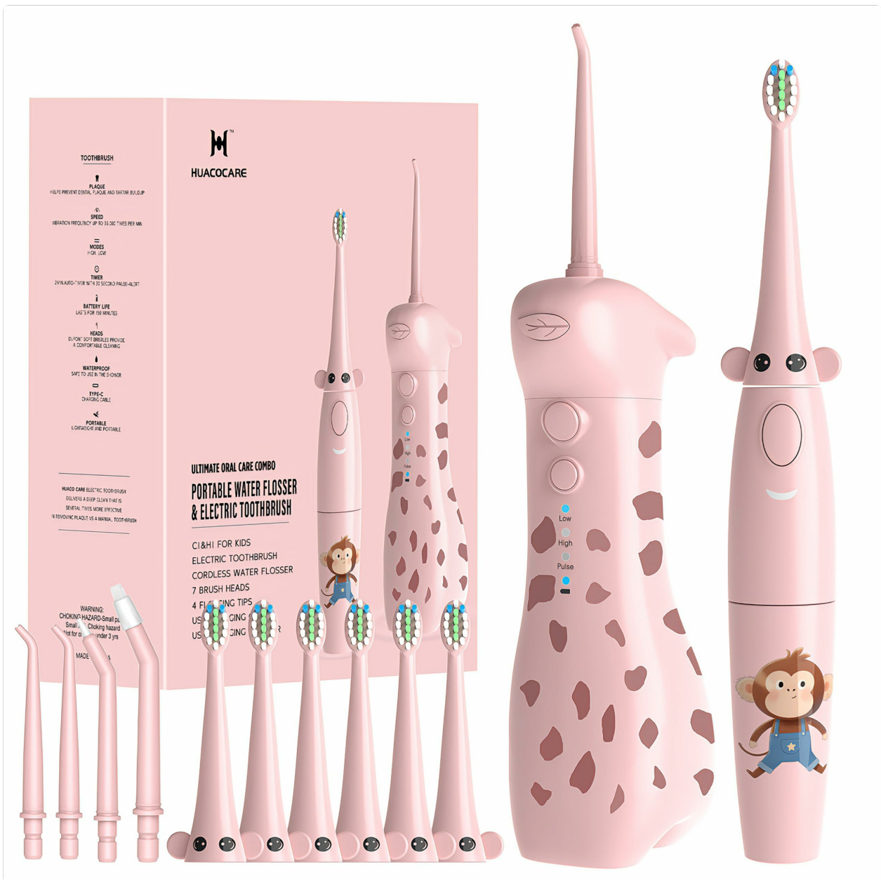
Image: The HUACOCARE Kids Water Flosser and Electric Toothbrush Combo, showcasing both devices with their distinct animal designs, ready for use.