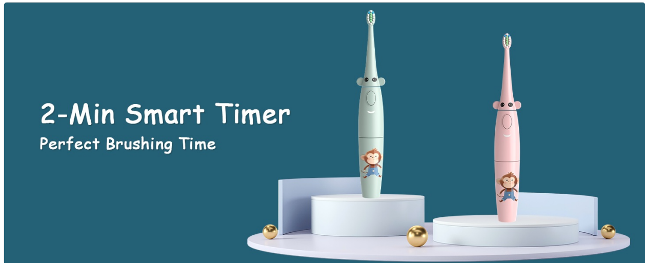
Image: The HUACOCARE Kids Electric Toothbrush emphasizing its 2-minute smart timer feature for optimal brushing duration.