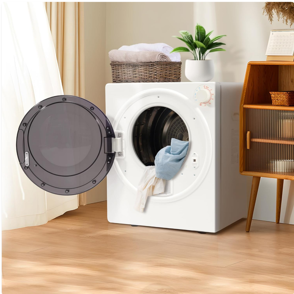
Image: Front view of the Elevon Portable Clothes Dryer, white with a dark transparent door, showing laundry inside. A basket of folded towels and a potted plant are on top of the dryer.