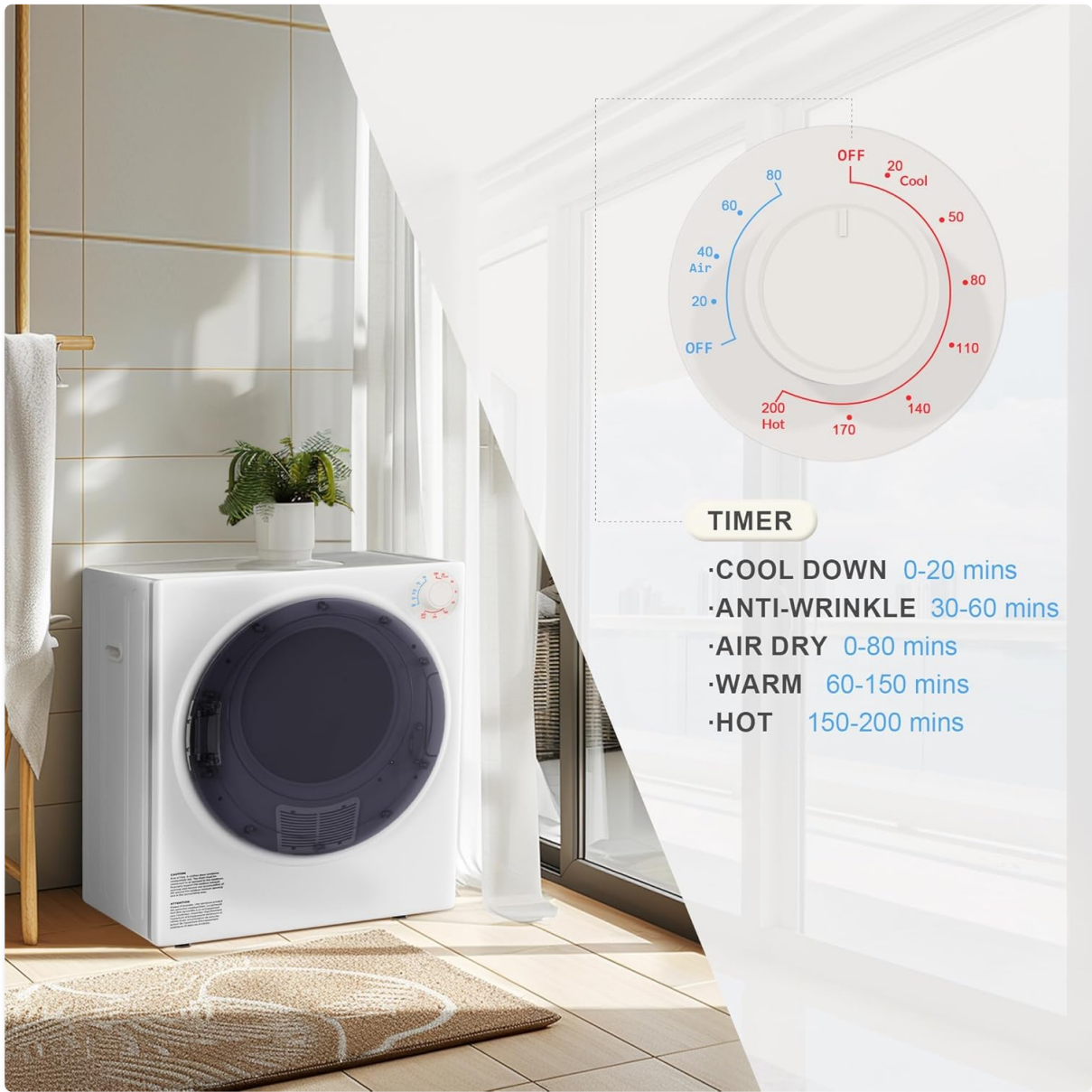
Image: A detailed view of the dryer's timer dial and the various drying mode options, including Cool Down, Anti-Wrinkle, Air Dry, Warm, and Hot, with their respective time ranges.