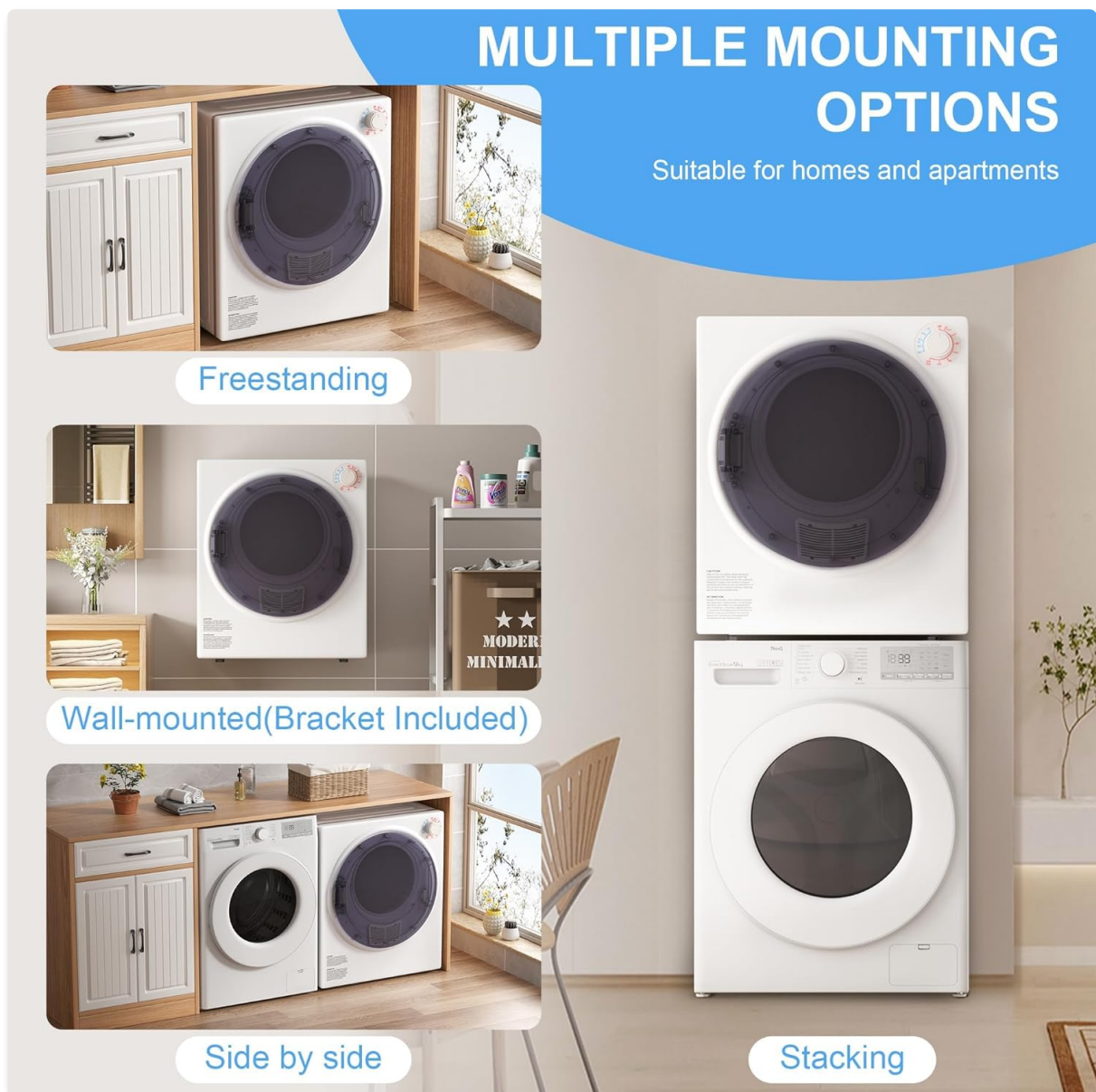
Image: Visual representation of the dryer's versatile installation options, including freestanding on a counter, wall-

Carefully unpack the dryer and remove all packaging materials. The compact size (19.29" x 18.11" x 23.43") allows for flexible placement. It can be used as a stand-alone unit, wall-mounted (bracket included), or stacked.