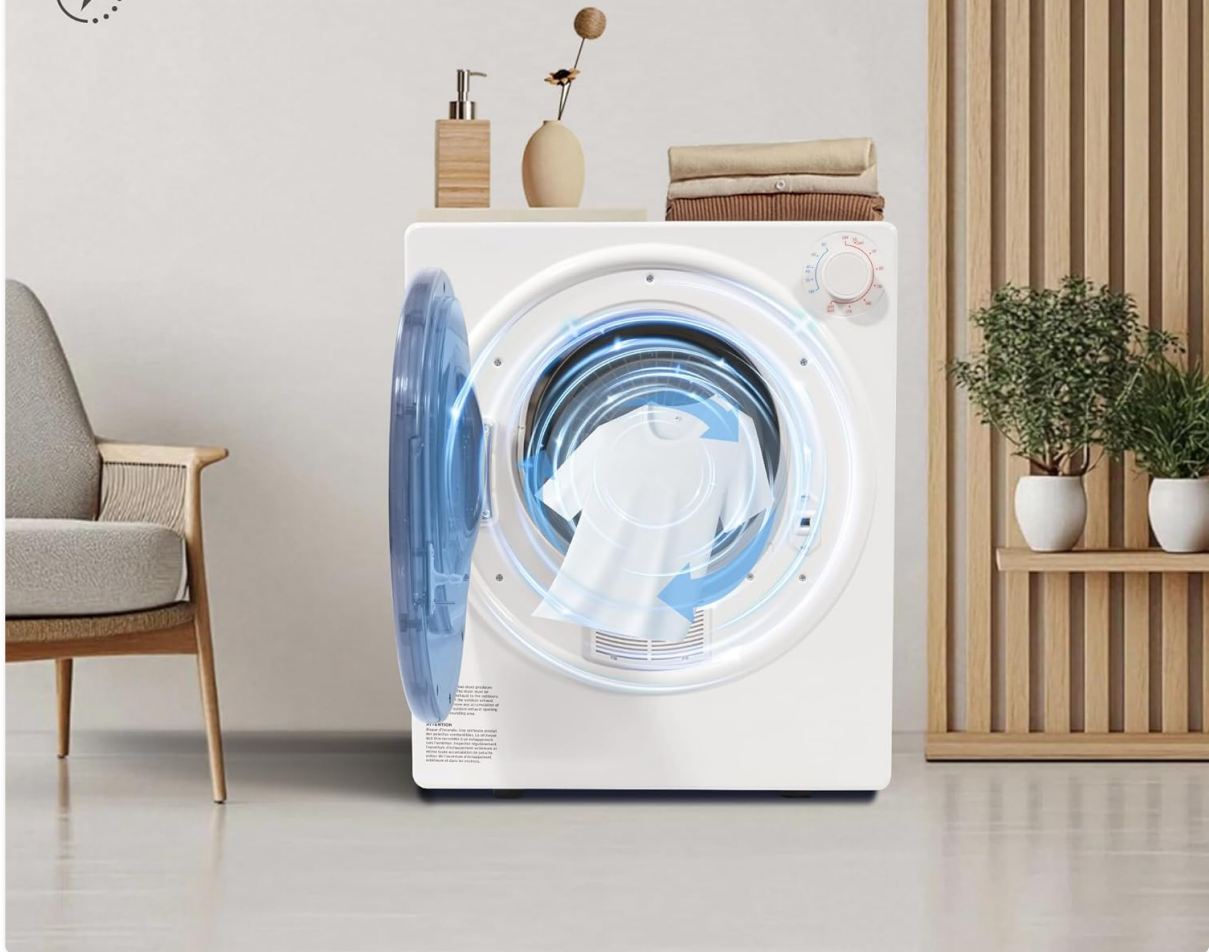
Image: The dryer in operation, with clothes visible through the transparent door, illustrating the powerful and fast drying capabilities.