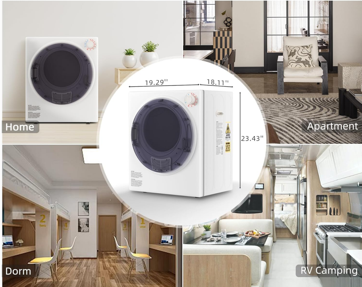
Image: A graphic illustrating the compact dimensions of the dryer (19.29" x 18.11" x 23.43") and showing it fitting into different small environments such as a home, apartment, dorm room, and RV.