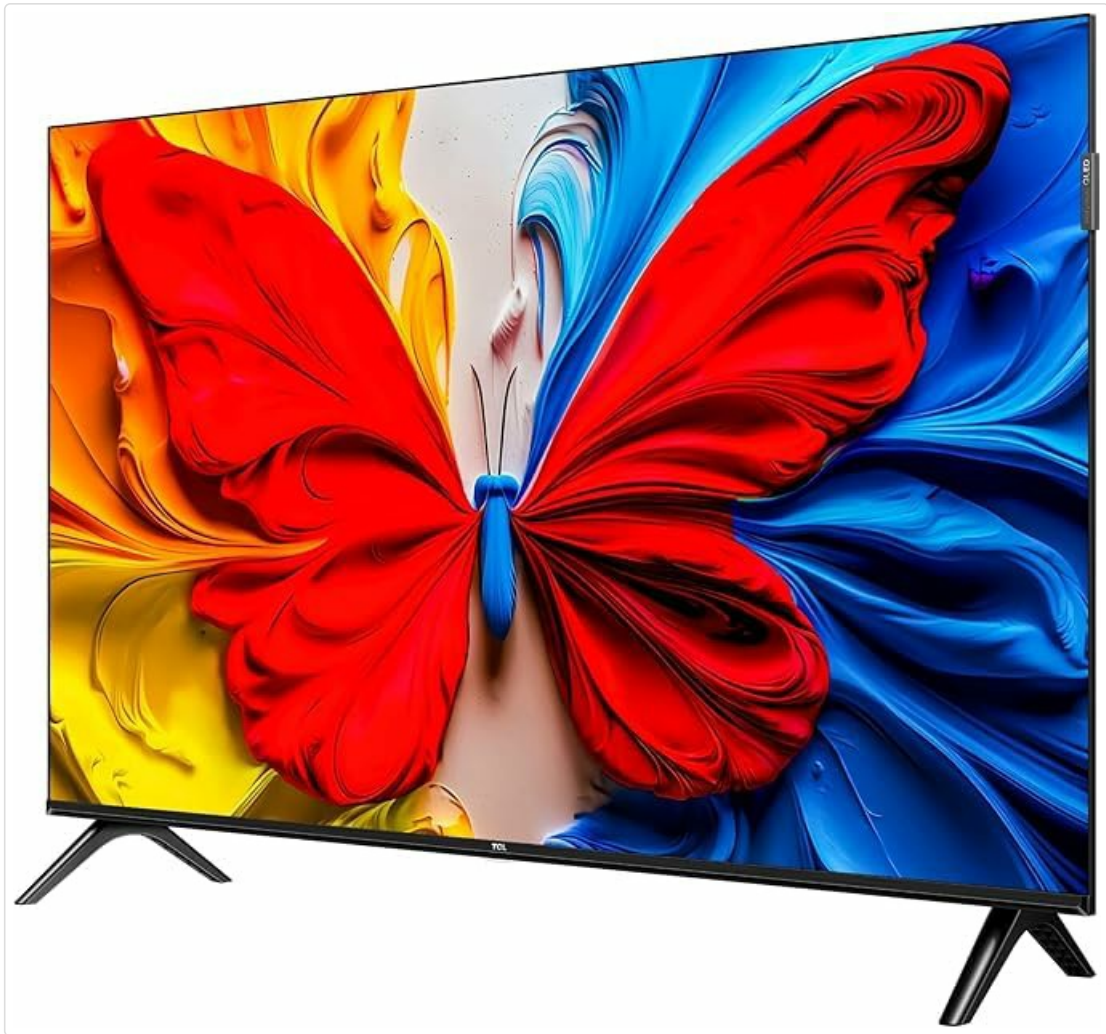
Image: Side view of the TCL 32S5K TV, highlighting the various input and output ports for external device connections.