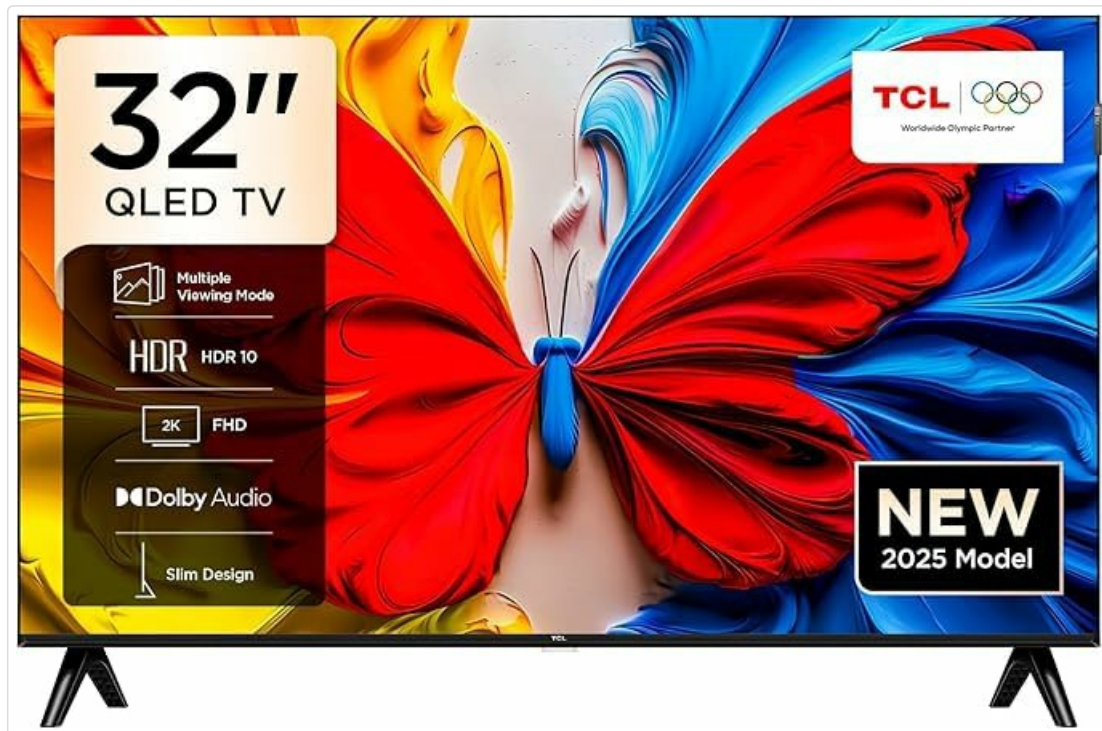
Image: Front view of the TCL 32S5K Series TV, illustrating the overall design and screen.