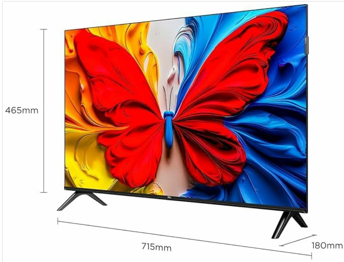
Image: Diagram illustrating the physical dimensions of the TCL 32S5K TV (715mm width, 465mm height, 180mm depth with stand).