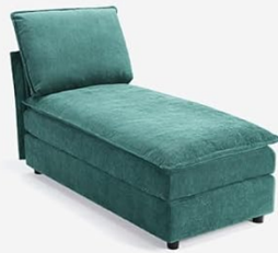
Chaise Longue * 2