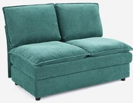
Armless Chair * 1

* 48-72 Hours Fully Expand, 30 mins Assembly Shipped in 4 packages, may arrive separately