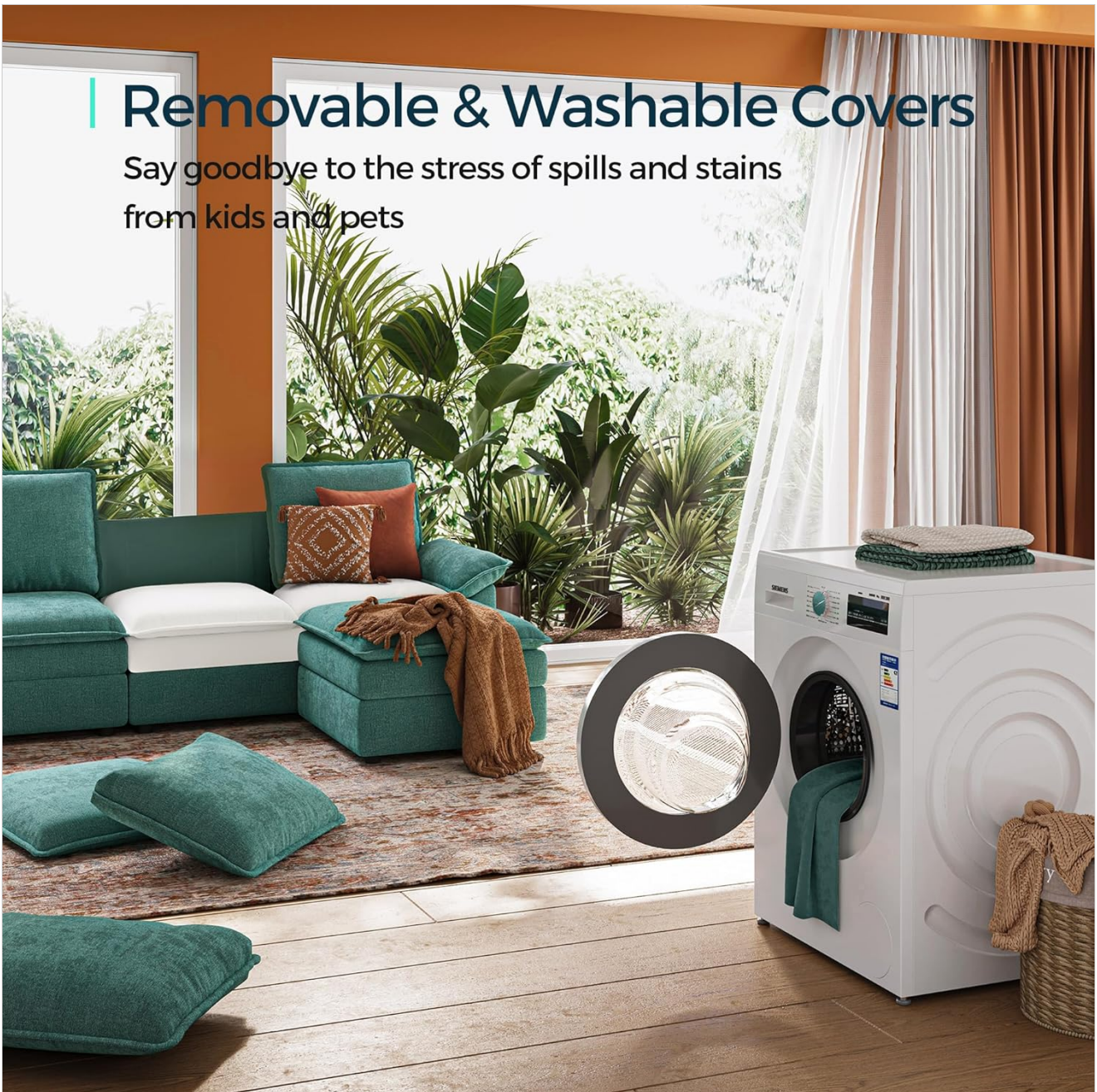
Figure 4.1: Removable and washable covers for easy maintenance.

Say goodbye to the stress of spills and stains from kids and pets