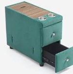
Console Table * 1