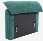
Armrest * 2