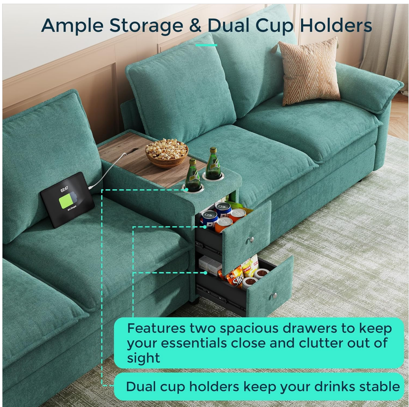
Figure 3.1: Console with charging capabilities.