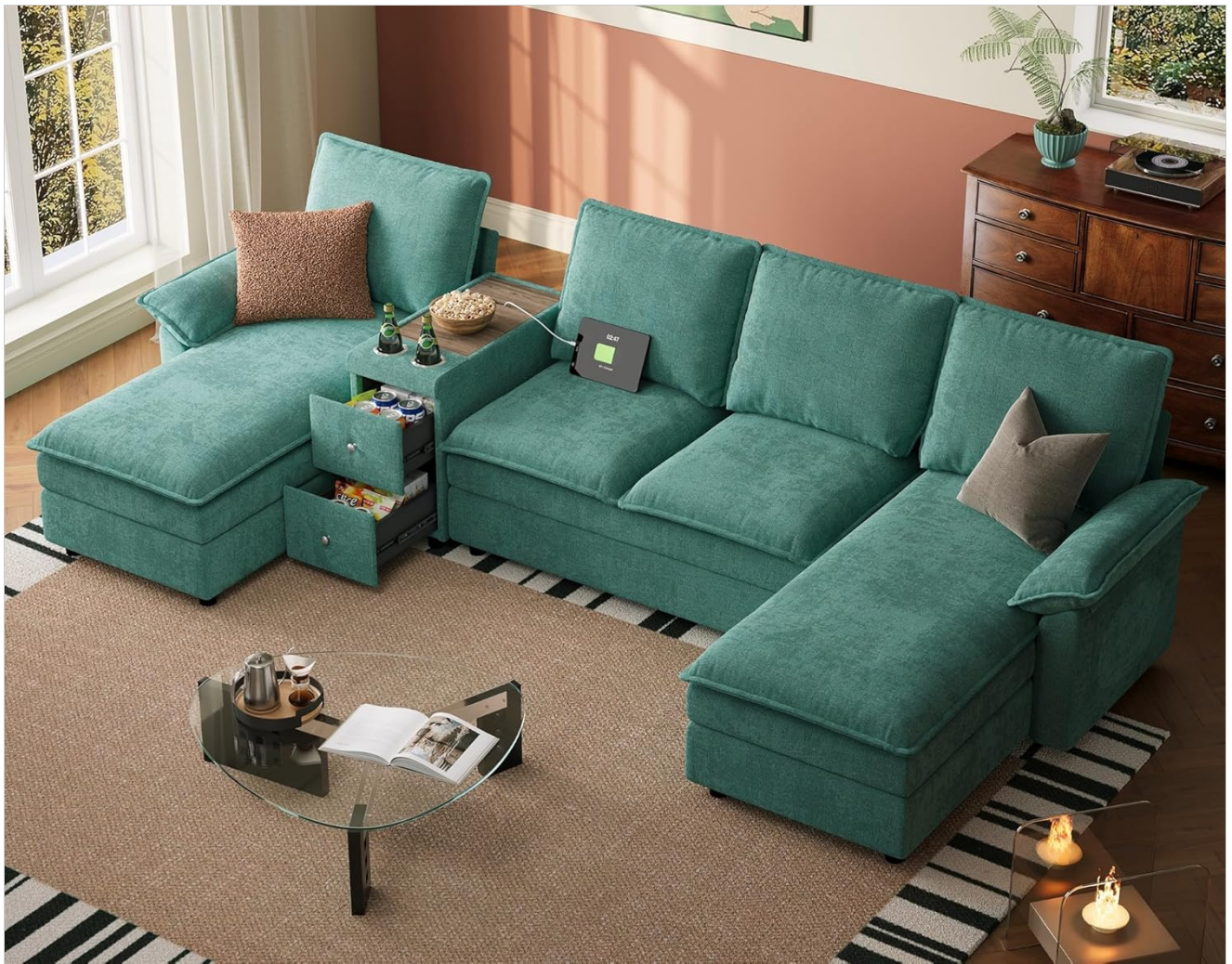
Figure 1.1: Overall view of the LINSY HOME Modular Sectional Sofa with console.