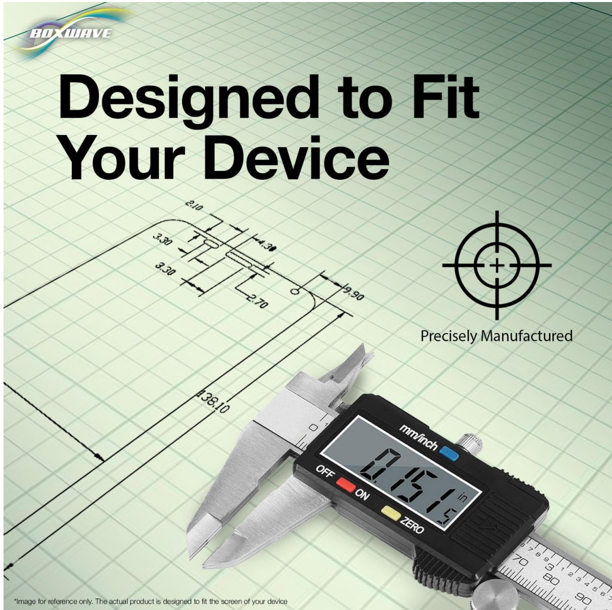
Image: Calipers measuring a technical drawing, illustrating the precise manufacturing for a perfect fit.