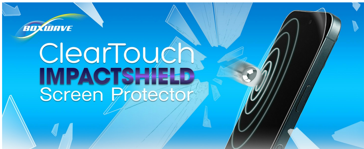
Image: Packaging of the BoxWave ClearTouch ImpactShield Screen Protector.

The BoxWave ClearTouch ImpactShield is a protective film designed to safeguard the screen of your SSA Wi-Fi Digital Picture Frame ZN-DP1013 (13.5 in). This screen protector offers enhanced durability and maintains screen clarity. This manual provides instructions for proper installation, usage, and care.