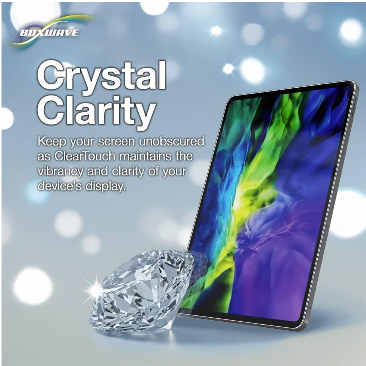
Image: A diamond placed next to a tablet screen, representing the crystal clarity of the screen protector.