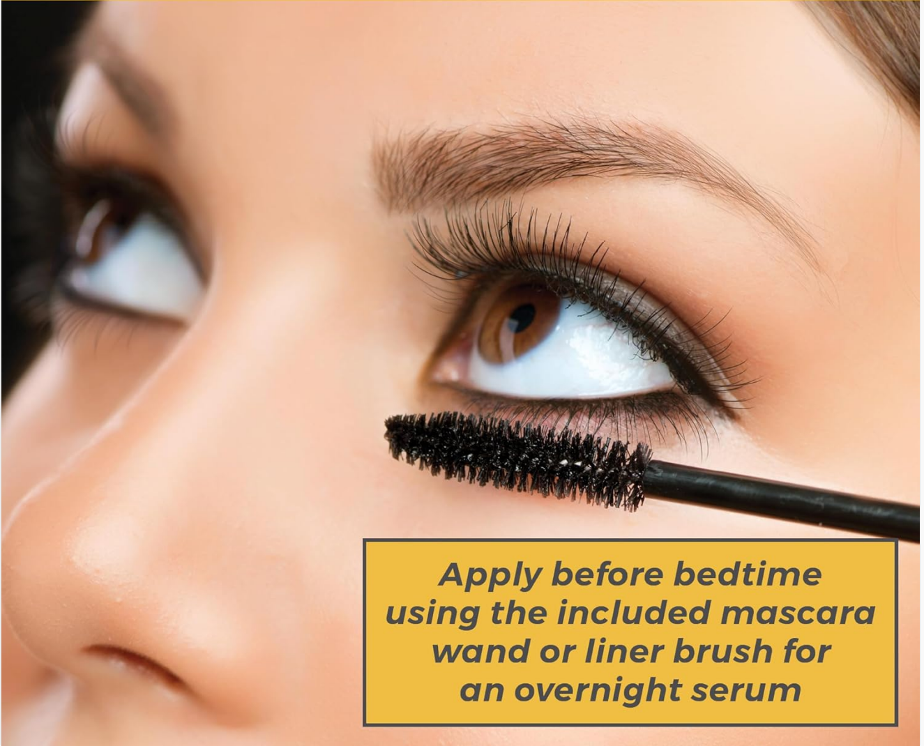
Image: A close-up of a woman applying castor oil to her eyelashes using a mascara wand, demonstrating its use as an eyelash serum.