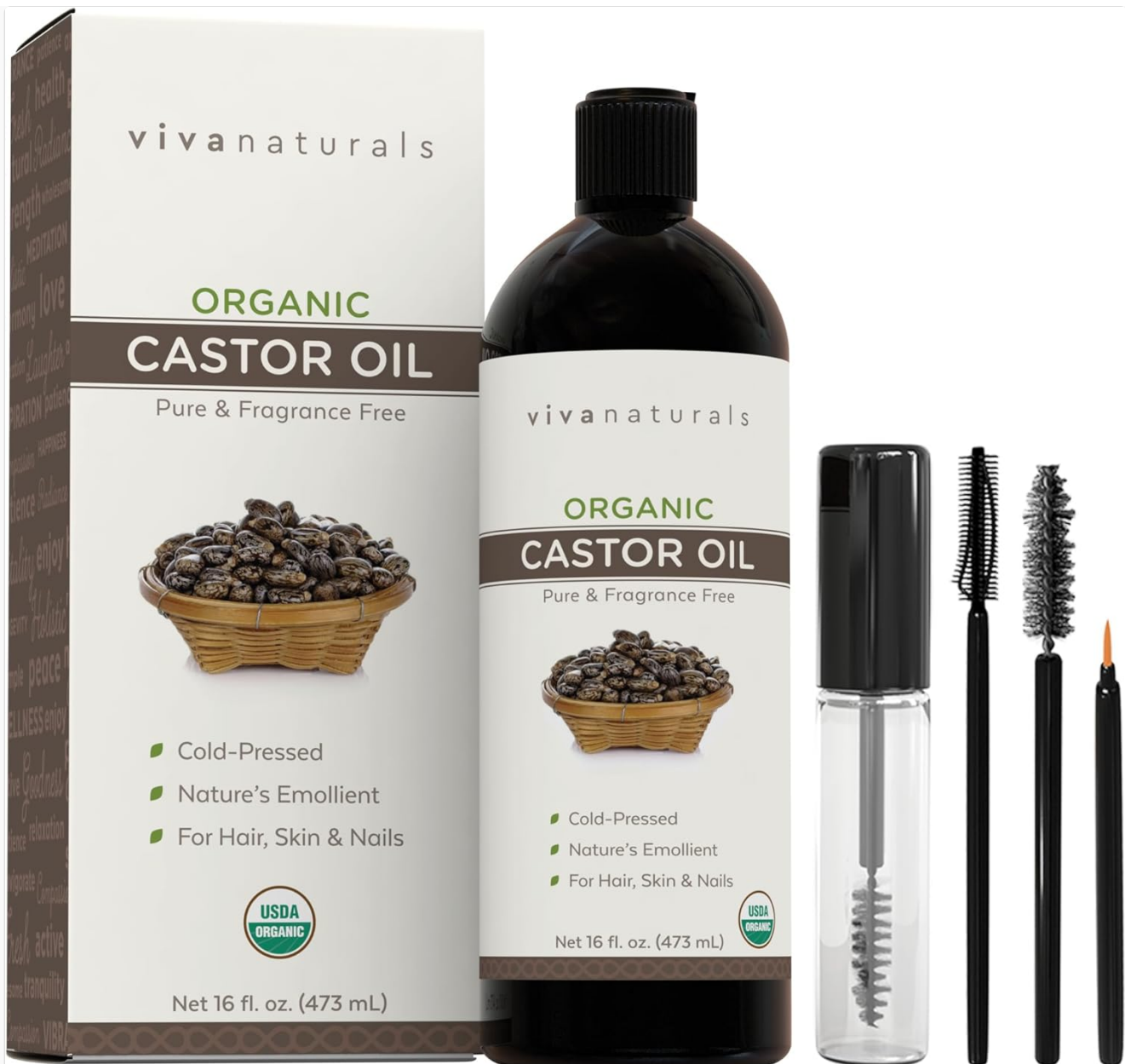
Image: The Viva Naturals Organic Castor Oil product packaging, including the bottle, box, and accompanying beauty kit with mascara wands and brushes.