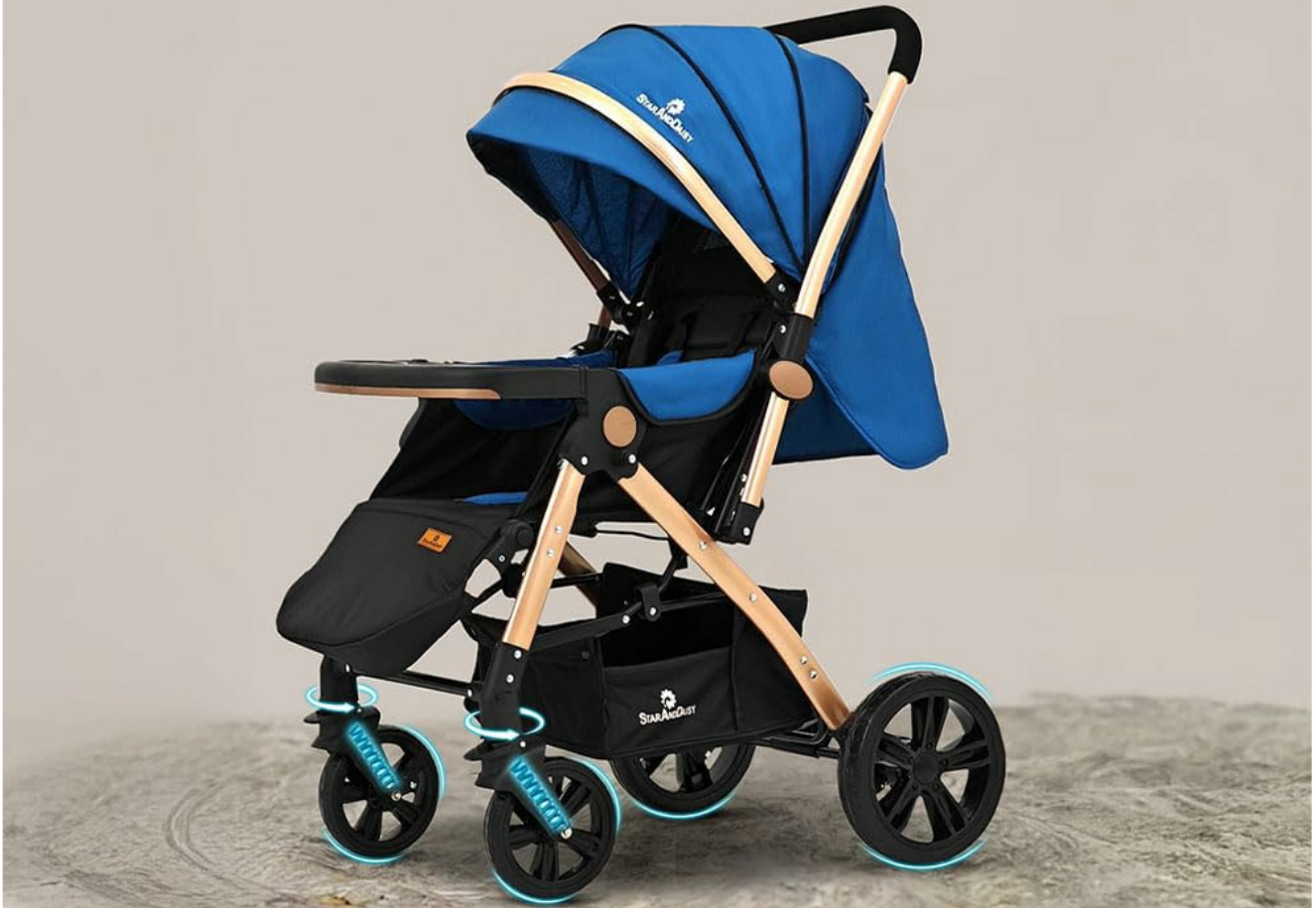
Figure 4.2: The stroller's 4-wheel shock absorption system and 360° swivel wheels for smooth movement.

Strong shock absorption with smooth 360° rotation for effortless rides.