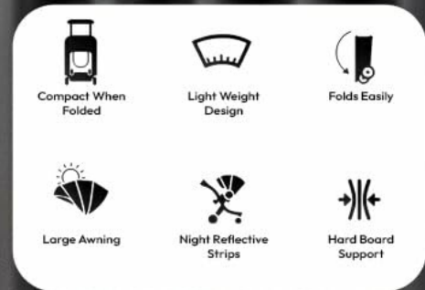
Figure 2.1: Overview of the Luna Luxe Baby Stroller's main features.