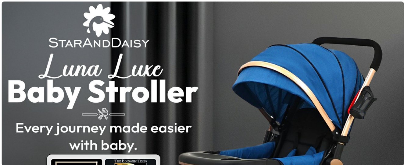
Figure 4.3: Detailed view of the stroller's features, including the detachable food tray and safety belt.