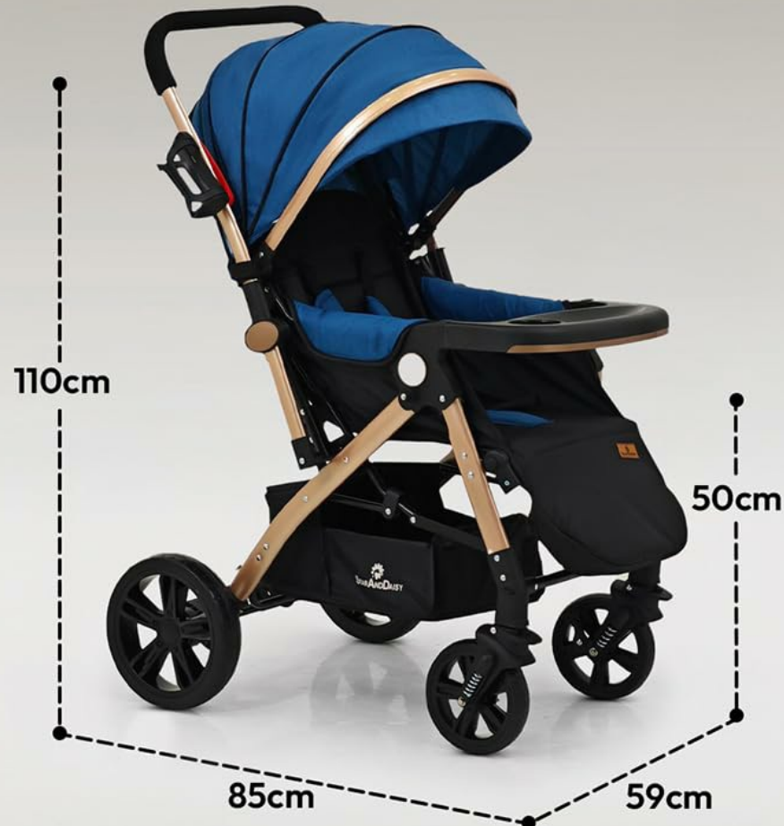
Figure 7.1: Key product specifications and dimensions of the Luna Luxe Baby Stroller.