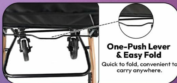
Figure 3.1: The stroller in its folded state, highlighting the easy-fold mechanism for compact storage.