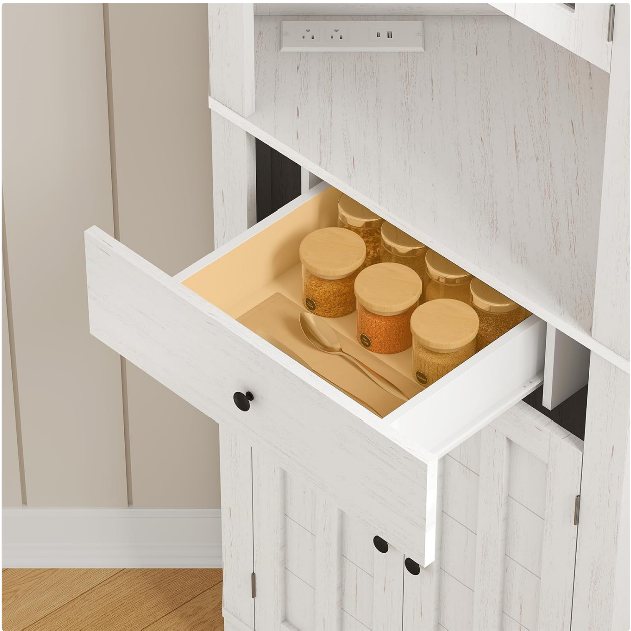
Image 5.4: The spacious drawer with smooth gliding mechanism for easy access.