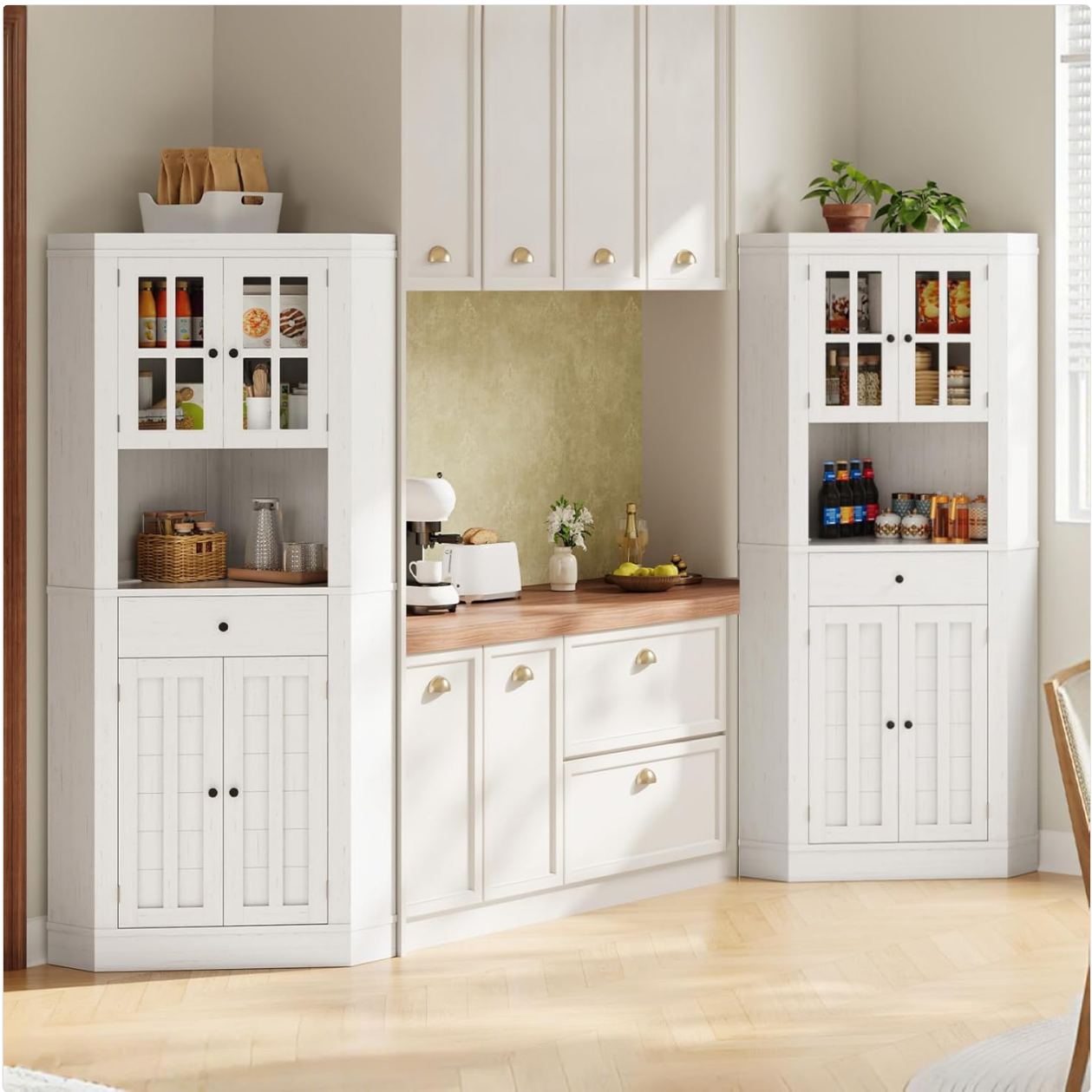
Image 5.2: The cabinet offers diverse storage options including glass-doored upper shelves, an open compartment, a drawer, and lower cabinet shelves.