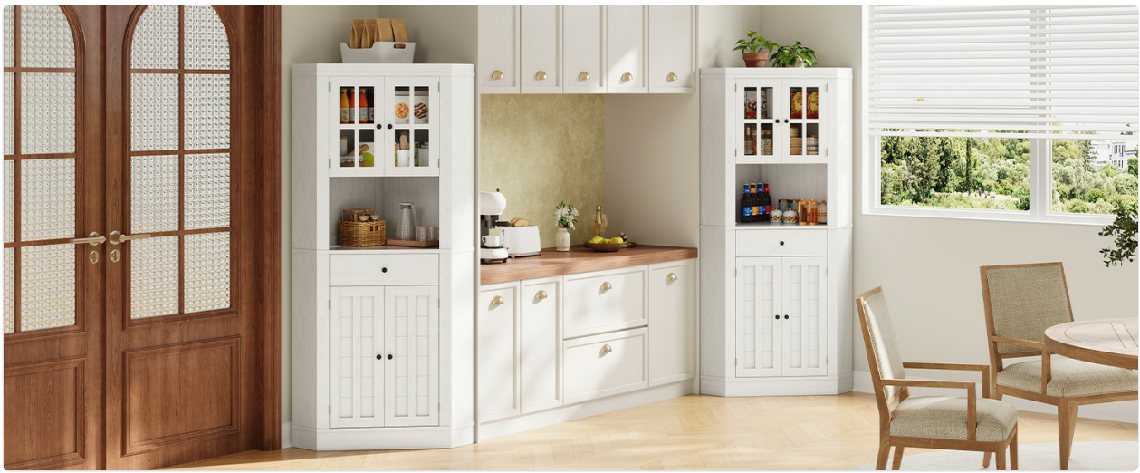
Image 4.2: The upper shelf with raised edges, providing anti-fall protection for items.