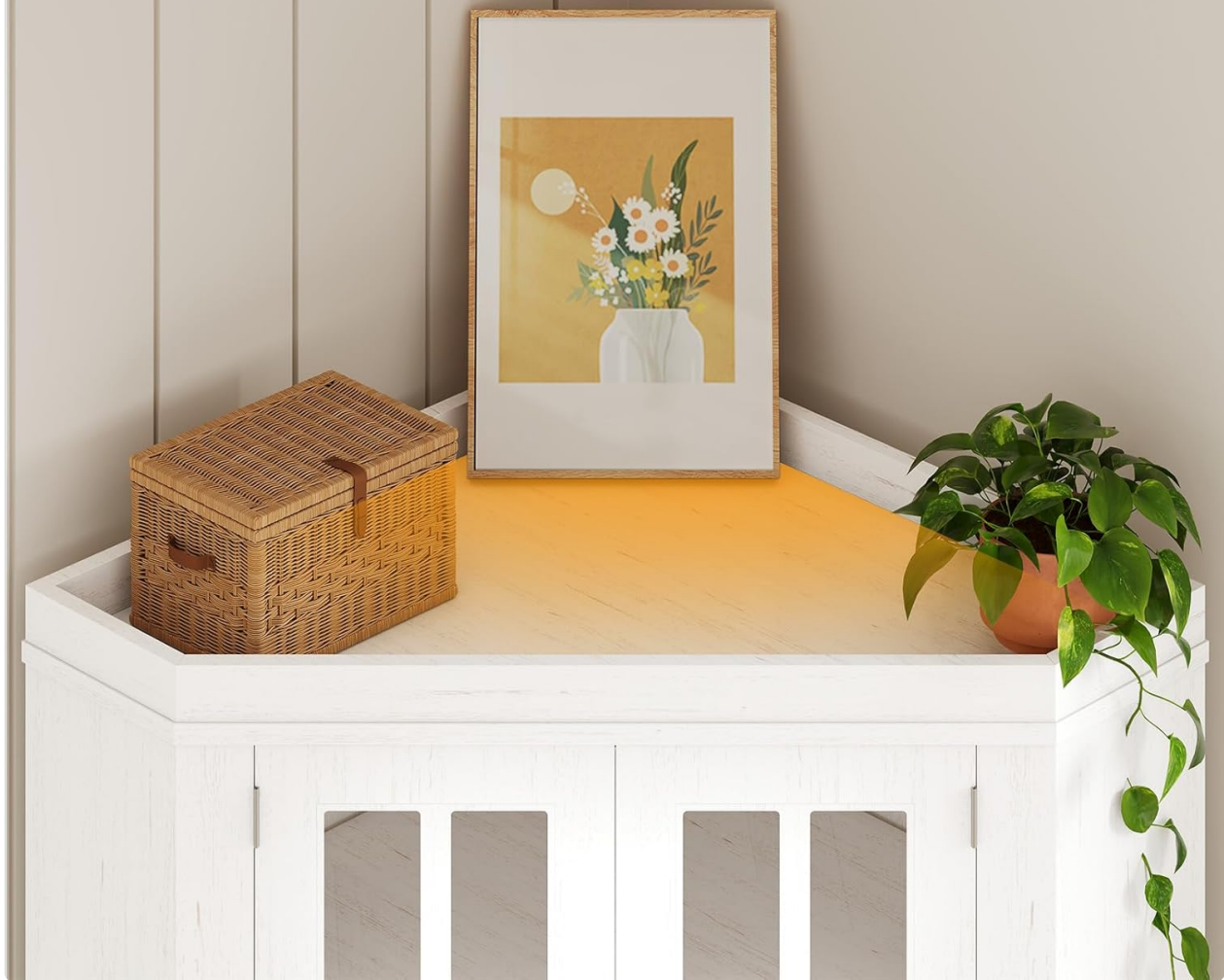
Image 5.3: The adjustable shelf feature allows customization of storage space.