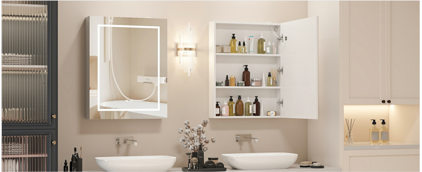
Figure 2: Mepplzian LED Medicine Cabinet with Right Hinges. This image displays the cabinet's internal storage capacity with three shelves.

Note: This cabinet is designed for surface mounting only and cannot be recessed into the wall.