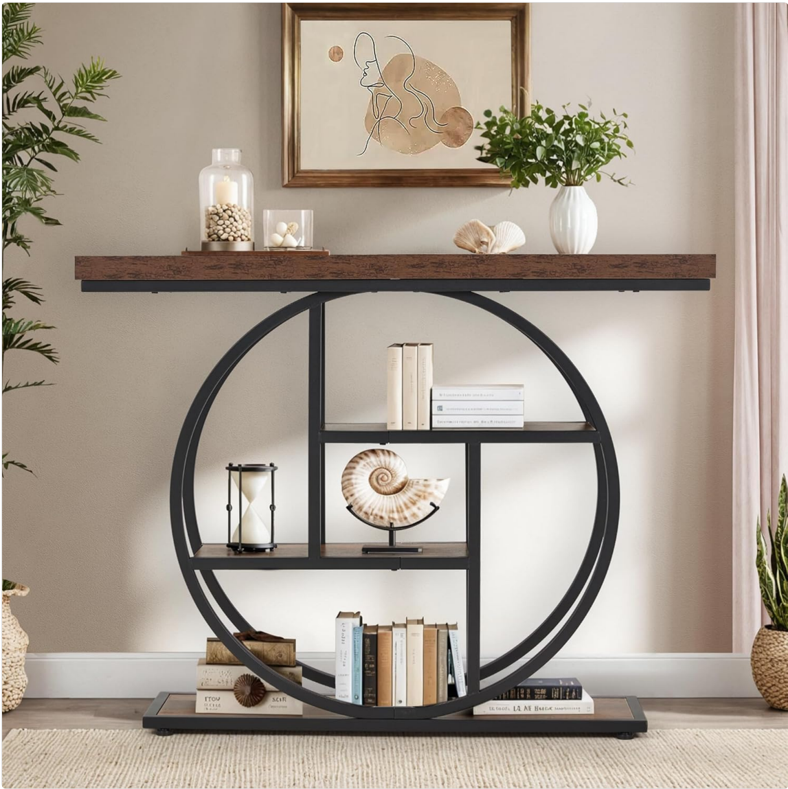
Figure 2.1: Product Dimensions and Components Overview. This image illustrates the overall dimensions and key components of the console table, including the tabletop, circular metal frame, and storage shelves.