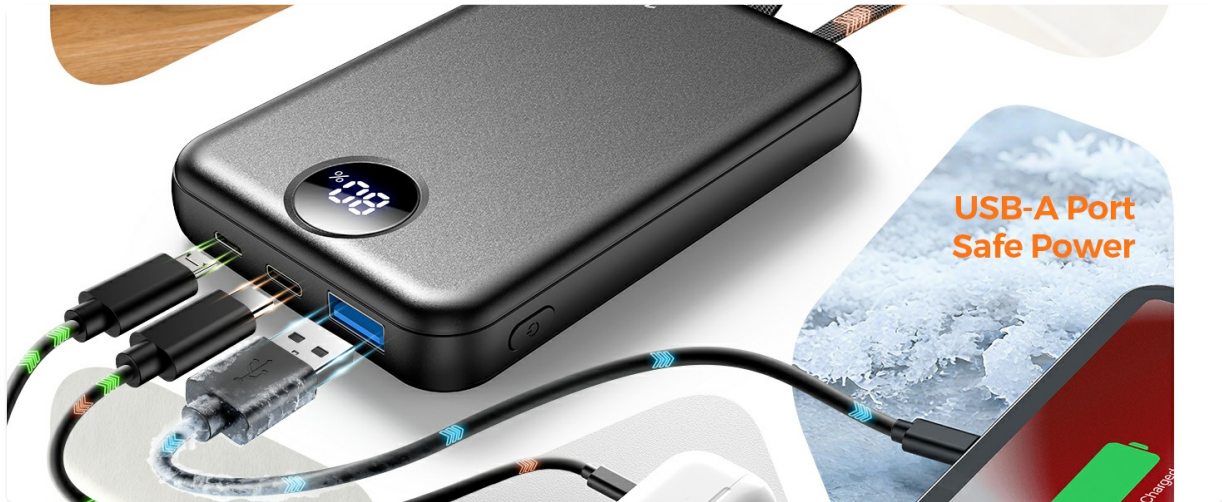
Image: The HAIARA N1 Power Bank being charged via its built-in USB-A cable plugged into a wall adapter, and also showing charging via a separate USB-C cable and Micro-USB cable. The LED display shows charging progress.

The power bank offers multiple input options for recharging itself, including a built-in USB-A cable, a dedicated USB-C input port, and a Micro-USB input port. This flexibility ensures you can always recharge the power bank regardless of available cables or adapters.