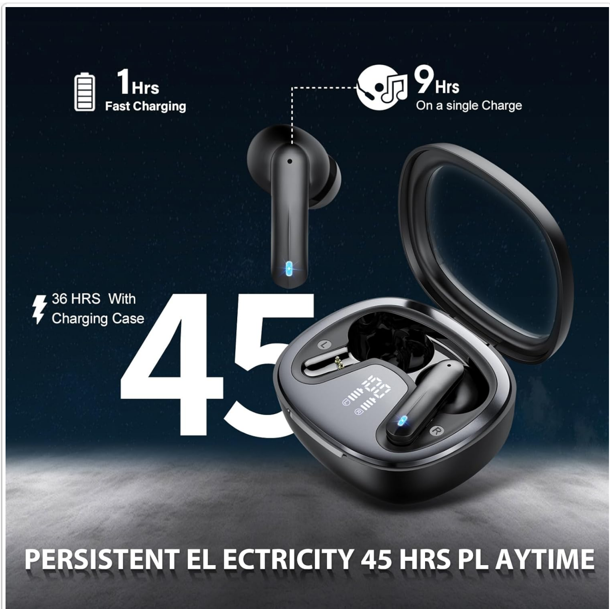
Image 2.1: Diagram illustrating the charging process and battery life, showing 1.5 hours for full charge and up to 45 hours total playtime with the charging case.