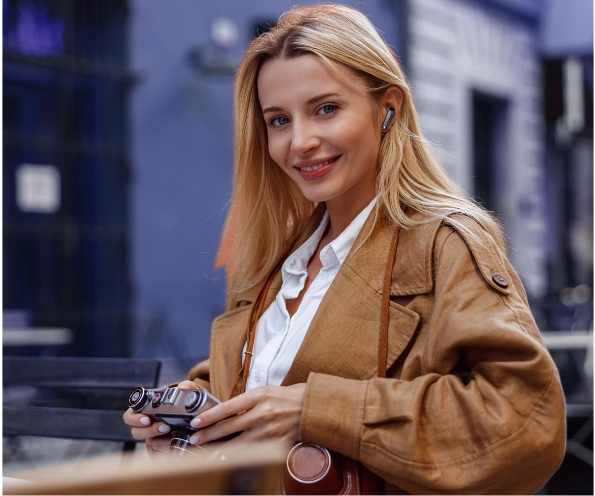
Image 3.2: A user enjoying clear audio with the ENC feature, demonstrating its effectiveness in reducing ambient noise.

ENC noise reduction can reduce background noise by 98%, allowing you to fully immerse yourself in your favorite music, games, audiobooks, and podcasts.