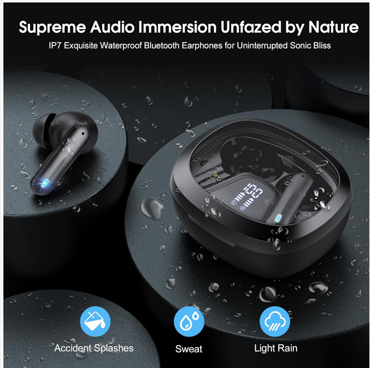
Image 4.1: Illustration depicting the IP7 waterproof capabilities, showing resistance to splashes, sweat, and light rain.

activities. However, the charging case is not waterproof. Do not submerge the earbuds or charging case in water for extended periods or expose them to high-pressure water jets.