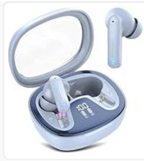
Image 1.2: Visual representation of the items included in the product package: earbuds, charging case, ear tips, USB-C cable, and user manual.