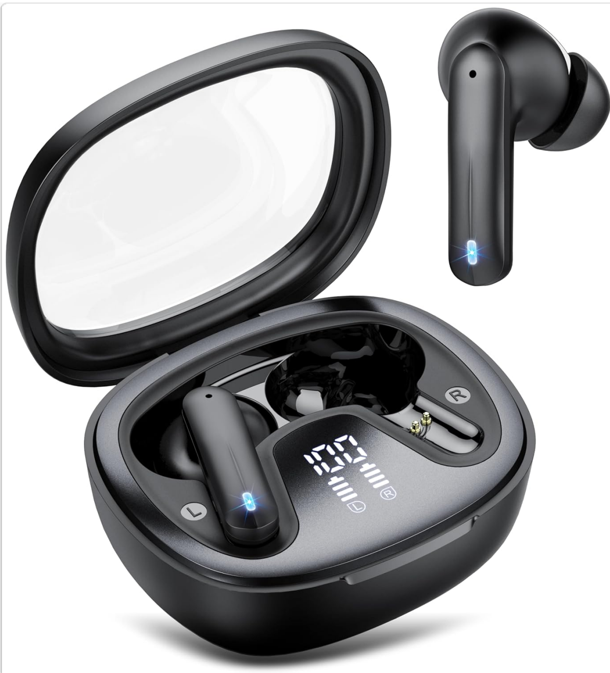
Image 1.1: The AOSRAU H69 Wireless Earbuds shown with their charging case. The case features an LED display indicating battery levels for both the case and individual earbuds.