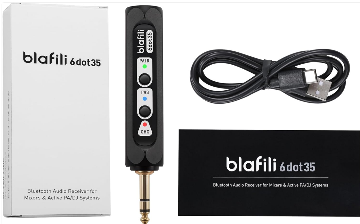
Image: The blafili 6dot35 receiver, a USB-C charging cable, and the quick start guide are displayed as the package contents.