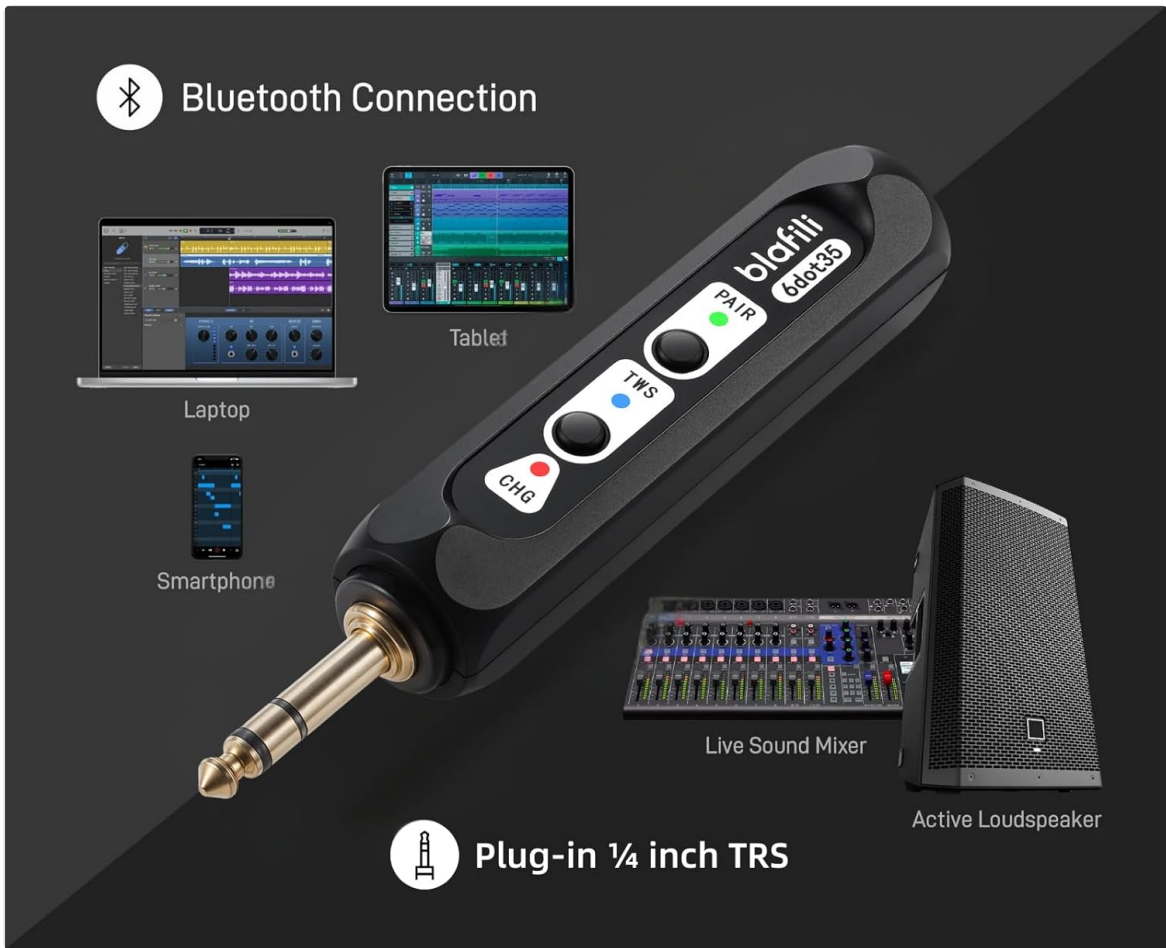
Image: The blafili 6dot35 Bluetooth Receiver shown with its 1/4 inch TRS plug, connecting wirelessly to a laptop, smartphone, and tablet, and wired to a live sound mixer and active loudspeaker.