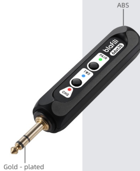
Image: A detailed diagram of the blafili 6dot35 highlighting its 1/4 inch TRS output, USB-C charging port/audio input, PAIR button, TWS button, and CHG button with corresponding LED indicators.