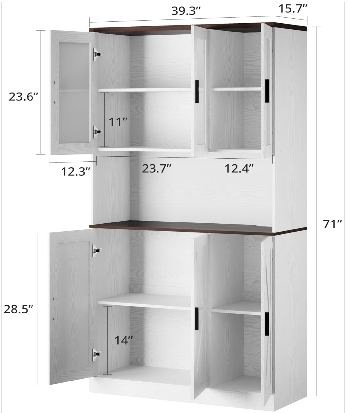
Figure 1: Cabinet dimensions and component breakdown. This diagram illustrates the overall dimensions and the sizes of individual sections, aiding in assembly and placement.