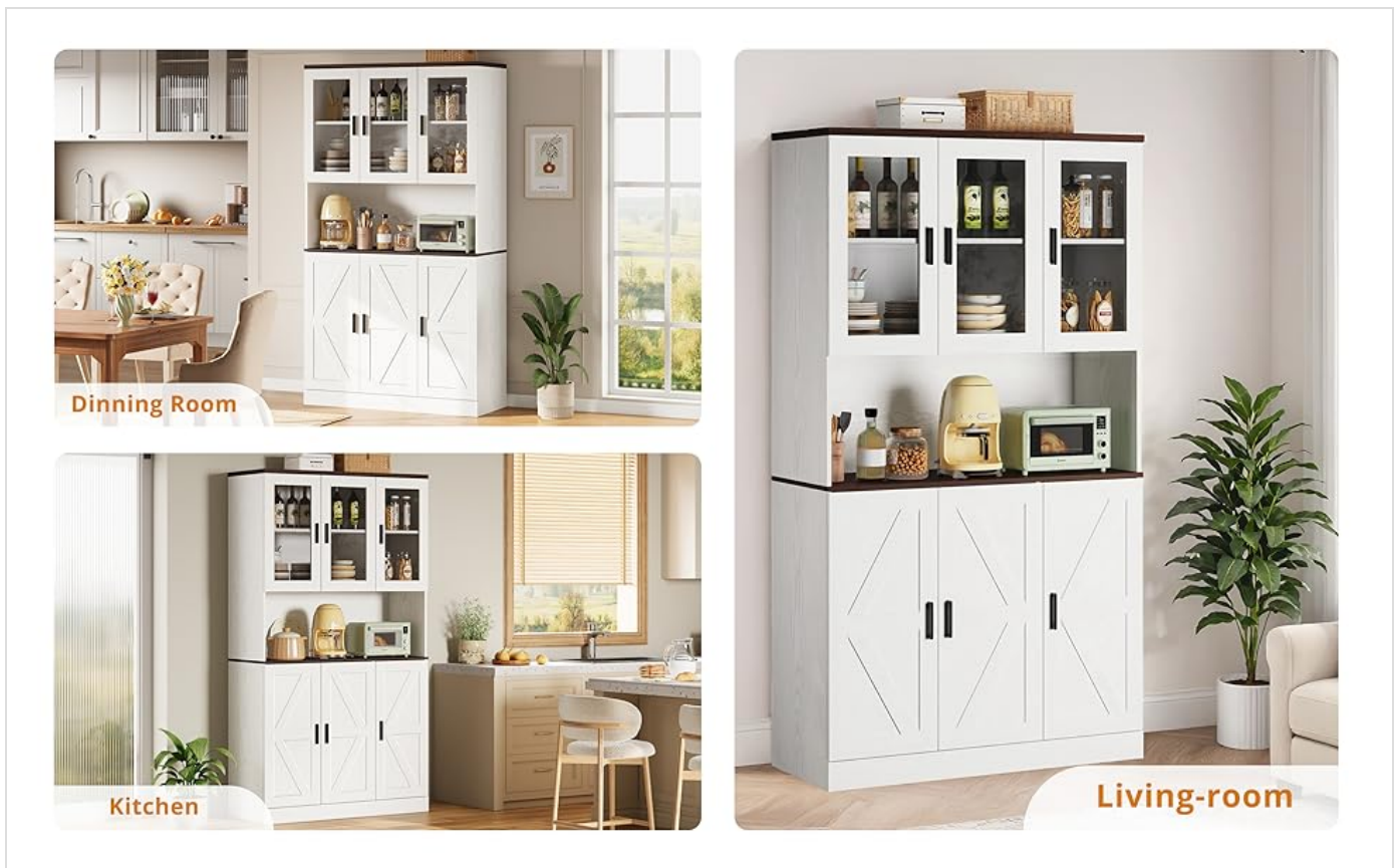
Figure 3: Functional storage areas. This diagram highlights the different sections of the cabinet and their recommended uses, from glass-door cabinets to the small appliance hutch and base storage.