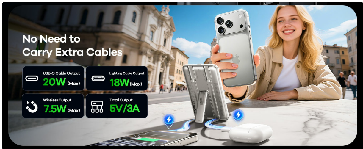
Image: The power bank simultaneously charging an iPhone wirelessly and AirPods using its built-in Lightning cable, demonstrating its multi-device charging capability.