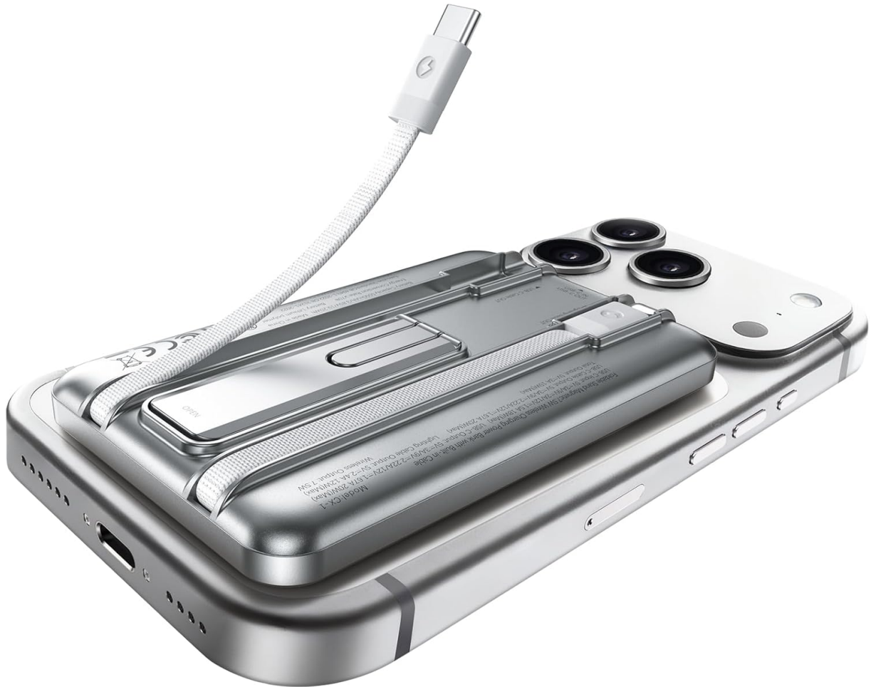
Image: The REWONDER MagSafe Power Bank with its built-in USB-C cable extended, ready for charging.

To ensure optimal performance, fully charge your REWONDER MagSafe Power Bank before first use. The power bank can be recharged using a PD charger, typically taking about 2–3 hours for a full charge. Use the integrated USB-C cable or an external USB-C cable to connect the power bank to a compatible power source.