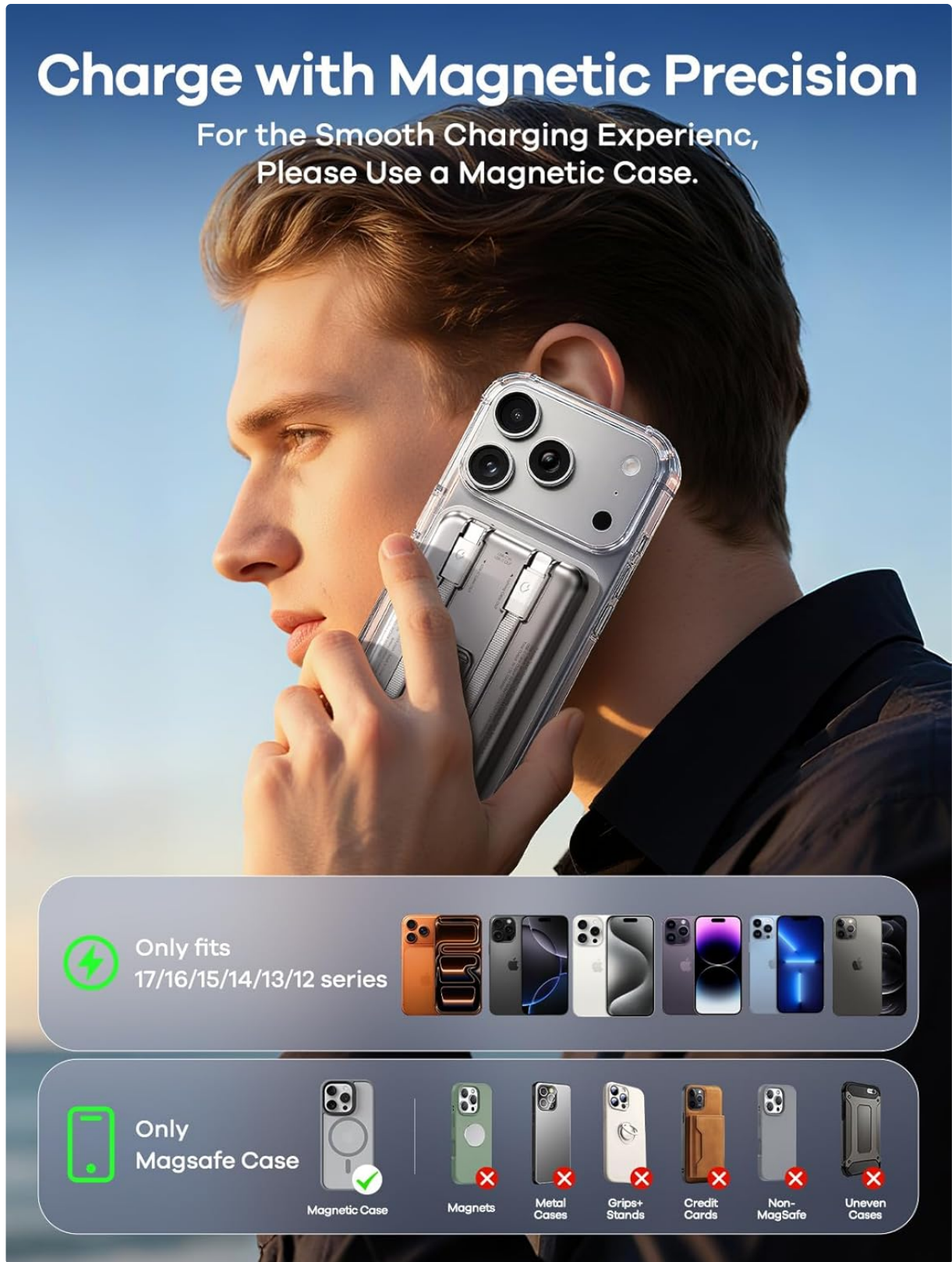
Image: A diagram illustrating the strong magnetic attachment of the power bank to an iPhone, highlighting MagSafe compatibility.

For the Smooth Charging Experience, Please Use a Magnetic Case.