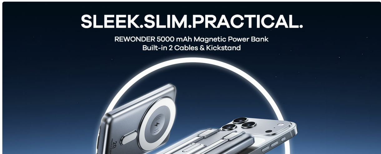
Image: The REWONDER MagSafe Power Bank showcasing its sleek design, built-in cables, and kickstand.

The REWONDER MagSafe Power Bank (Model CX-1) is an ultra-slim, 5000mAh magnetic portable charger designed for convenience and versatility. It integrates magnetic wireless charging, built-in USB-C and Lightning cables, and a foldable kickstand into a single compact device. This power bank supports PD 20W fast charging and is optimized for iPhone 12-17 MagSafe models, including Pro and Pro Max variants, as well as AirPods and other Apple devices via the built-in Lightning cable.