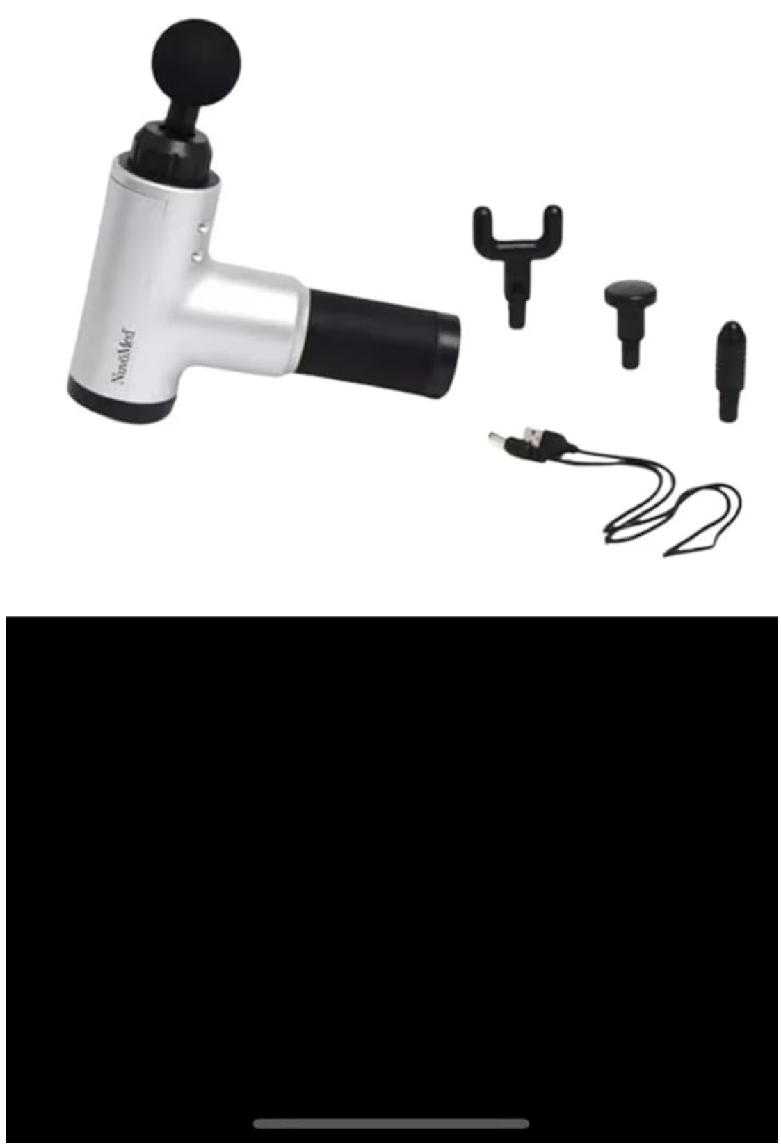
Image: The Nuvomed Compact Massage Gun, shown in silver and black, accompanied by its four distinct massage heads and a USB charging cable. This image illustrates all components included in the package.