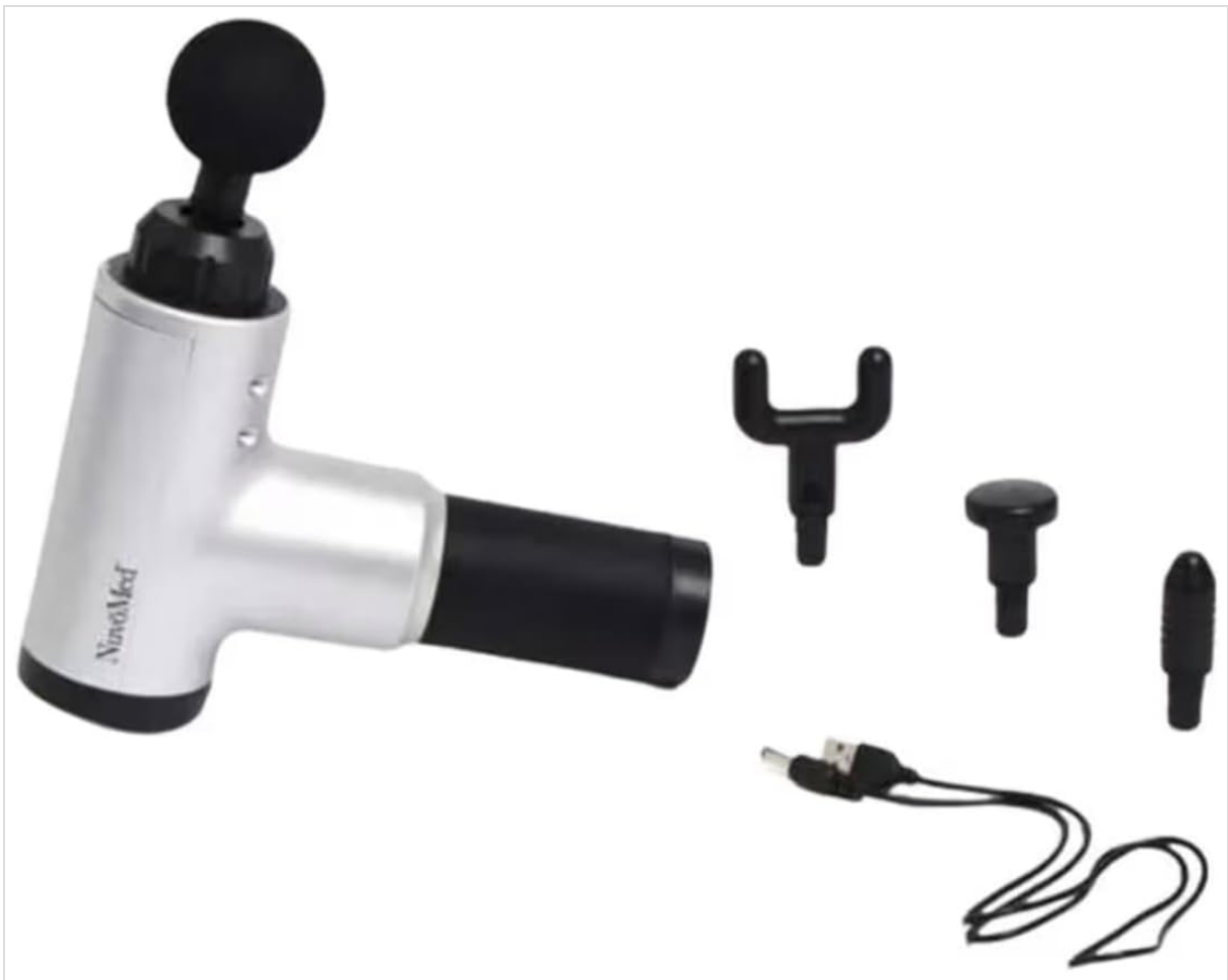
Image: A detailed view of the Nuvomed Compact Massage Gun, featuring a spherical massage head already inserted. The other three interchangeable massage heads (fork, flat, and bullet) are shown separately, illustrating their distinct shapes and purposes.