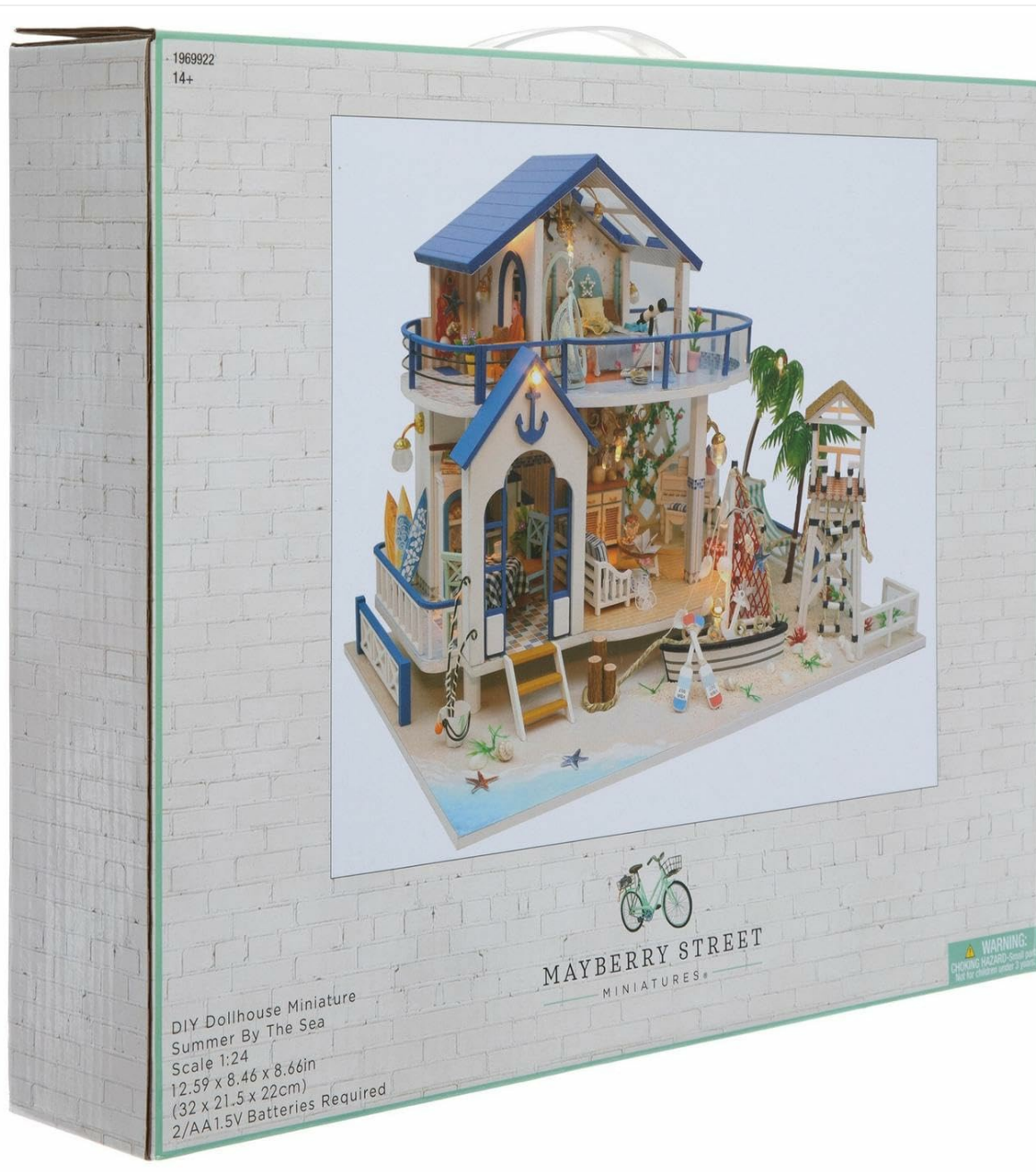
Figure 1: Assembled 'Summer by The Sea' Miniature Room Kit