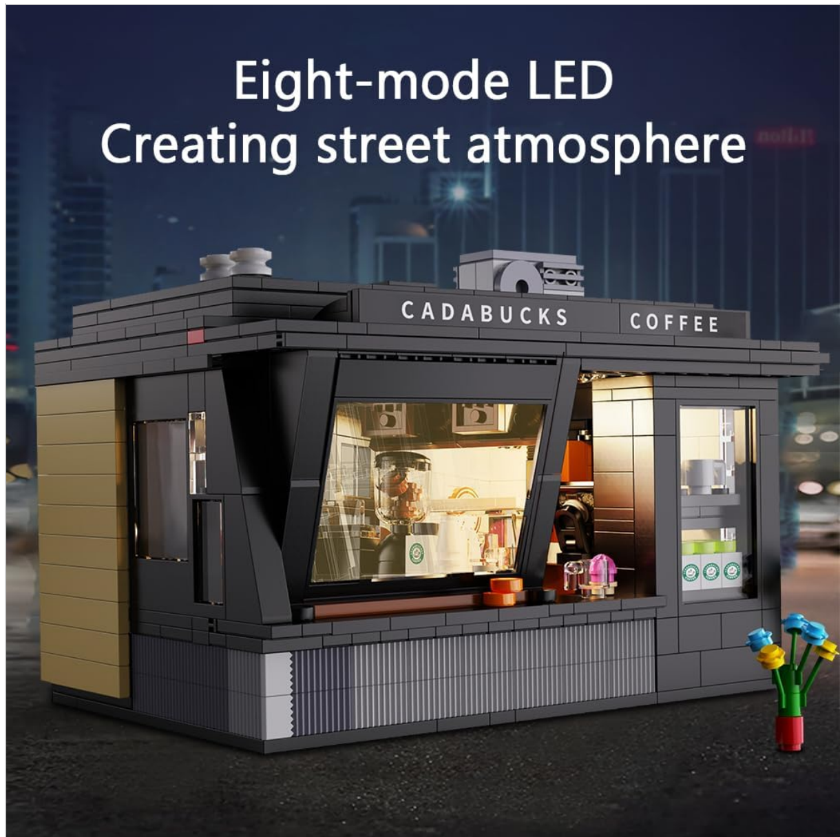
Image 5.1: The model illuminated, highlighting the multi-mode LED lighting system.

The LED system features multiple lighting modes to enhance the display. Refer to the specific instructions in your manual for details on how to cycle through these modes, typically via a small button or switch on the USB cable or integrated into the model.