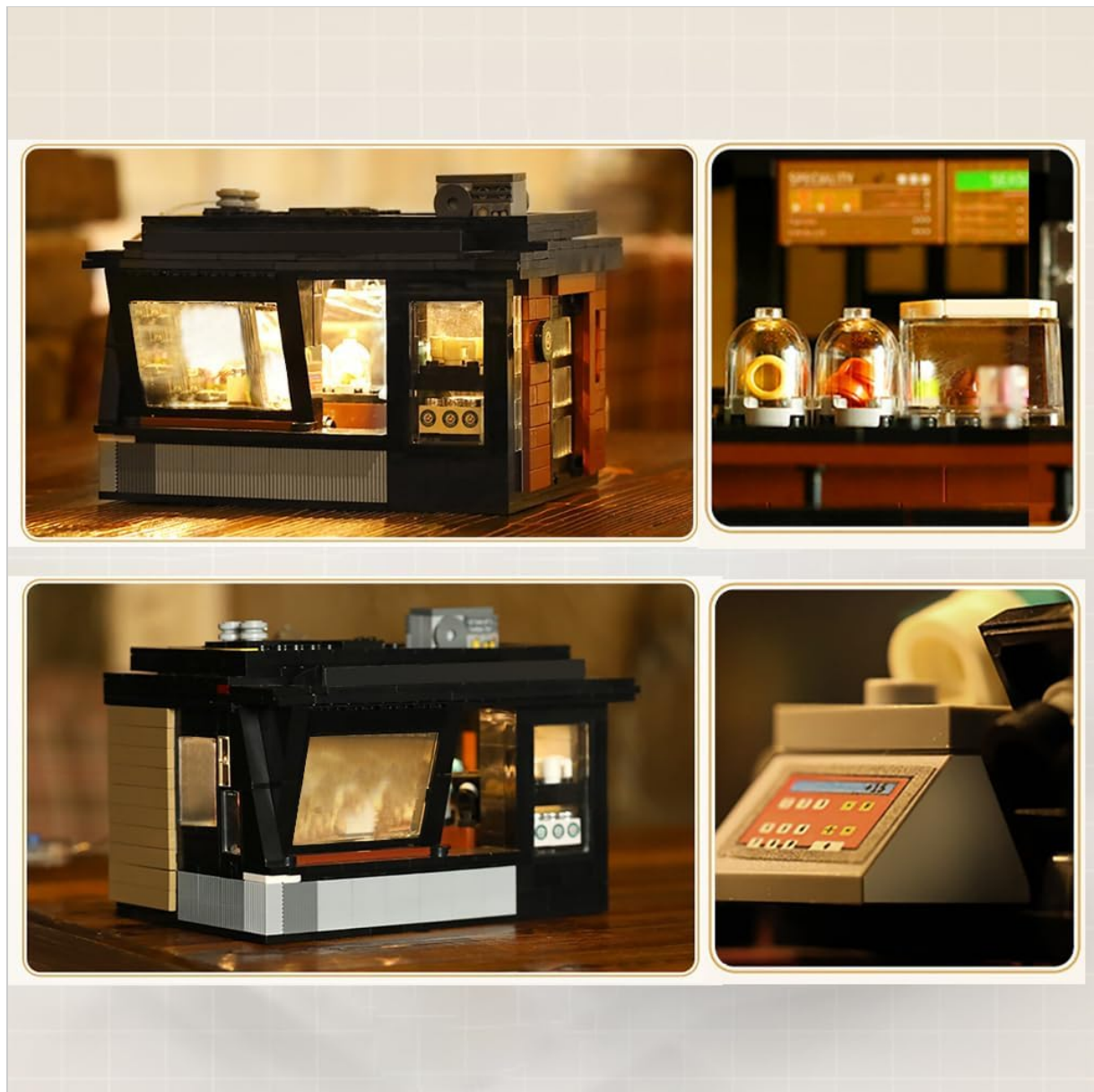
Image 5.2: Close-up views of the illuminated interior details and the overall lit model.