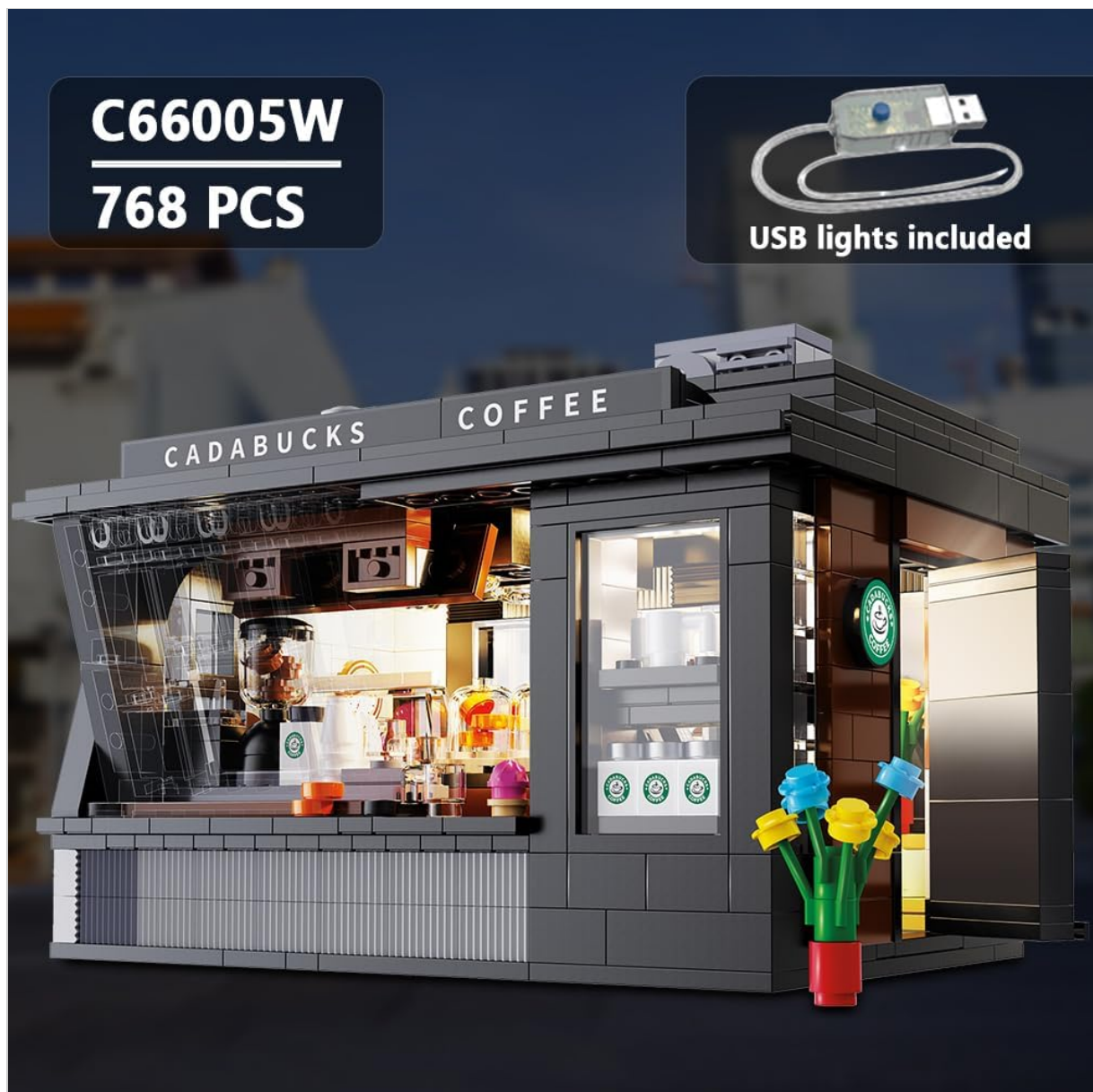
Image 3.1: Product packaging indicating 768 pieces and included USB lights.