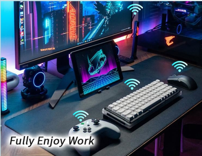
Fully Enjoy Work