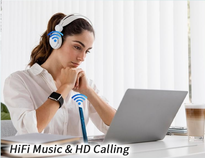
HiFi Music & HD Calling