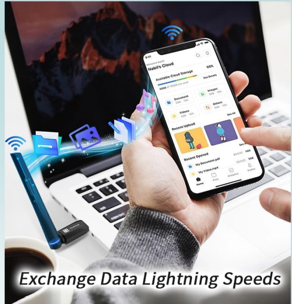
Exchange Data Lightning Speeds