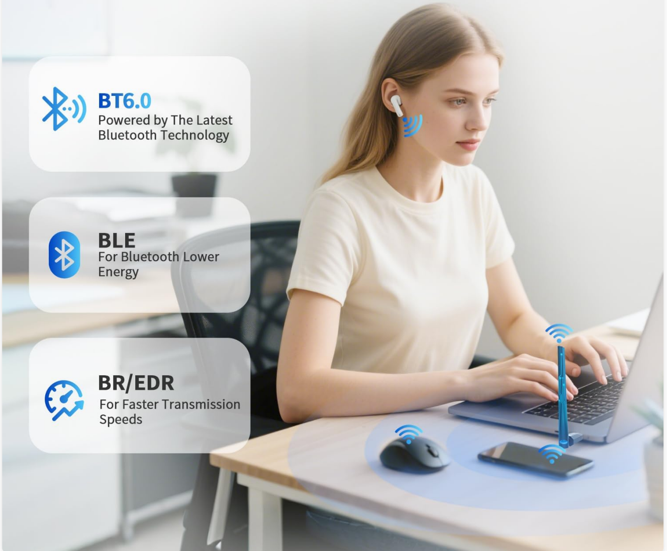
Image: The BT609 adapter demonstrating its strong signal and greater coverage in an office setting, with an adjustable antenna for optimal range.