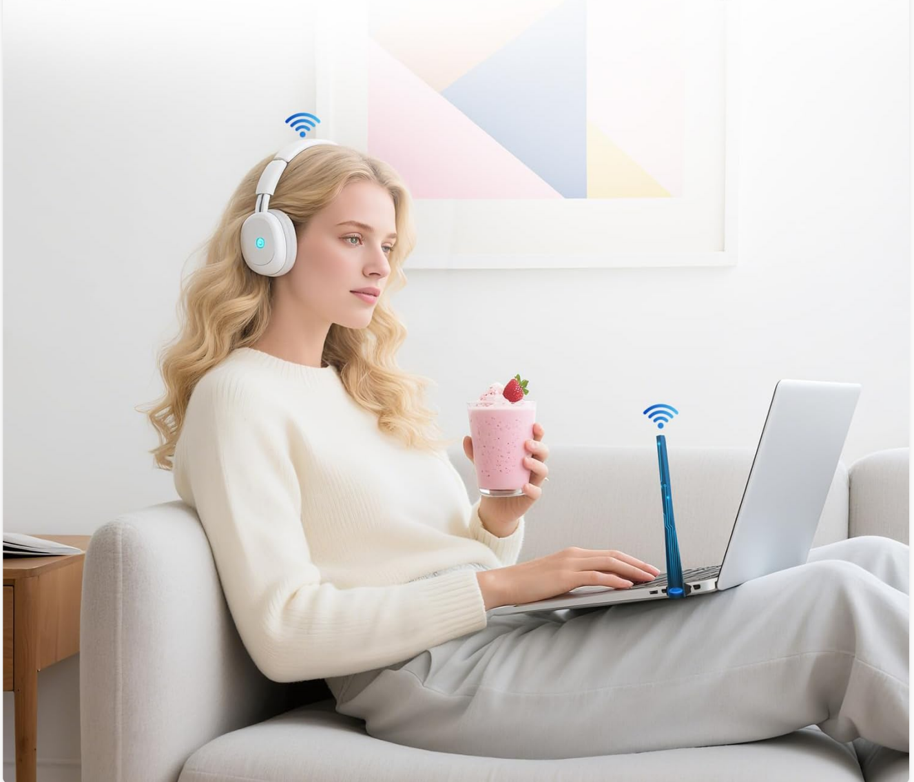
Image: A user experiencing efficient work and a better Bluetooth experience with the BT609 adapter, connecting headphones and a mouse.

Synchronised Audio and Video with No Lag