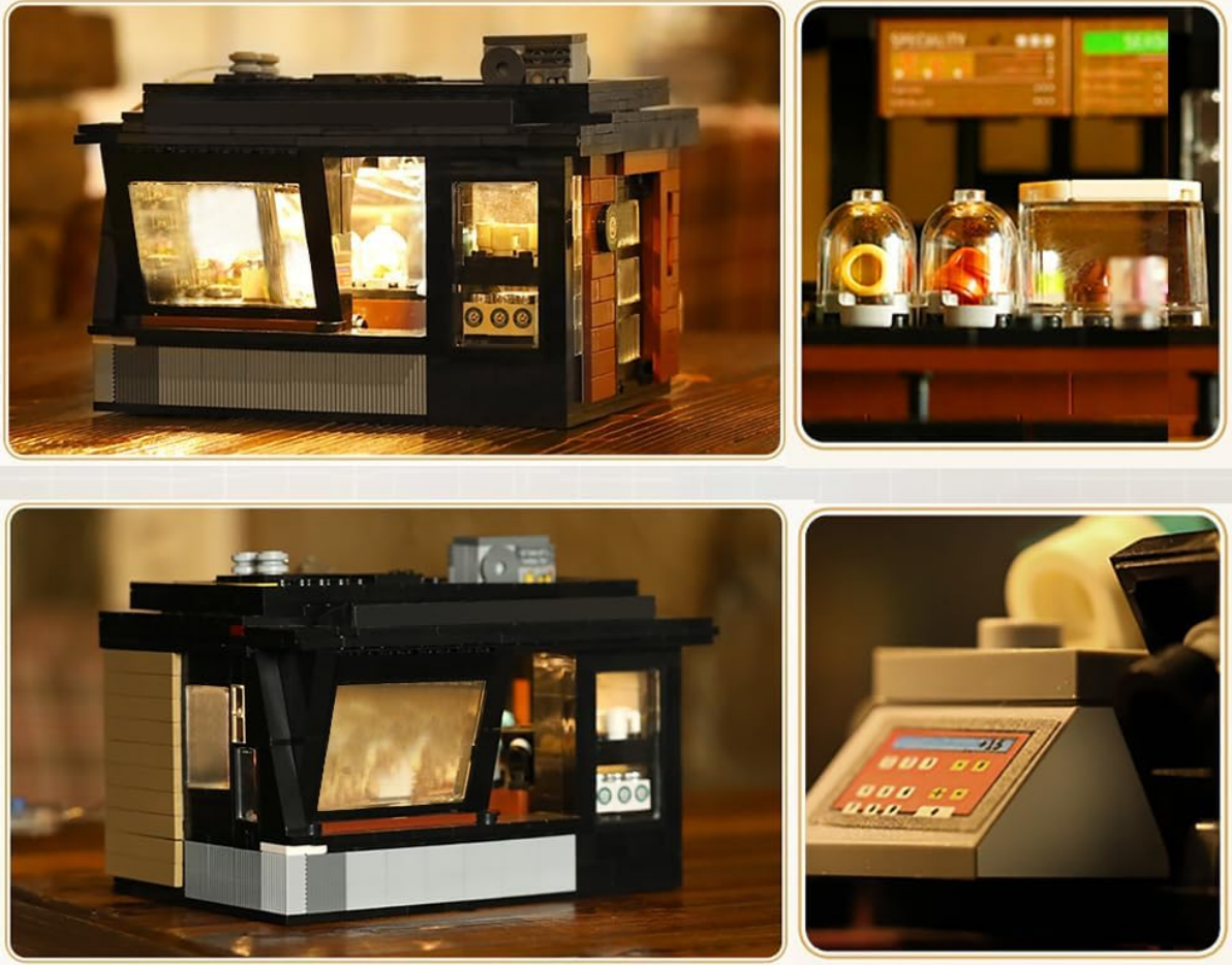
Image: An interior view of the assembled coffee house, showcasing the detailed bar area, coffee equipment, and the effect of the integrated LED lighting.