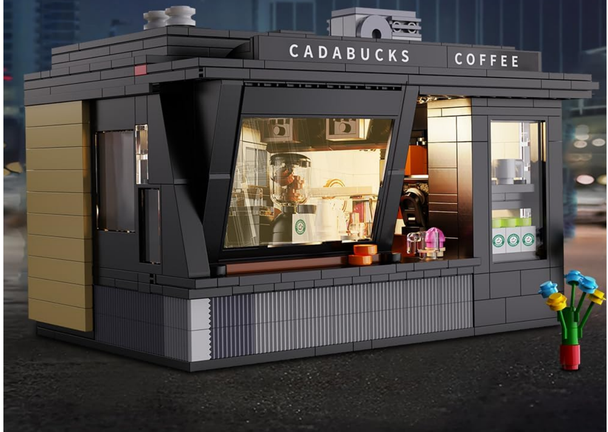
Image: The coffee house model illuminated by its eight-mode LED lighting system, demonstrating how it creates a vibrant street atmosphere.