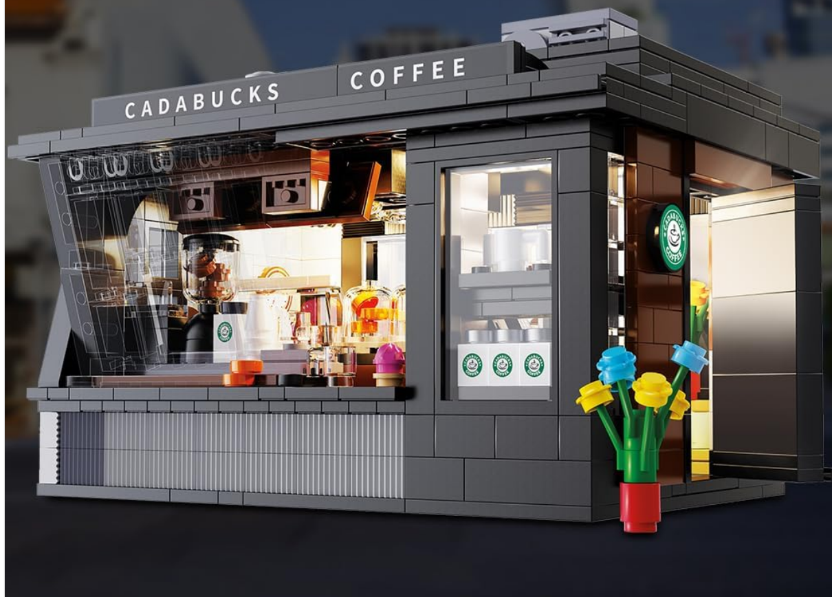
Image: The complete CaDA Master C66005W Japanese Coffee House Building Set, highlighting its 768 pieces and included USB lighting system.