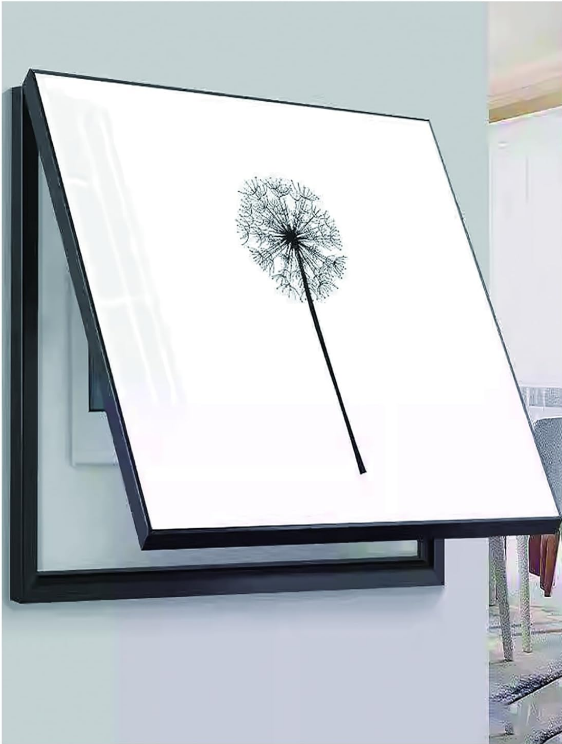
Figure 1: The Electric Meter Chest Decorative Painting, featuring a dandelion design, shown with its lift-open mechanism providing access to the meter box.