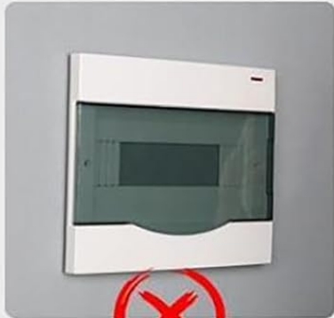
【Exposed meter box】