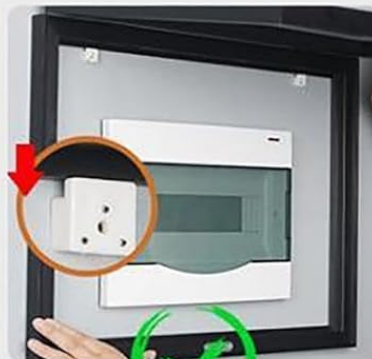
【No need to drill holes】