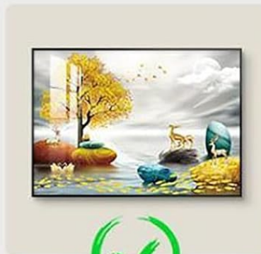
【Farewell to nudity】