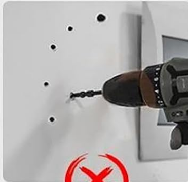
Punching and destroying the wall