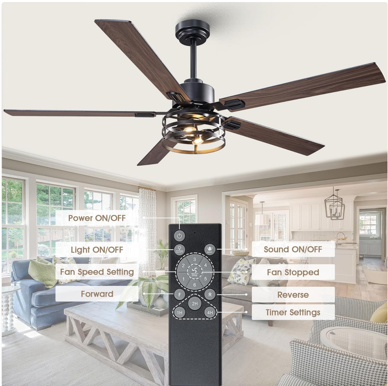
Image: Detailed view of the remote control with labels for each button's function, including power, light, fan speed, direction, and timer.