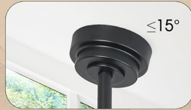
Image: Diagram illustrating the fan's dimensions, available downrod lengths, and suitable ceiling types (flat and sloped up to 15 degrees).