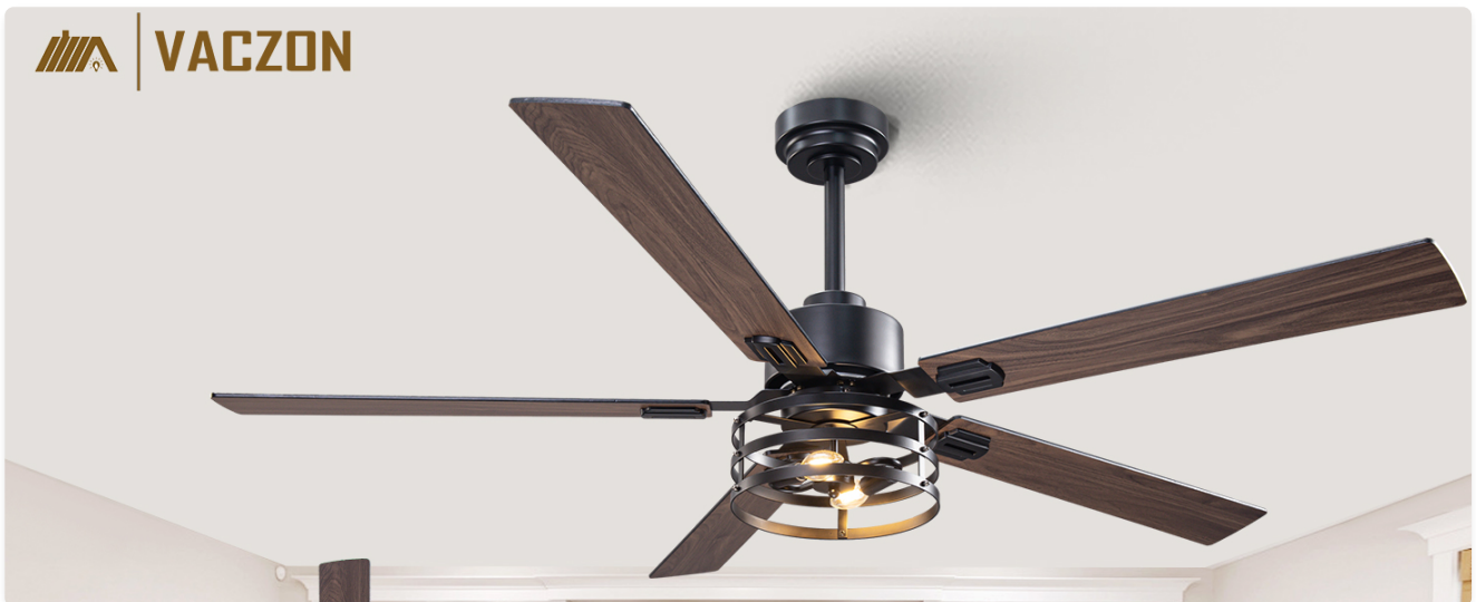
Image: Overview of the Vaczon 60" Farmhouse Ceiling Fan highlighting key features such as energy efficiency, quiet operation, and reversible motor.

This ceiling fan features a durable construction, a reversible DC motor for year-round comfort, 6-speed settings, and convenient control via both a remote and the "FanLamp Pro" mobile application. The dual-finish blades allow for customization to match your interior decor.