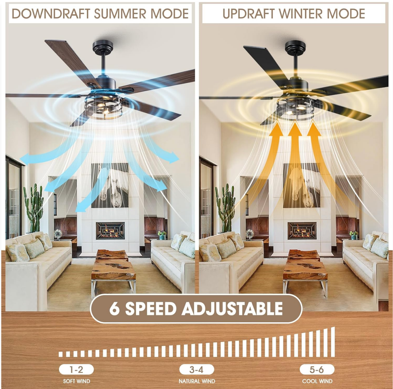
Image: Illustration of the fan's reversible motor function, demonstrating downdraft for summer cooling and updraft for winter heat circulation, along with the 6-speed adjustment scale.