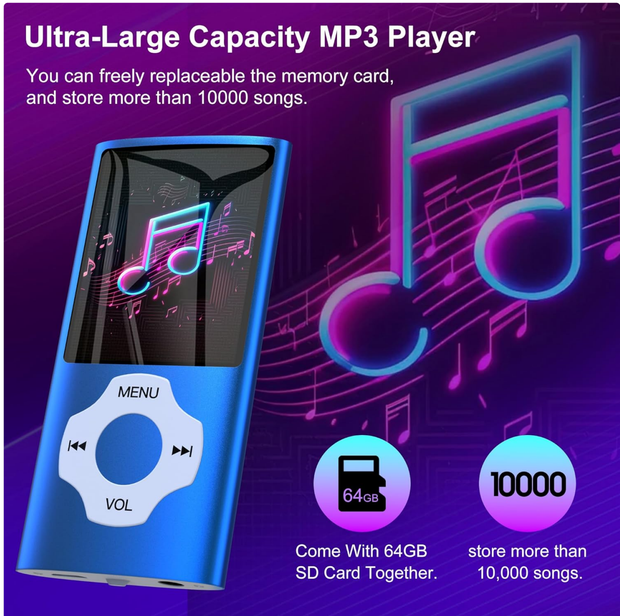
Image 6: The MYMAHDI MP3 Player alongside a 64GB Micro SD card, symbolizing its large capacity and ability to store over 10,000 songs.

Connect the MP3 player to your computer using the USB cable. The device will appear as a removable drive. Open the drive and navigate to the appropriate folders (e.g., 'Music', 'Video', 'Ebook', 'Photos'). Drag and drop your desired files from your computer into these folders. Ensure files are in supported formats for optimal playback.