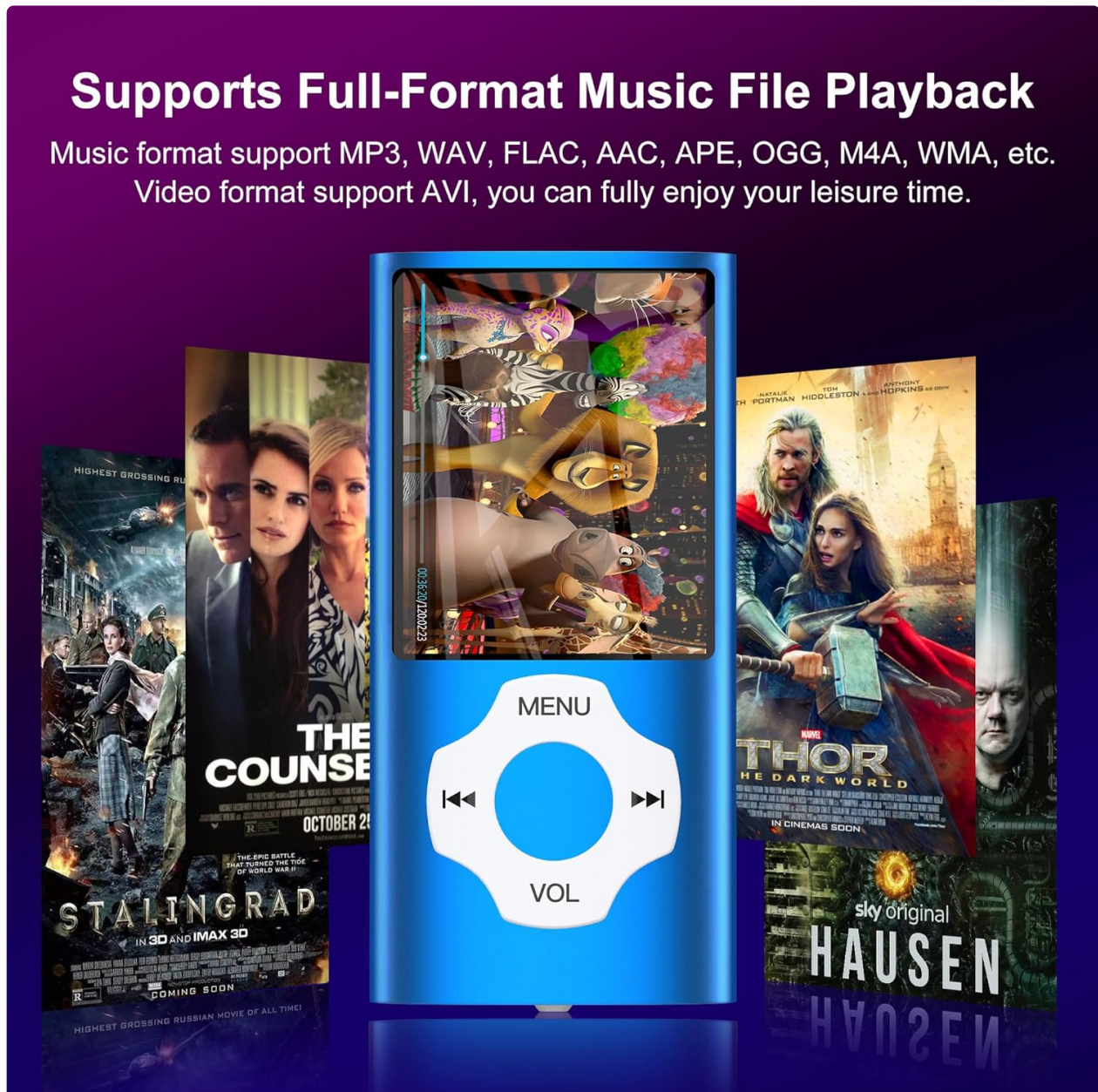
Image 4: The MYMAHDI MP3 Player screen displaying a video, demonstrating its video playback capability.

Select 'Video' from the main menu. The player supports AVI video format. Note that other video formats may require conversion before they can be played on the device. You may need to contact the seller for a conversion tool if your videos are not in AVI format.