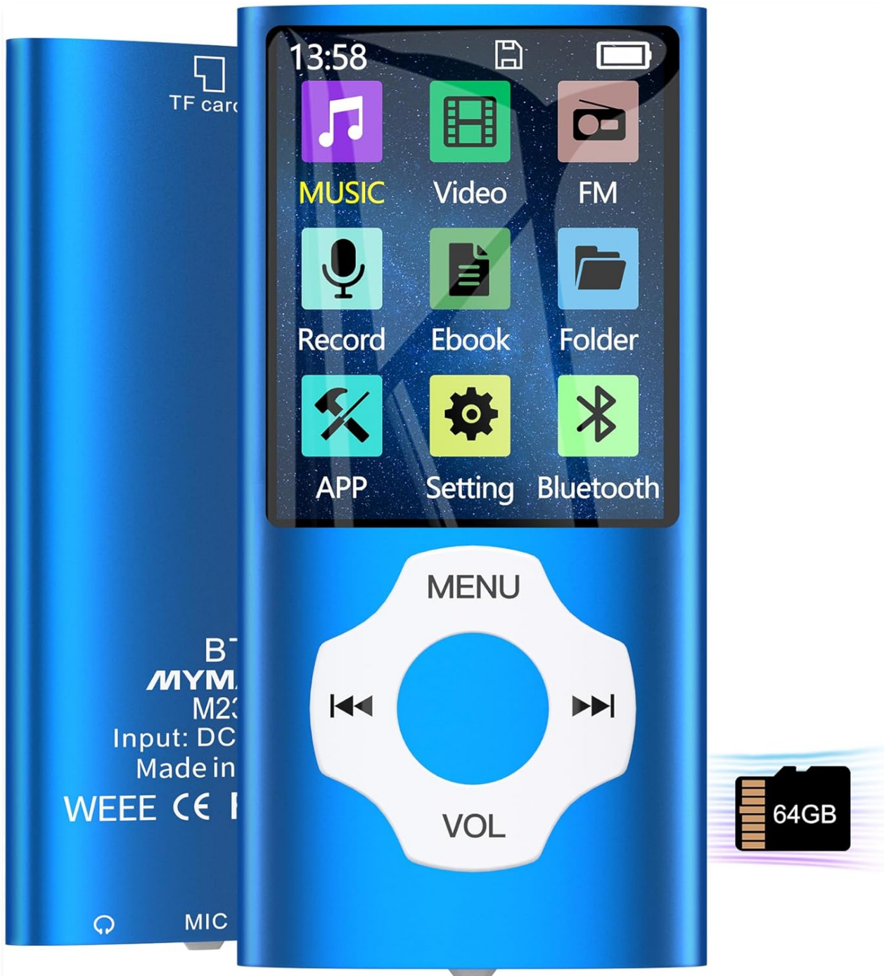
Image 1: Front and back view of the MYMAHDI M230DRKB-64GB Mini MP3 Player, showing the screen and rear label.