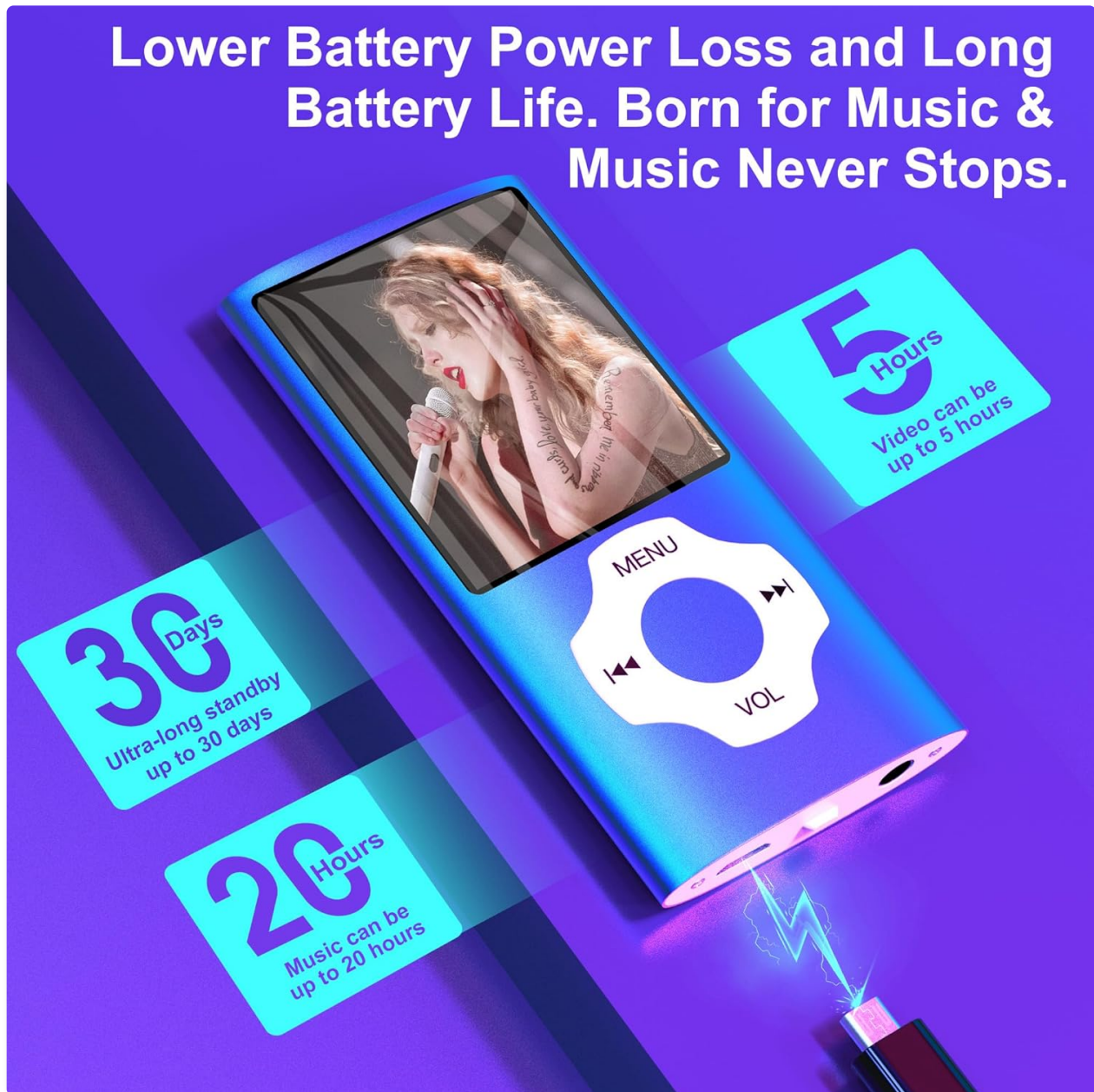
Image 7: Visual representation of the MYMAHDI MP3 Player's battery life, indicating up to 30 days standby, 20 hours of music playback, and 5 hours of video playback.