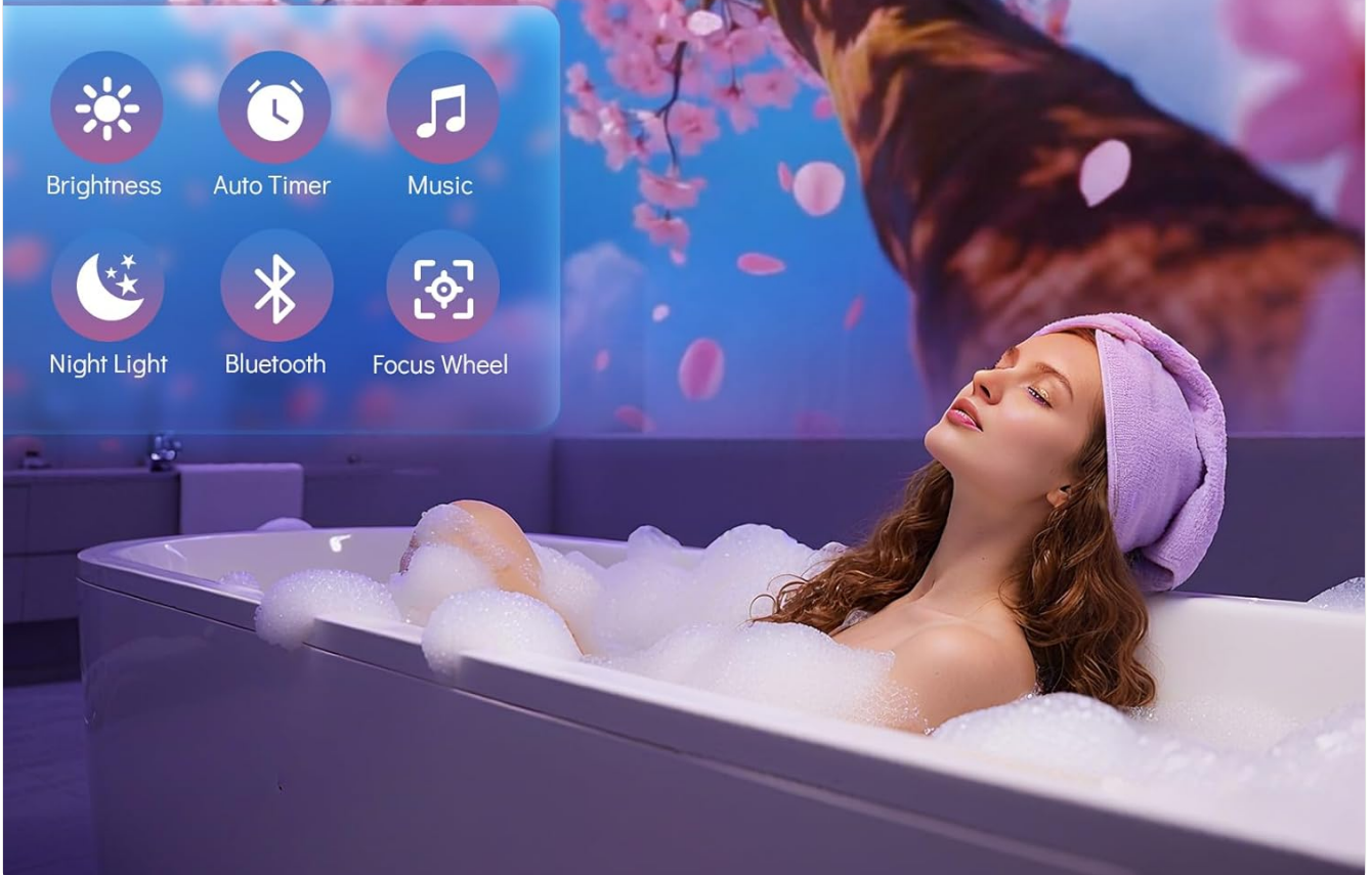
Image: A woman relaxing in a bath with a cherry blossom projection on the wall, highlighting the remote control's ease of use for various functions like brightness, timer, music, night light, Bluetooth, and focus wheel.

Unbox, plug in, and enjoy! Effortlessly, control your projector with the remote.