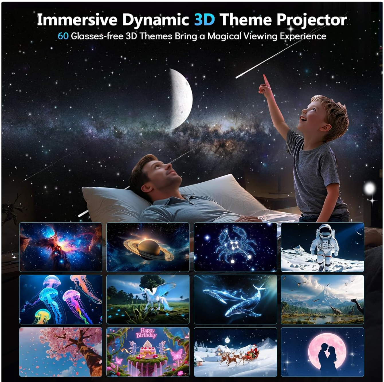
Image: A man and a child observing a projected galaxy scene on a ceiling, surrounded by thumbnails of various available themes such as planets, astronauts, jellyfish, and seasonal scenes.

60 Glasses-free 3D Themes Bring a Magical Viewing Experience