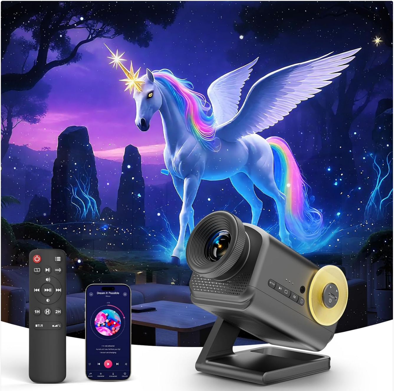
Image: The Rossetta 3D Projector, its remote control, and a smartphone displaying music playback, illustrating the device's features.