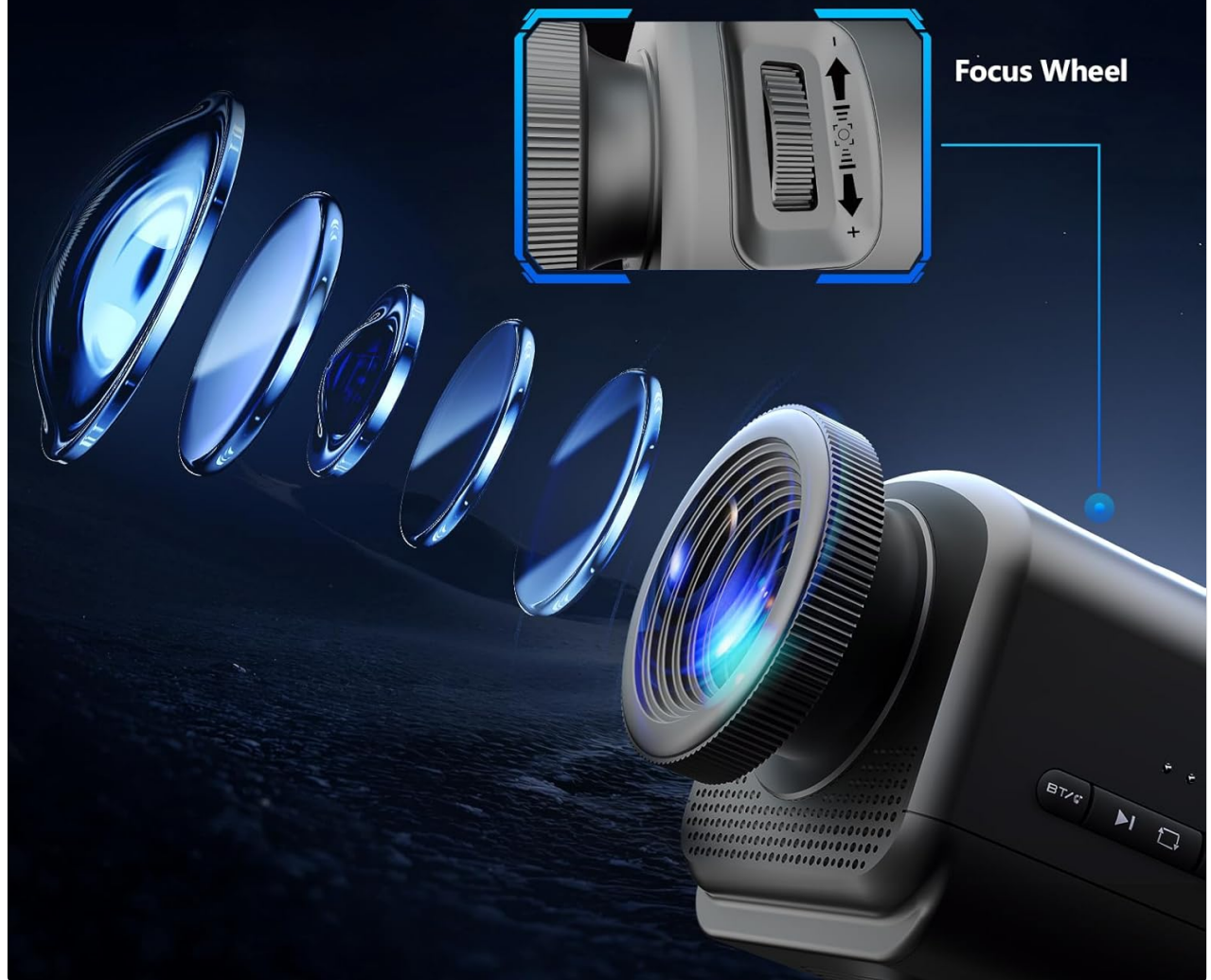
Image: A detailed view of the projector's HD lens assembly, with an inset showing the focus wheel and its adjustment directions for clarity.

Easily adjust the focus for optimal clarity