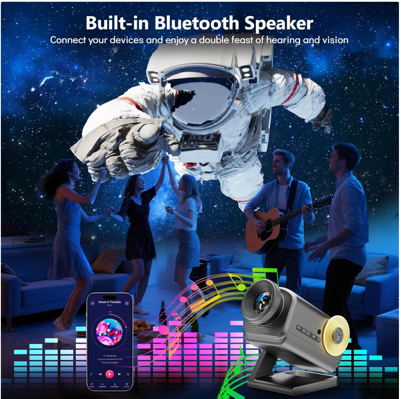
Image: A group of people dancing in a room with an astronaut projection on the wall, accompanied by a graphic equalizer, demonstrating the projector's Bluetooth speaker capability.

Connect your devices and enjoy a double feast of hearing and vision