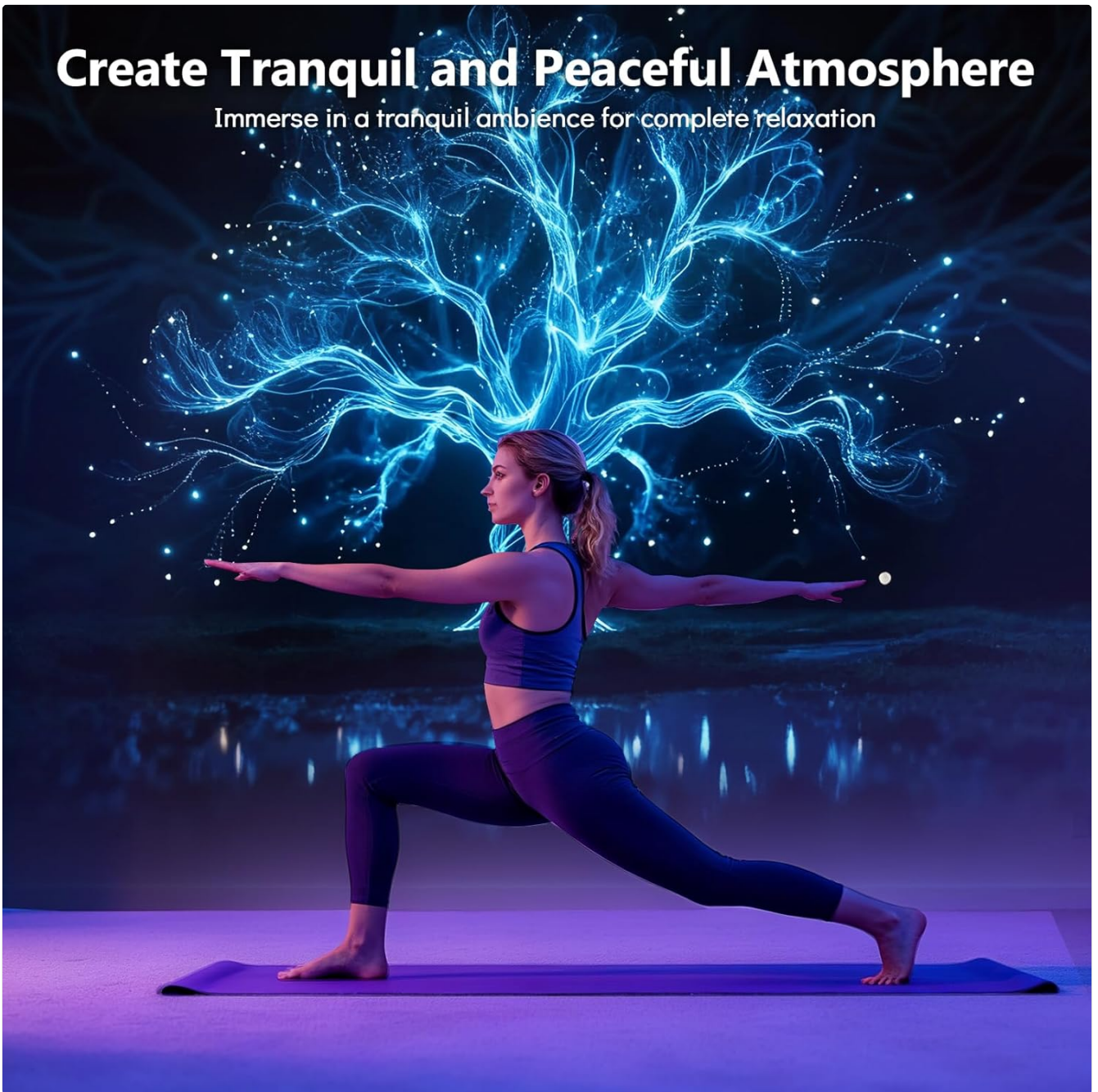
Image: A woman in a yoga pose in a dimly lit room, with a serene, glowing tree-like projection on the wall, illustrating the projector's ability to create a tranquil atmosphere.

Immerse in a tranquil ambience for complete relaxation