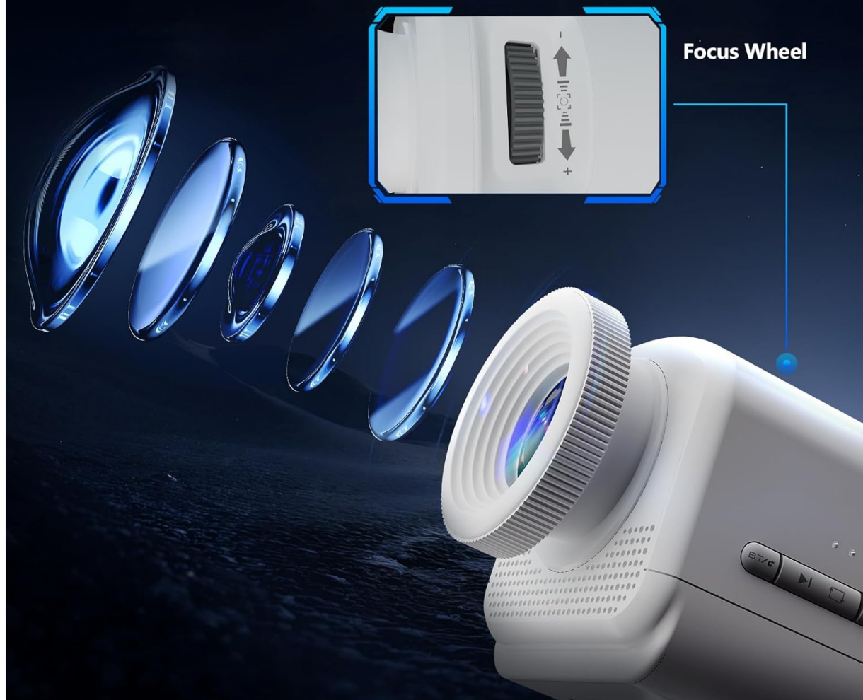
Figure 4.2: Detailed view of the HD lens and focus wheel.

Easily adjust the focus for optimal clarity