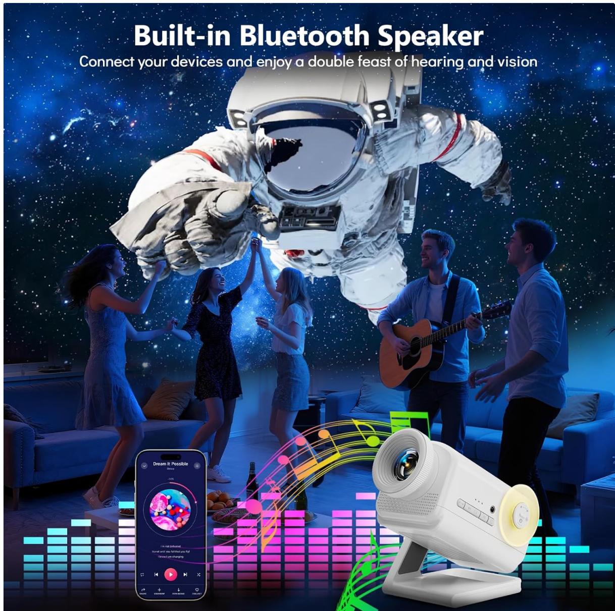
Figure 6.2: Projector demonstrating Bluetooth speaker functionality.