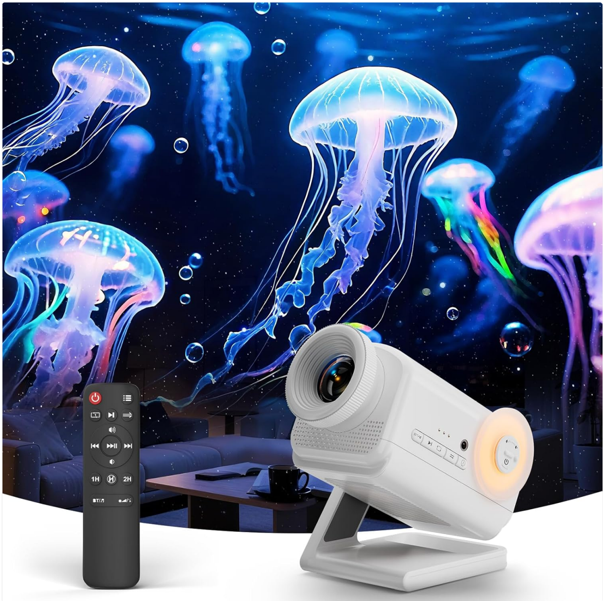
Figure 4.1: Rossetta BL-3D02 3D Galaxy Projector with remote control.

Familiarize yourself with the components and controls of your Rossetta BL-3D02 projector.