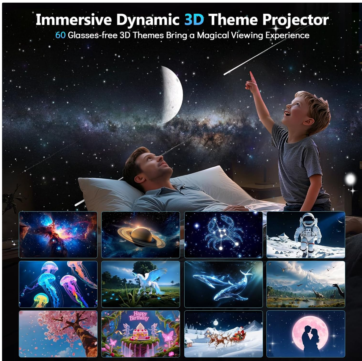
Figure 6.1: Examples of various 3D themes projected by the device.

The projector features 60 dynamic 3D scenes across 12 captivating themes. Use the theme selection buttons on the remote control to cycle through the available projections. Themes include oceans, wildlife, cosmic wonders, and festive scenes.