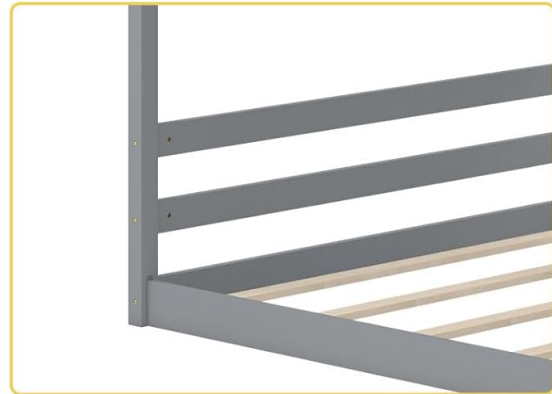
Solid Pine Wood Legs

Image: A close-up view of the three open storage compartments integrated into the bunk bed's staircase, shown holding books and decorative items.