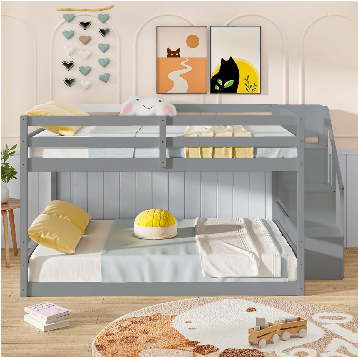
Image: Illustrates the low-profile design of the bunk bed, making it easy to access, and highlights the 12.5-inch full-length guardrails on the upper bunk for safety.