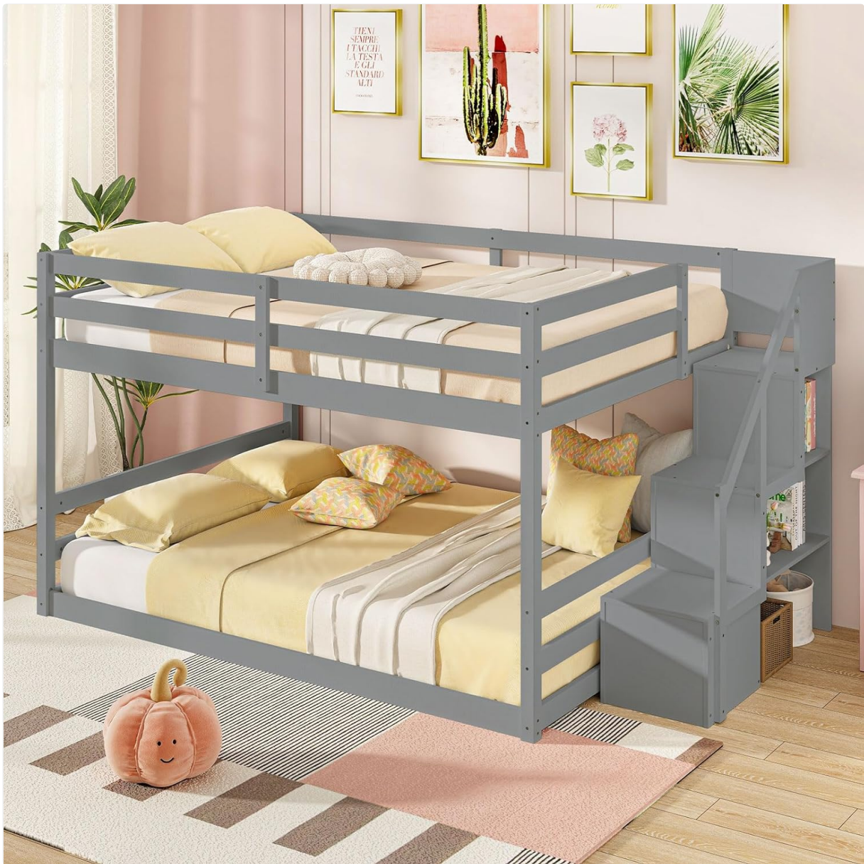
Image: The Giantex Full Over Full Bunk Bed in grey, featuring a top bunk, a bottom bunk, and an integrated staircase with storage compartments on the right side.