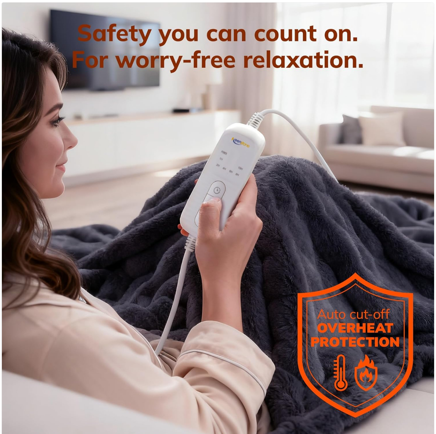
Figure 2: User operating the blanket with the controller, demonstrating the auto cut-off overheat protection.