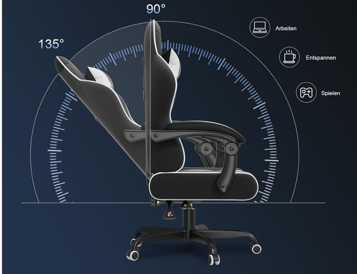
Image: Backrest recline angles for various activities.

Gaming-Stuhl mit verstellbarer Rückenlehne (90°–135°), ausziehbarer Fußstütze und elektrischer Lendenmassagefunktion. Ergonomisches Design – perfekt für verschiedene Aktivitäten: