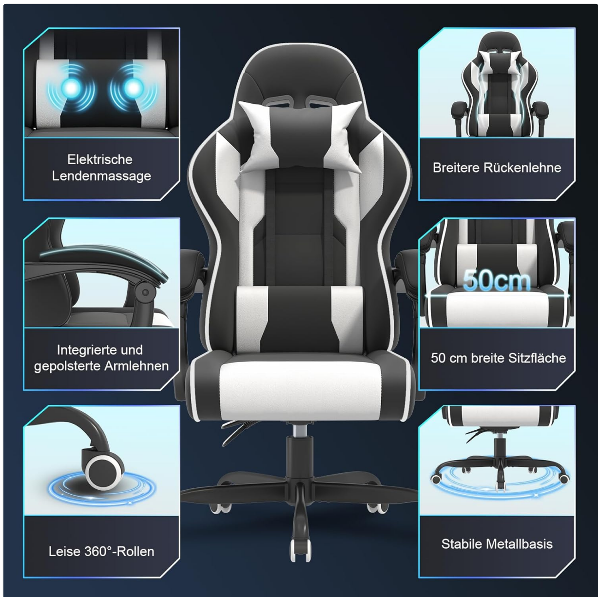
Image: Overview of JUMMICO JETSTREAM chair components and features.