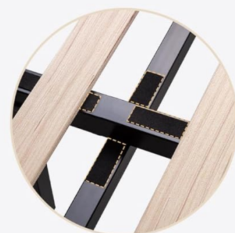
Sturdy Metal Structure