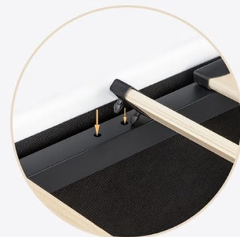
Easy Assembly Slats