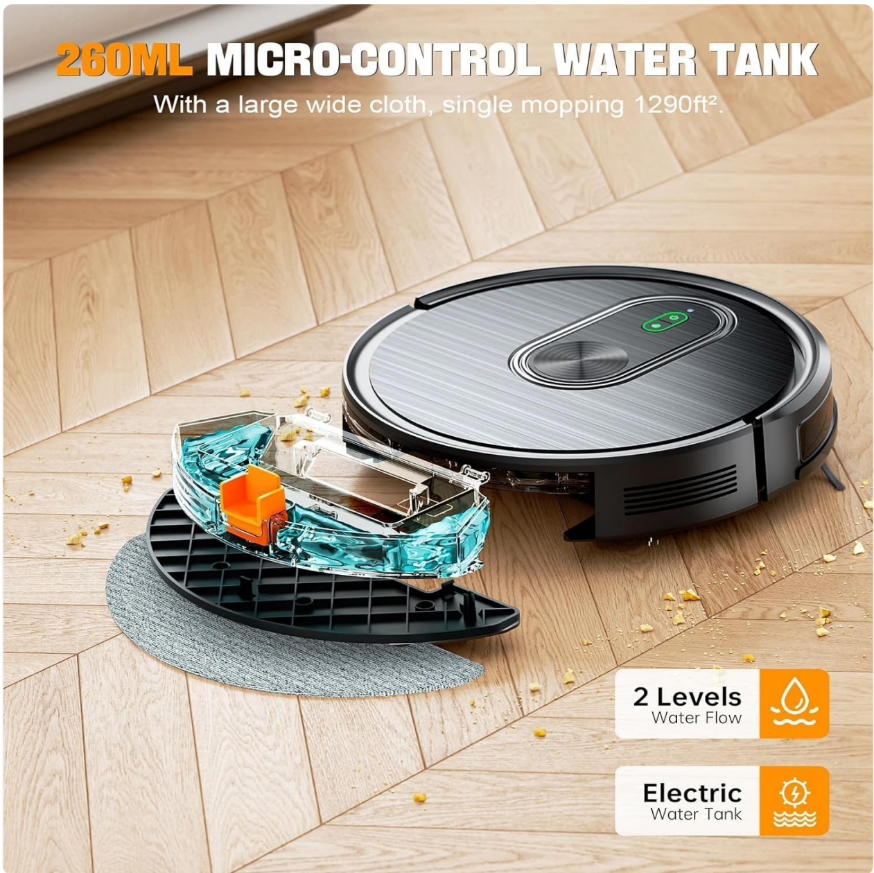
Figure 3: Detachable water tank and dust box for easy filling and emptying.

With a large wide cloth, single mopping 1290ft 2 .