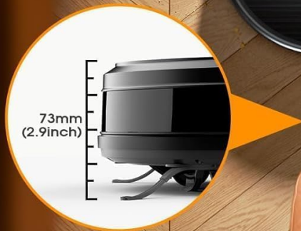
Figure 6: The 2.9-inch slim design of the XIEBro T8S Robot Vacuum allows it to clean under low furniture.

This image highlights the XIEBro T8S Robot Vacuum's ultra-slim 2.9-inch design, showcasing its ability to easily navigate and clean under furniture like sofas and beds, reaching areas that are typically hard to access.