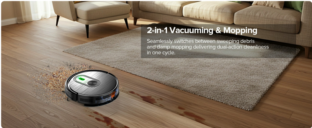
Figure 1: XIEBro T8S Robot Vacuum Cleaner and Included Accessories.

This image displays the XIEBro T8S Robot Vacuum Cleaner along with its complete set of accessories, including the remote control, charging base, power adapter, water tank, dustbin, side brushes, cleaning brush, filter, mop board, and mop pad.