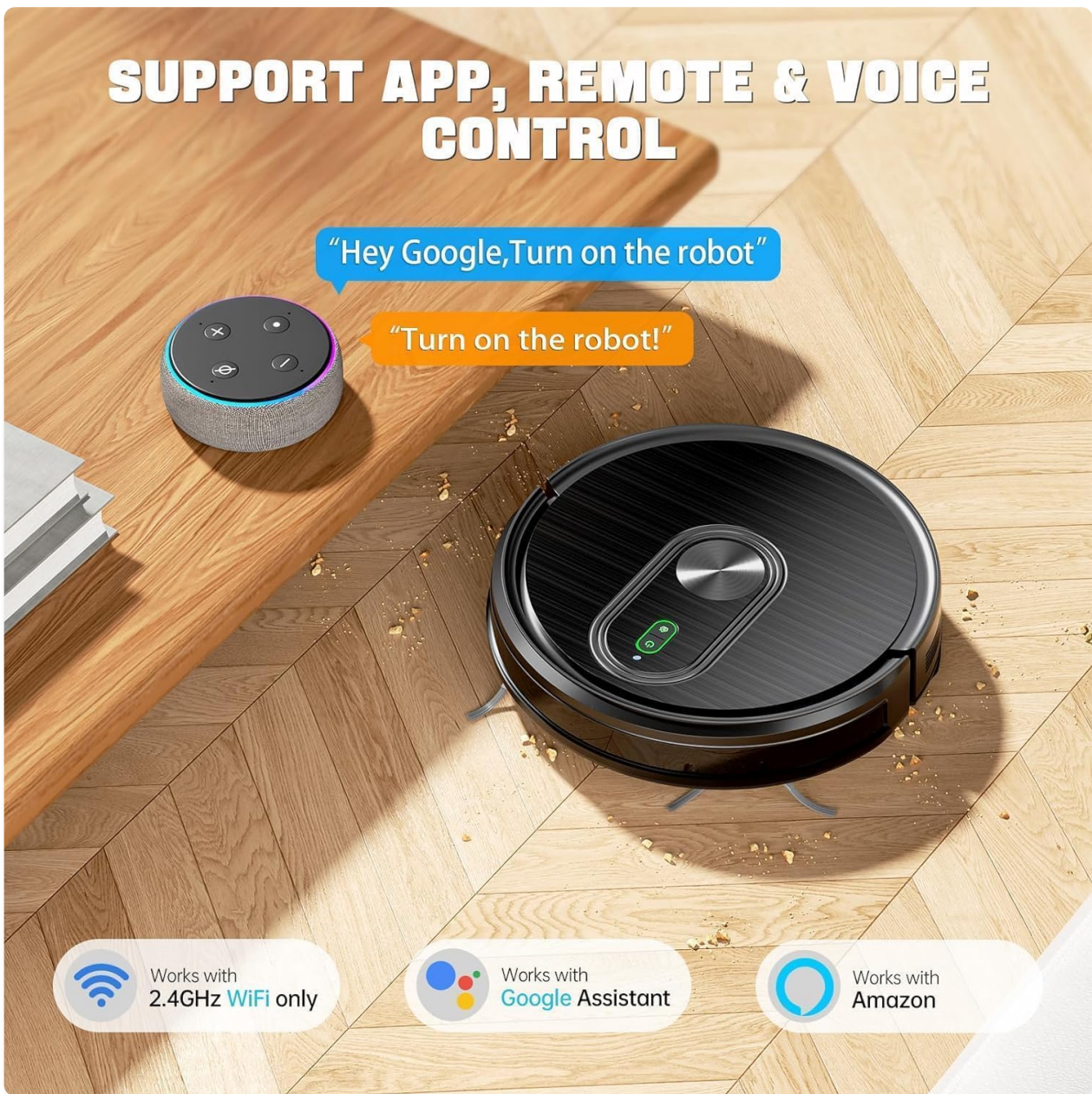
Figure 4: Control options for the XIEBro T8S Robot Vacuum, including app, remote, and voice commands.

This image displays the XIEBro T8S Robot Vacuum Cleaner alongside various control methods: a smartphone running the Tuya Smart App, a remote control, and voice assistants like Google Assistant and Amazon Alexa.