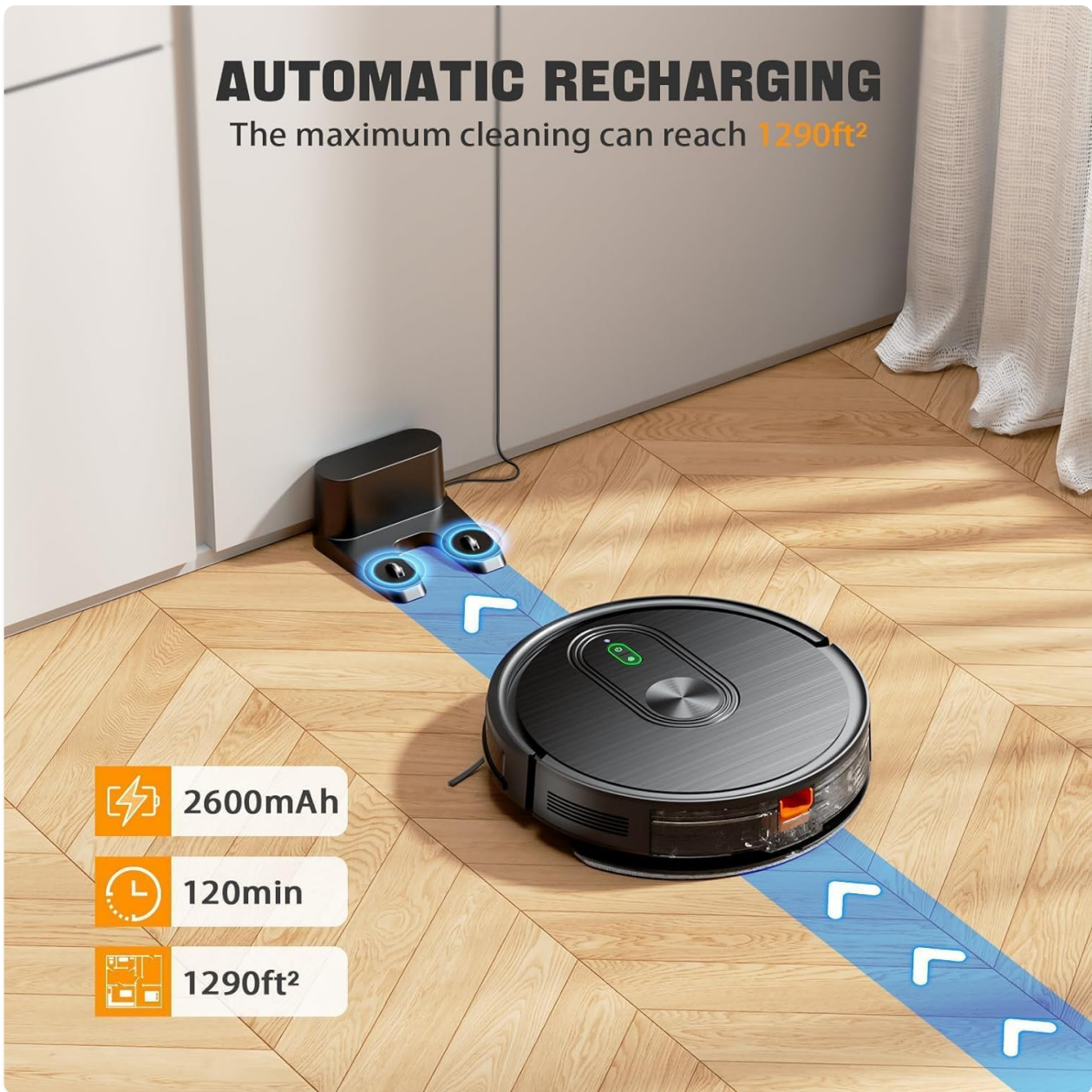
Figure 2: Robot vacuum automatically returning to its charging base.

This image illustrates the XIEBro T8S Robot Vacuum Cleaner automatically navigating back to its charging base when its battery is low or a cleaning cycle is complete.