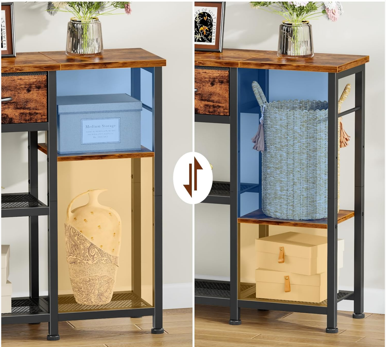
Figure 4: The adjustable shelf allows for customized storage configurations.