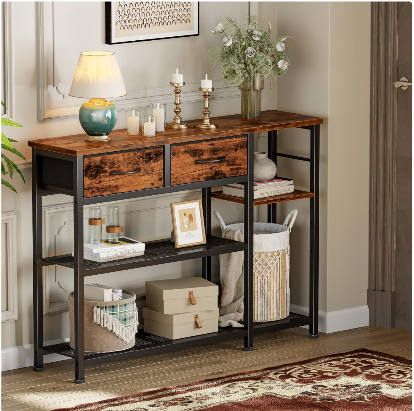
Figure 6: An example of the table's use in an entryway, offering both display and storage capabilities.