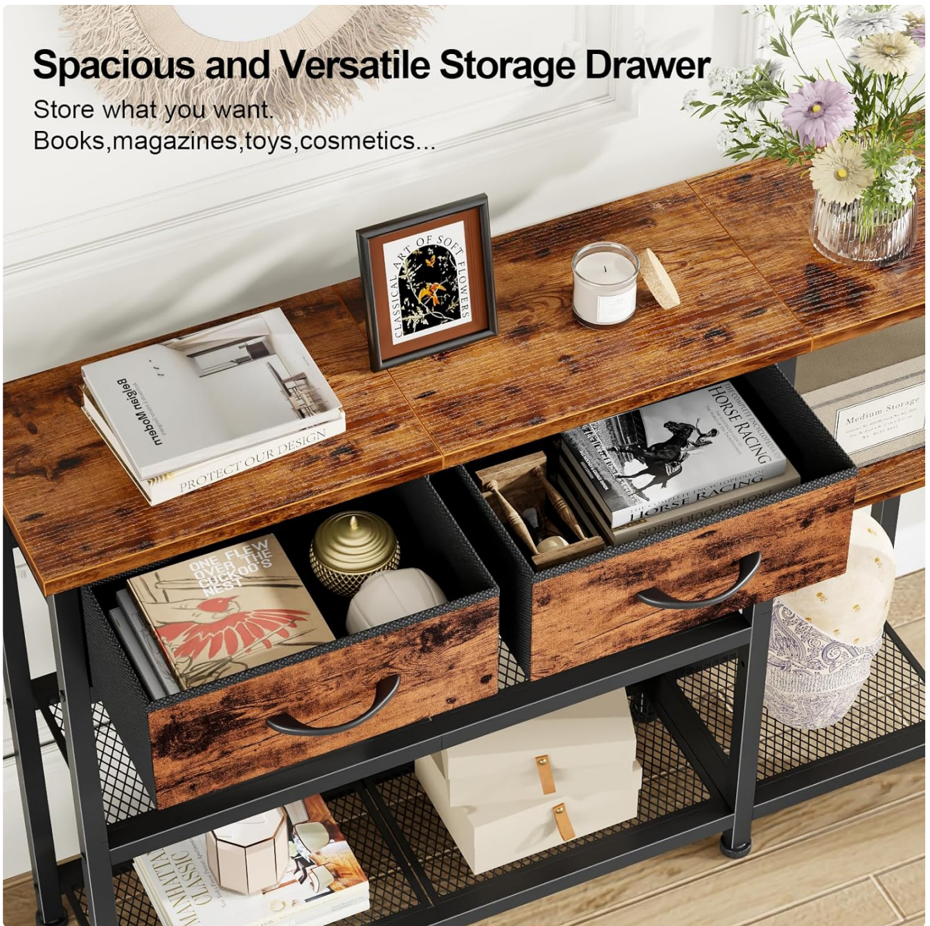
Figure 3: The two fabric drawers offer concealed storage for small items.