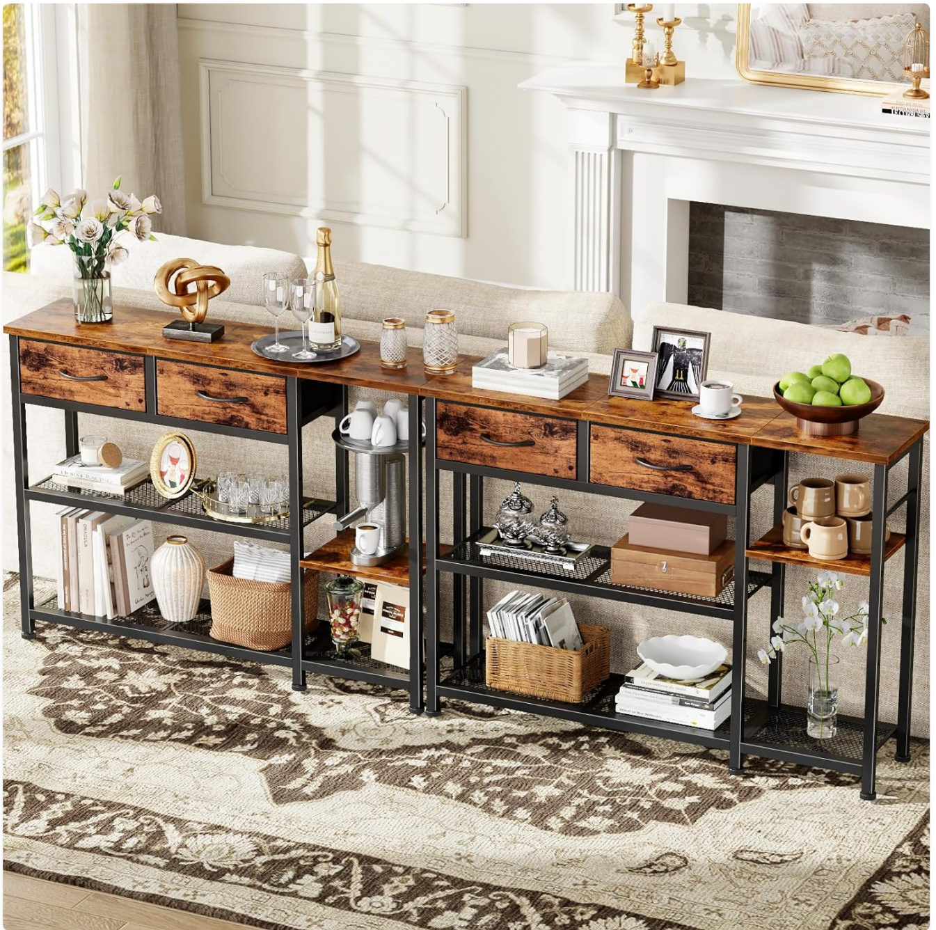
Figure 5: The table functions effectively as a sofa table, providing convenient surface and storage behind seating.