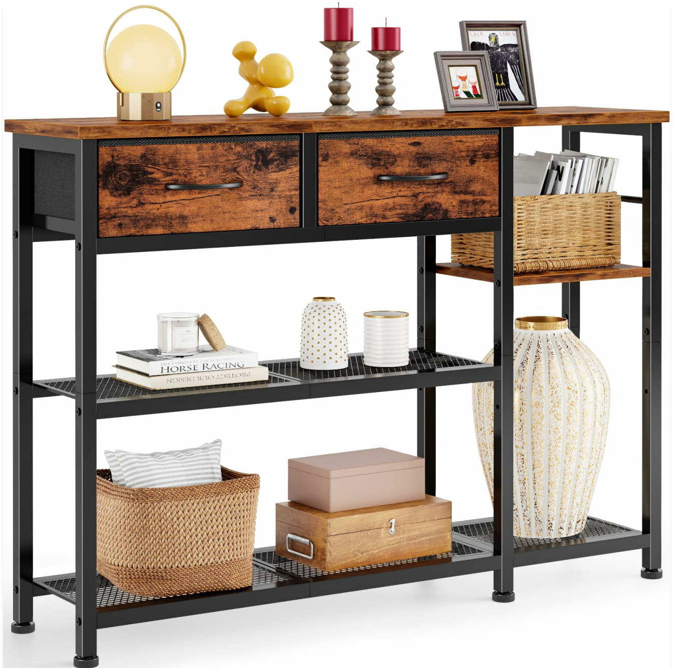
Figure 1: Furnulem 44-inch Entryway Sofa Console Table in a home setting, showcasing its rustic brown wooden top, black metal frame, and storage options.