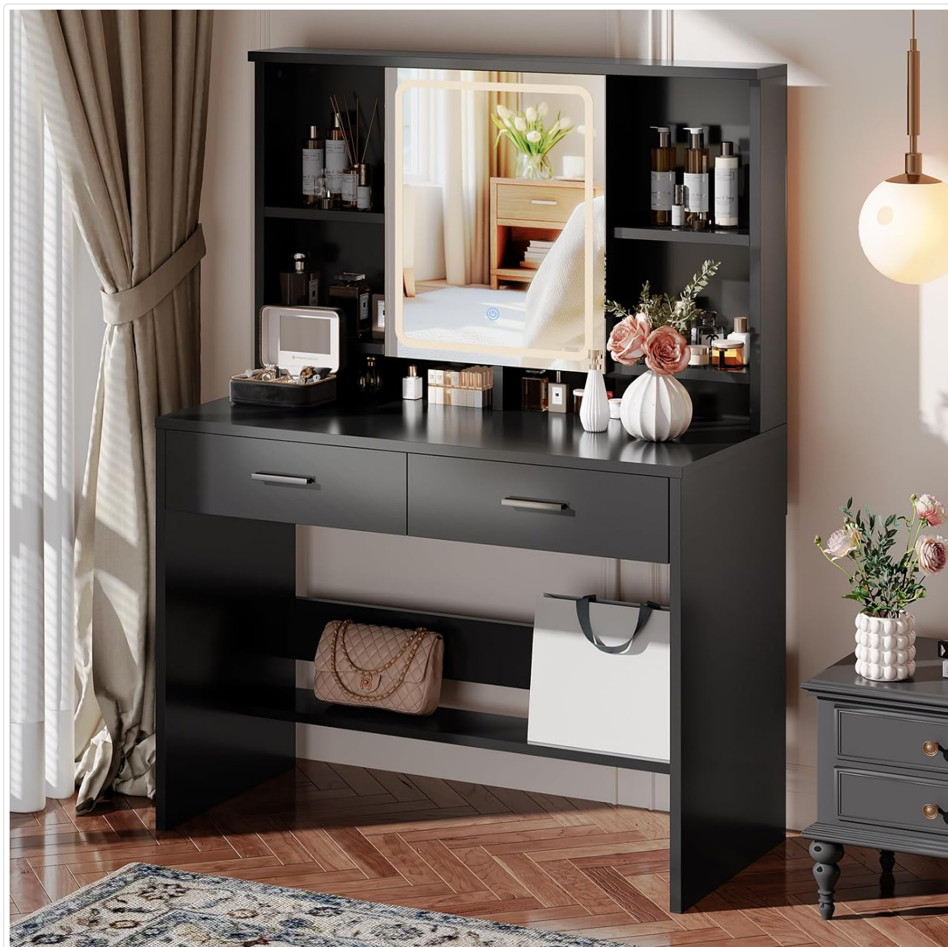
Image 5.1: The LED mirror offers Natural Light, Cool White, and Warm White settings, controlled by touch.