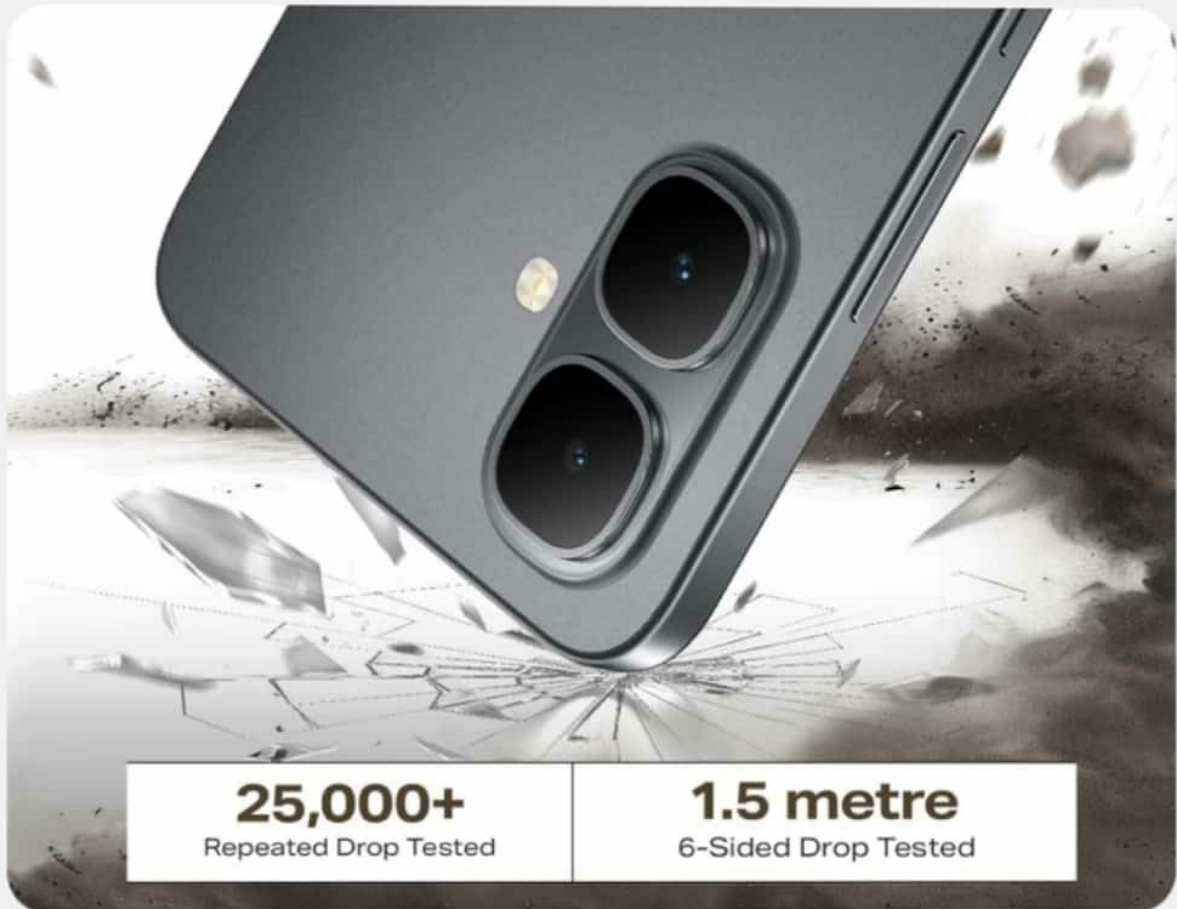
Image: The Infinix Smart 10 demonstrating its robust build and resistance to drops.