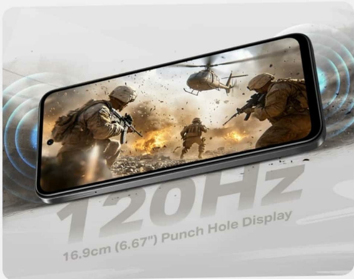
Image: The Infinix Smart 10 display showcasing vibrant visuals and the 120Hz refresh rate.