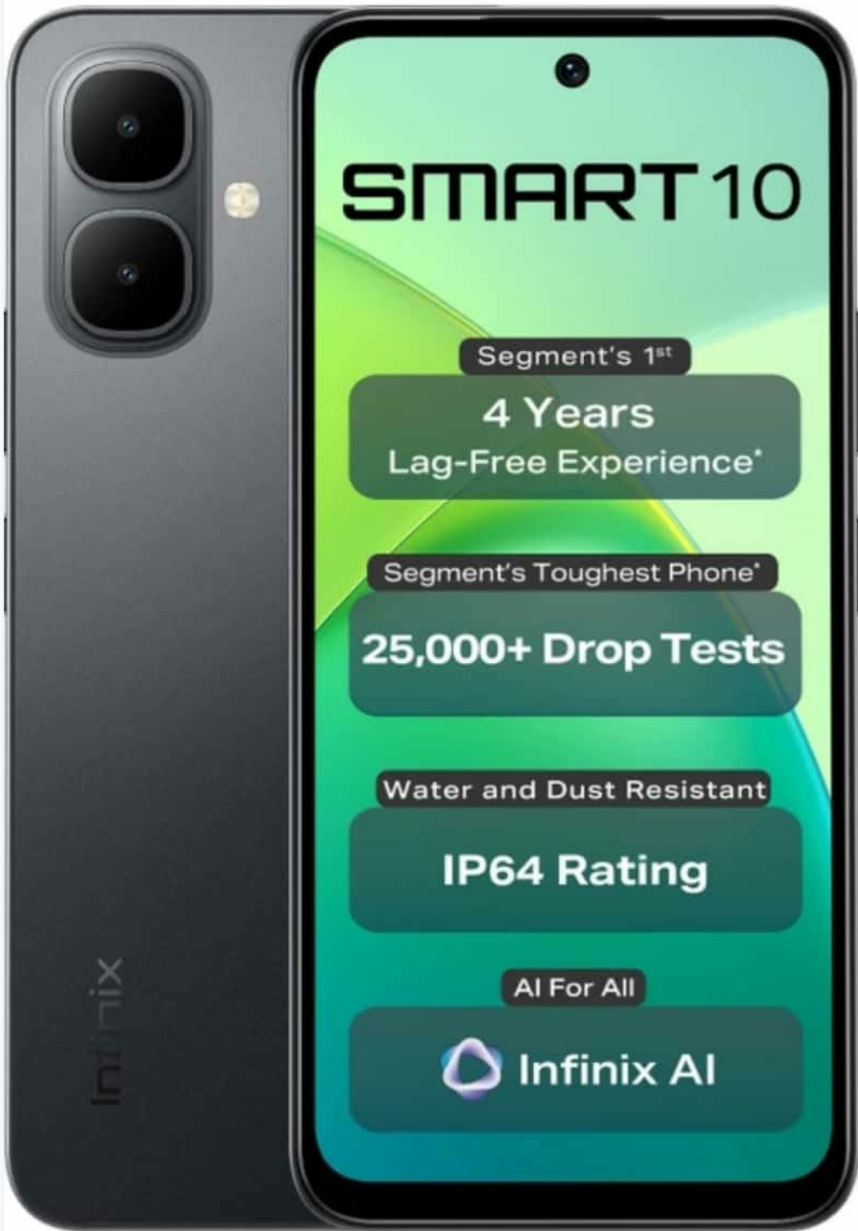
Image: Infinix Smart 10 smartphone, showcasing its design and highlighted features such as durability and performance.