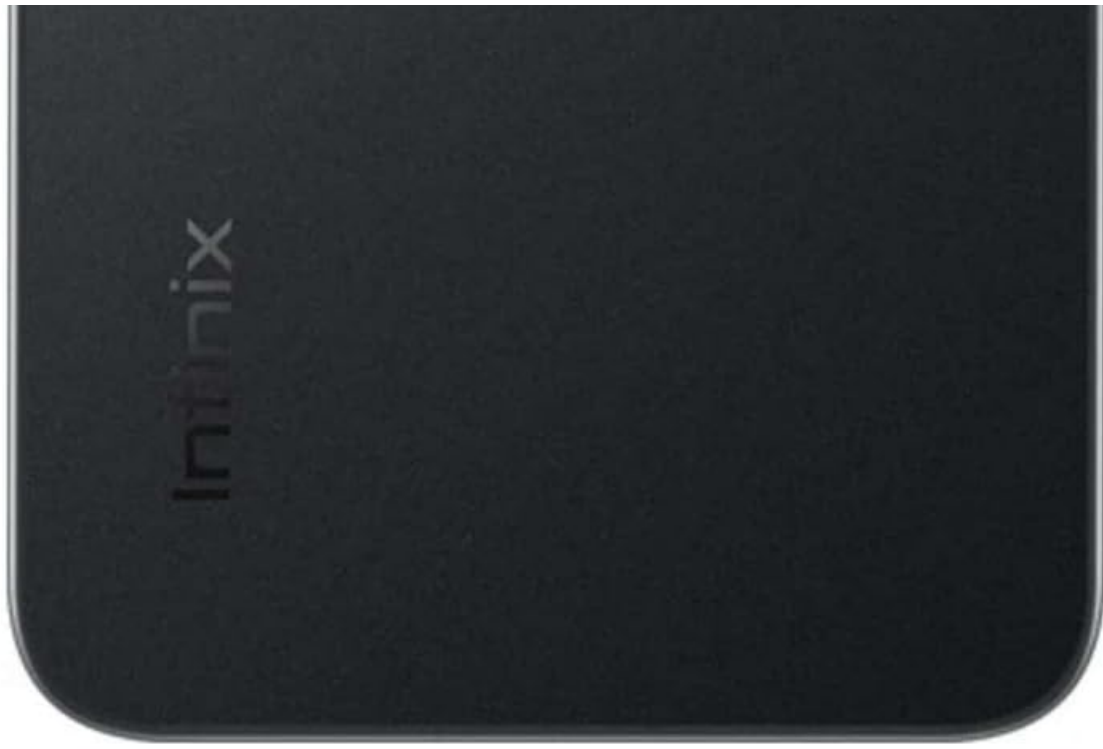
Image: Rear view of the Infinix Smart 10, showing the camera setup and branding.