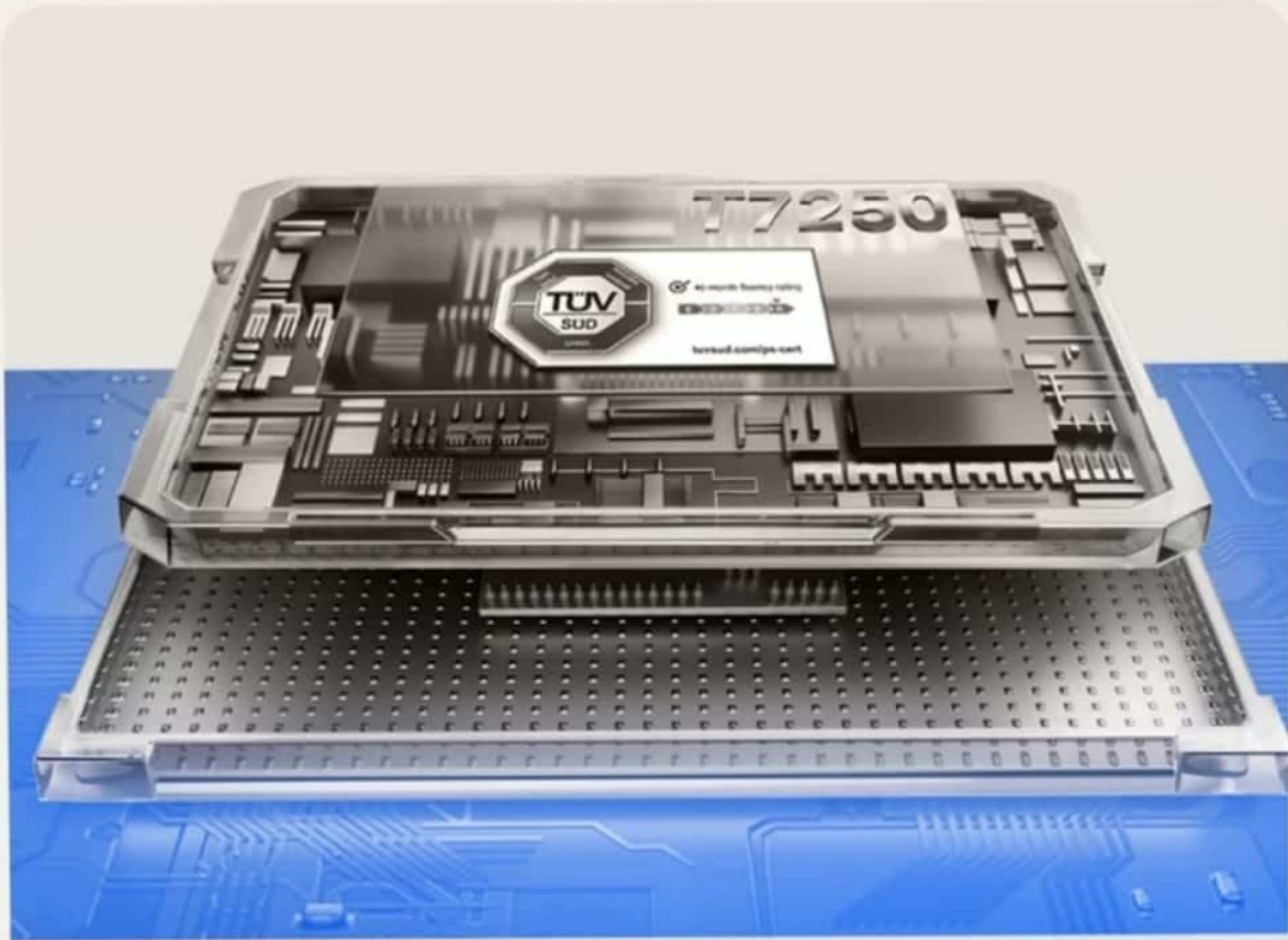
Image: A visual representation of the UniSoC T7250 processor, highlighting its performance capabilities.