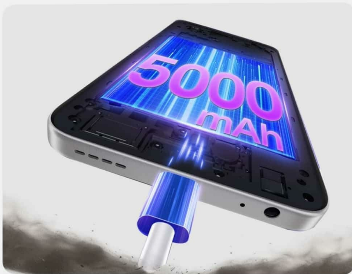
Image: The Infinix Smart 10 connected to a charger, illustrating its 5000mAh battery.

28 Days* Standby Time | 40 Hours* Calling Time | 100 Hours* Music