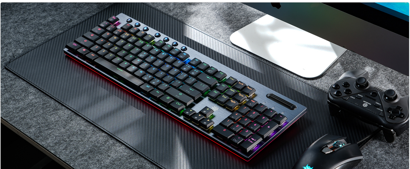
Figure 6: The Hexgears GK1702 keyboard demonstrating its long-lasting 4000mAh battery, offering up to 360 hours of working time with backlighting off and 90 hours with backlighting on.

The GK1702 is equipped with a 4000mAh battery, providing approximately 360 hours of use with backlighting off, or 90 hours with backlighting on. To maximize battery life, consider adjusting RGB brightness or turning off backlighting when not needed. Recharge or replace AA batteries as necessary.