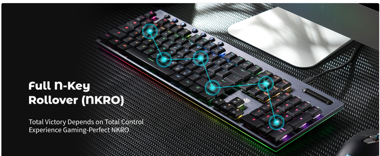
Figure 4: The Hexgears GK1702 keyboard showcasing its 16.8 million RGB backlit keys and synchronized ambient lighting strip, creating a vibrant visual effect.