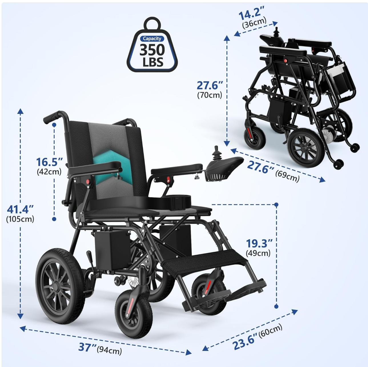
Dimensions and Capacity: Visual representation of the wheelchair's key measurements and its 350 LBS weight capacity.